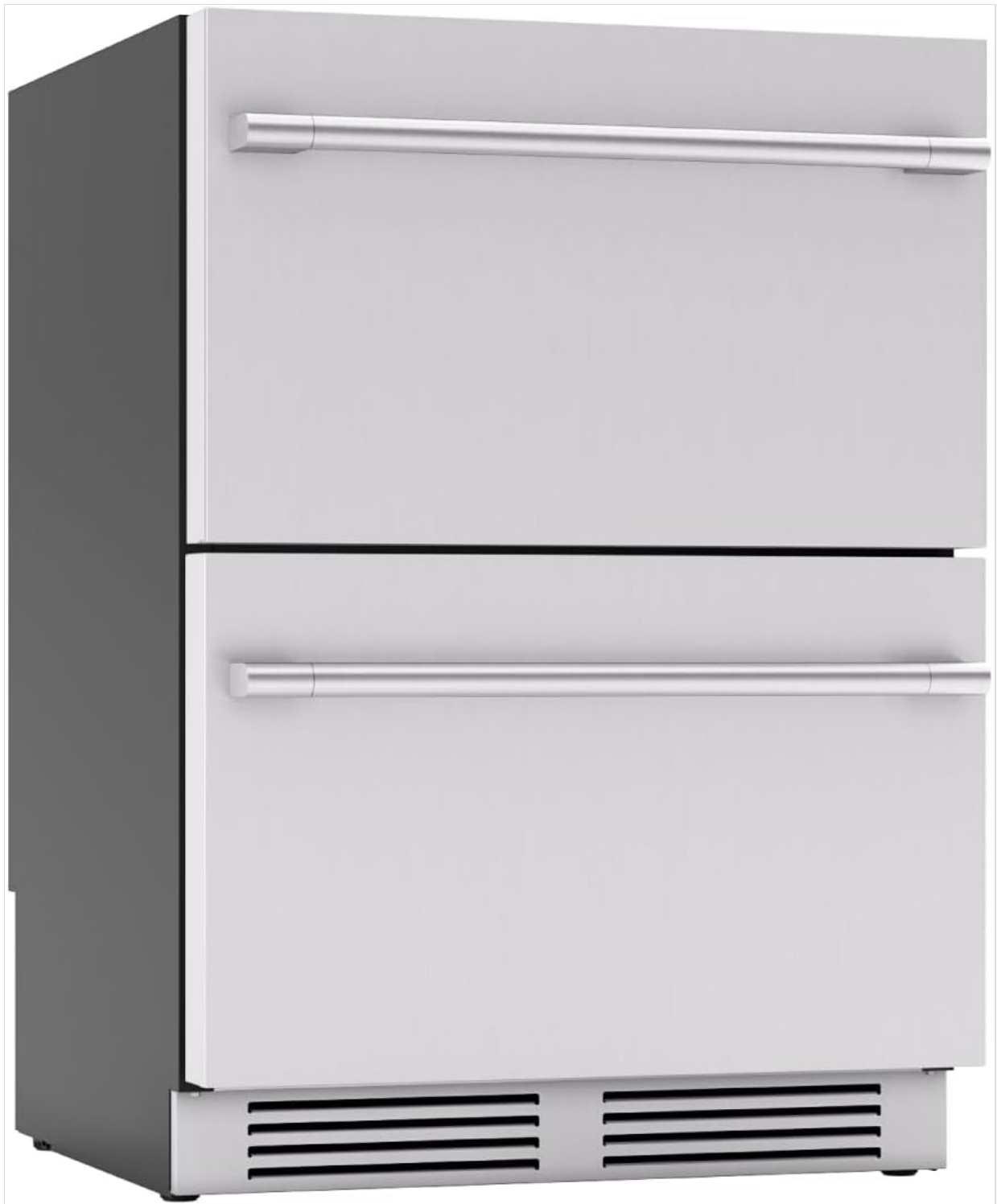
Figure 1: Front view of the Zephyr Presrv 24-inch Dual Zone Refrigerator Drawers. This unit features two stainless steel drawers with handles, designed for under-counter installation.