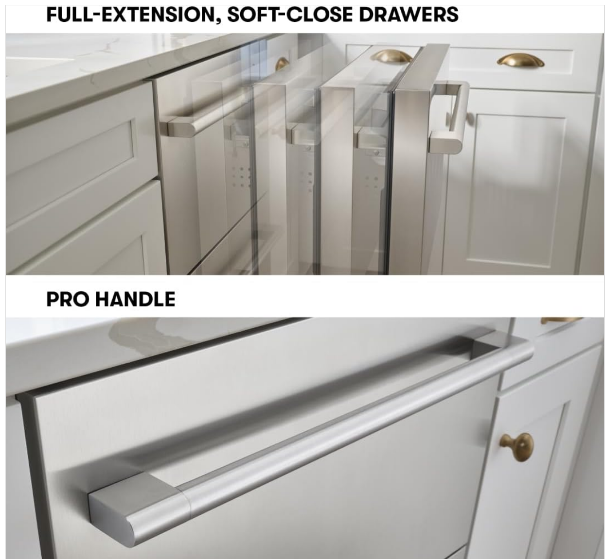
Figure 4: Illustration of the full-extension, soft-close drawer mechanism and the stylish Pro Handle.

The full-extension, soft-close drawers ensure smooth and quiet operation, preventing items from shifting. Adjustable dividers and a silicone mat help keep contents organized and secure.