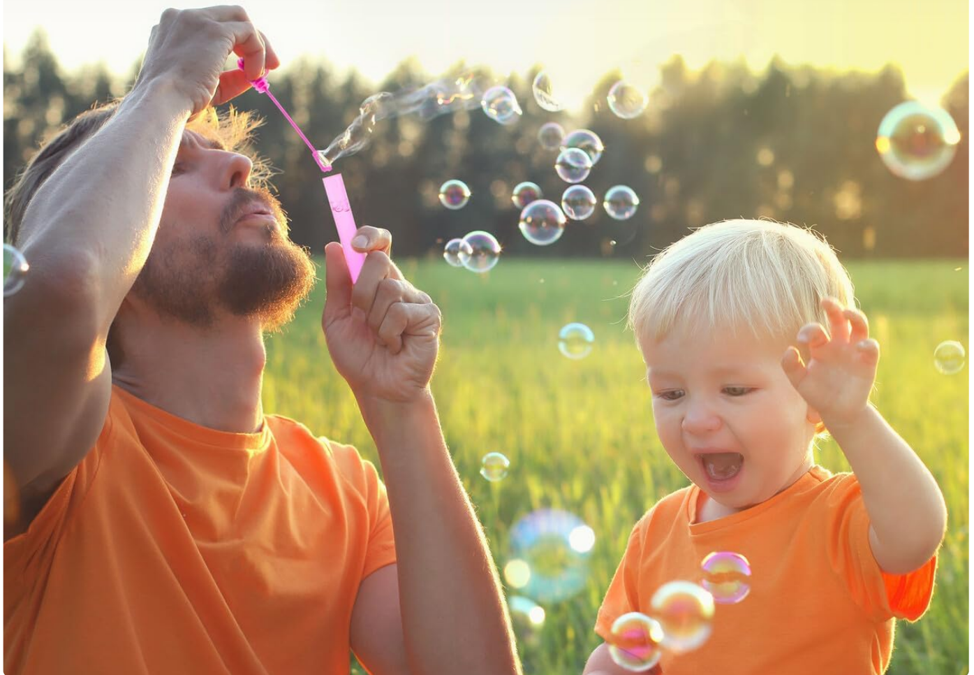
Image: A man and a young child happily blowing bubbles in a sunny outdoor setting, emphasizing the product's safety for children.

ENSURING A SAFE AND WORRY-FREE EXPERIENCE