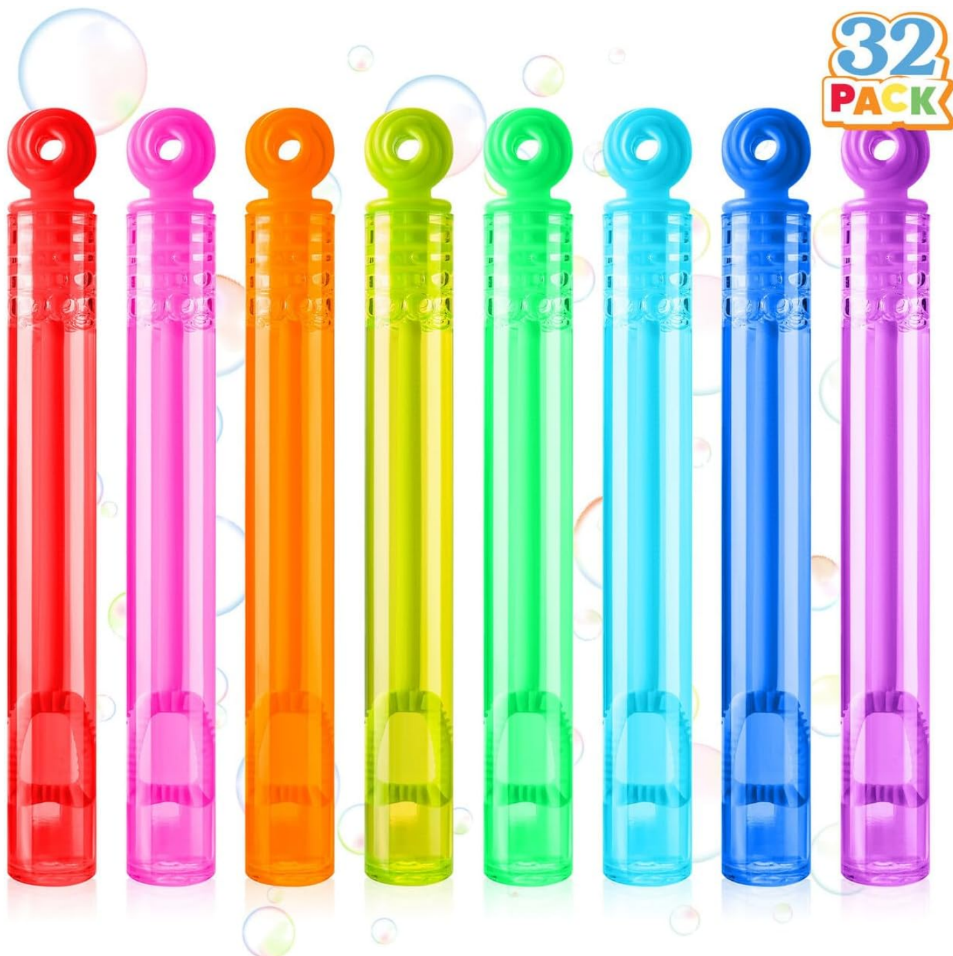
Image: A collection of eight mini bubble wands, each a different vibrant color, standing upright. Bubbles are visible in the background, illustrating the product's function.