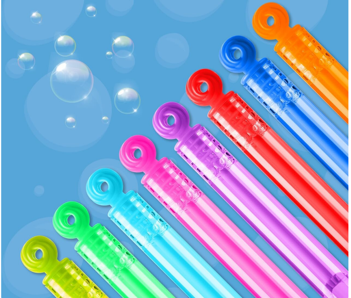
Image: A vibrant display of mini bubble wands in different colors, illustrating the variety available in the pack.