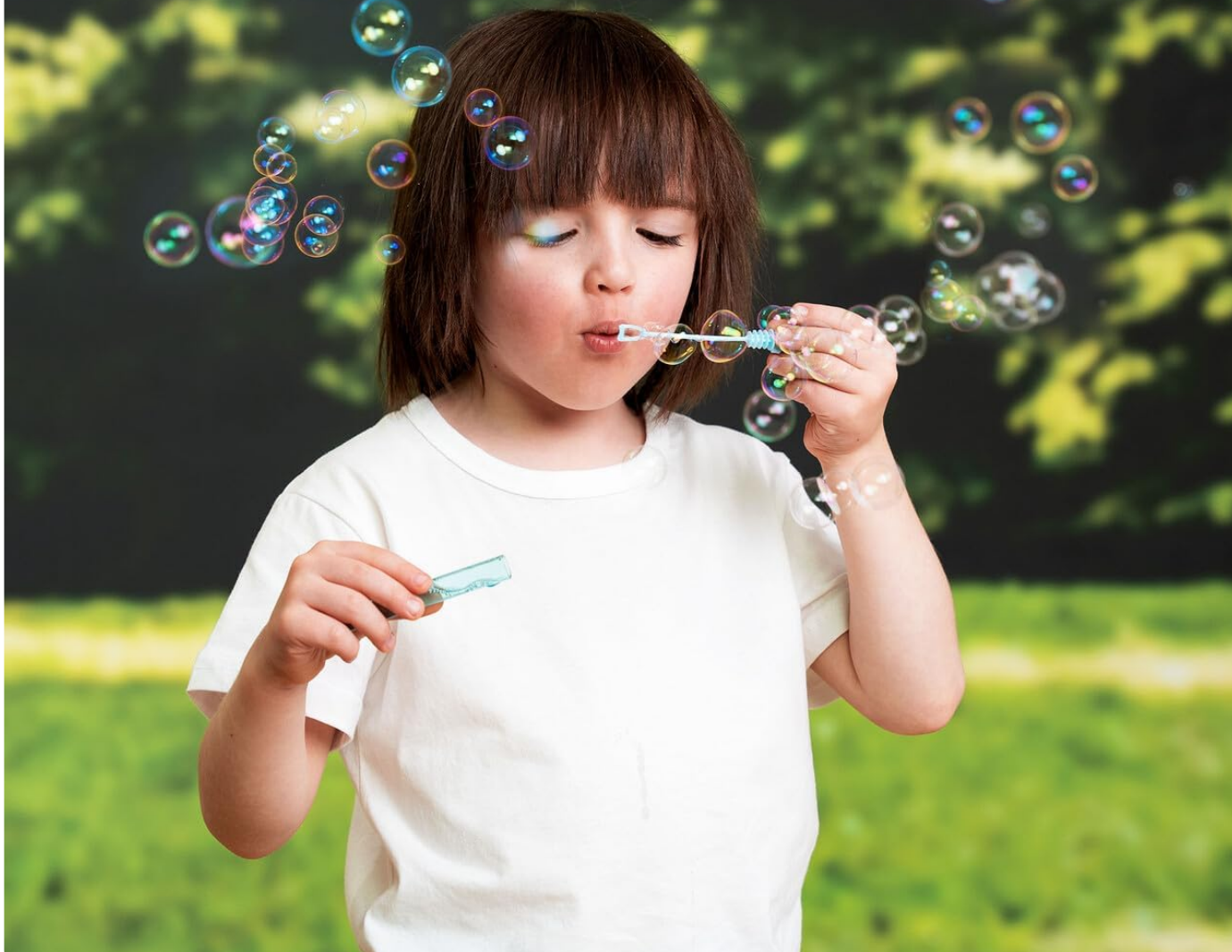
Image: A boy enjoying blowing numerous bubbles from a mini bubble wand, illustrating the product's ability to create many bubbles effortlessly.