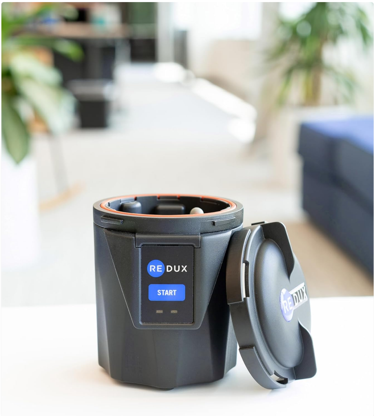
Redux Home Dryer, a device designed for moisture removal from hearing aids and other small electronics.