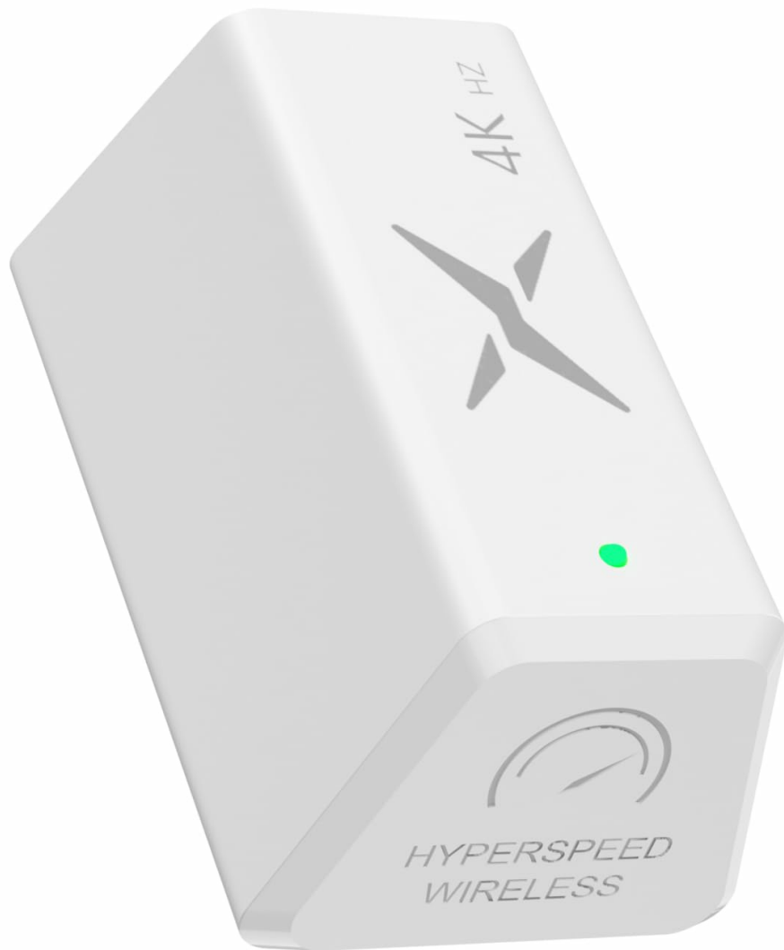
Image 1: DELUX Ultra-Fast Wireless 4K Receiver (White model shown).