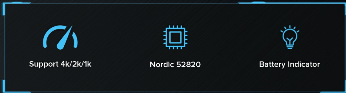
Image 2: Visual representation of 4000Hz polling rate benefits compared to 1000Hz.