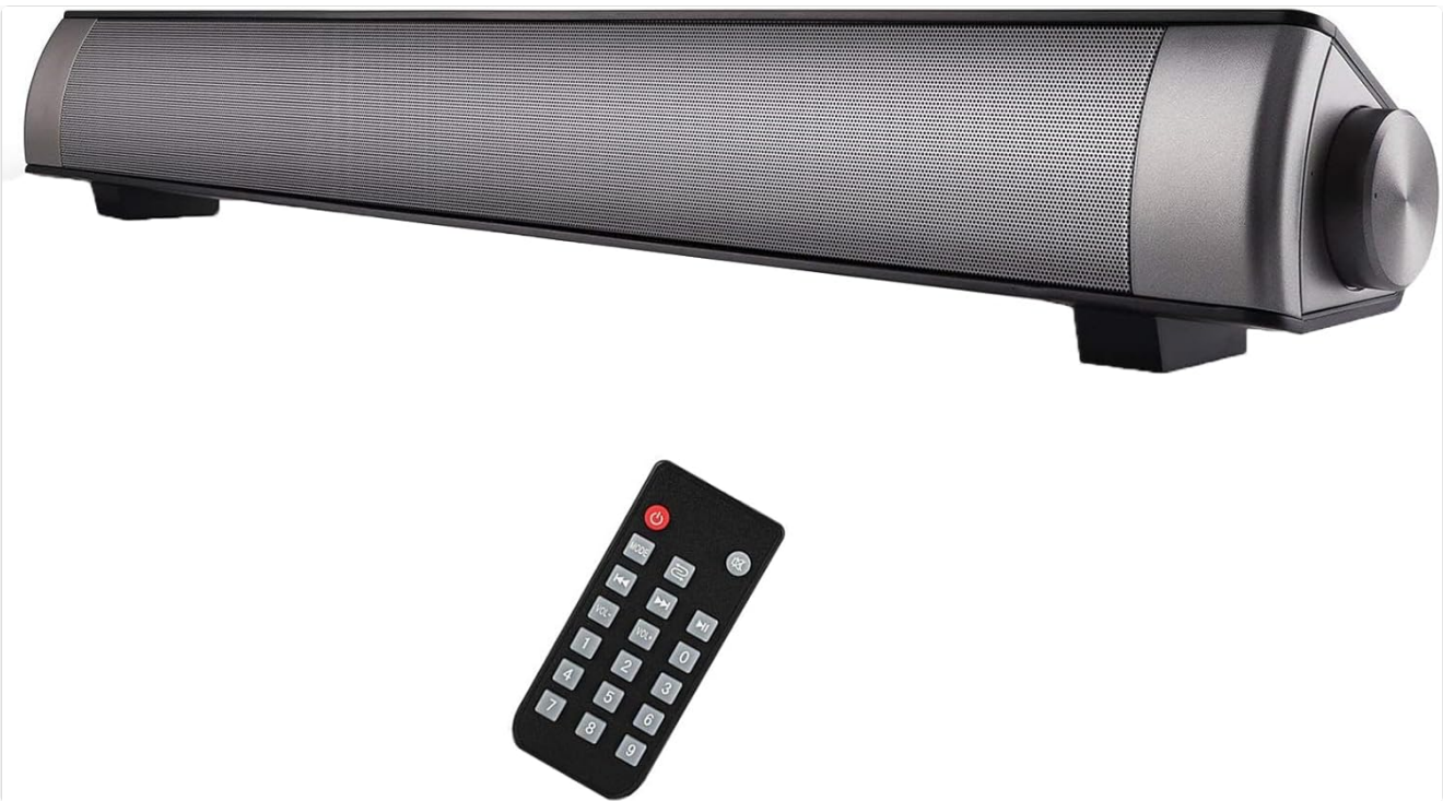
Image: TOPROAD Bluetooth Speaker and its accompanying remote control.