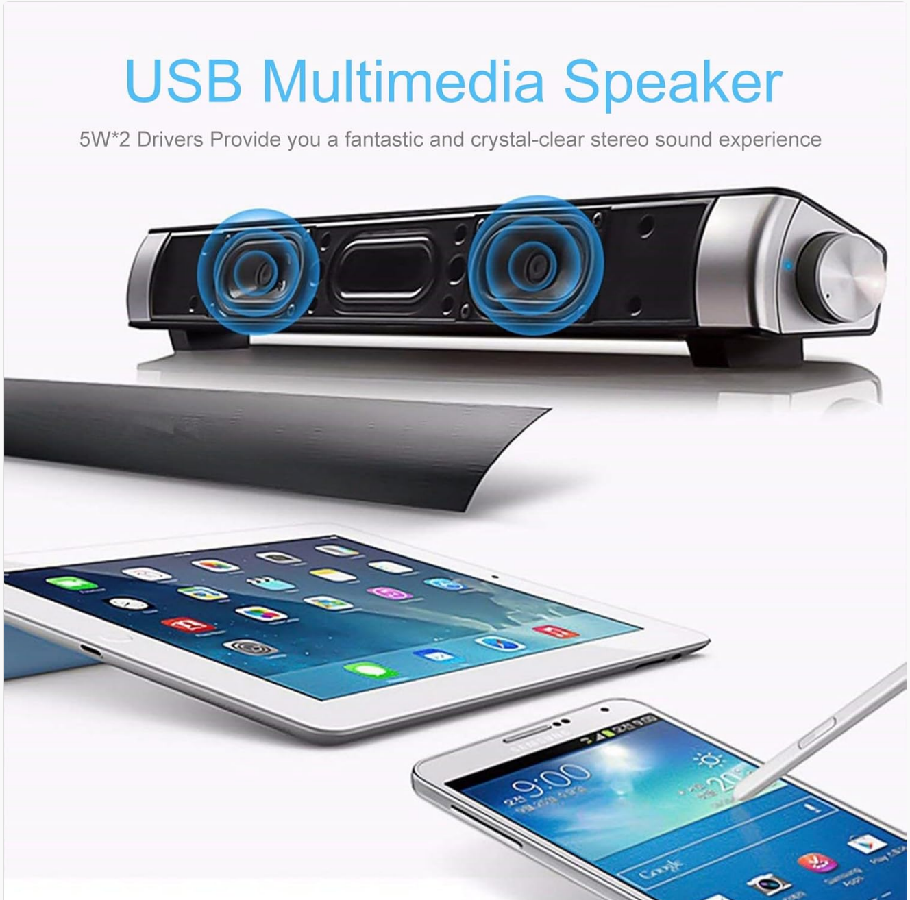
Image: The TOPROAD speaker functions as a USB multimedia speaker, providing clear stereo sound.

Connect the speaker to your computer or laptop via the USB cable. Most modern computers will recognize the speaker as an audio output device. Select the speaker as your default audio output in your computer's sound settings to play audio directly through the USB connection.