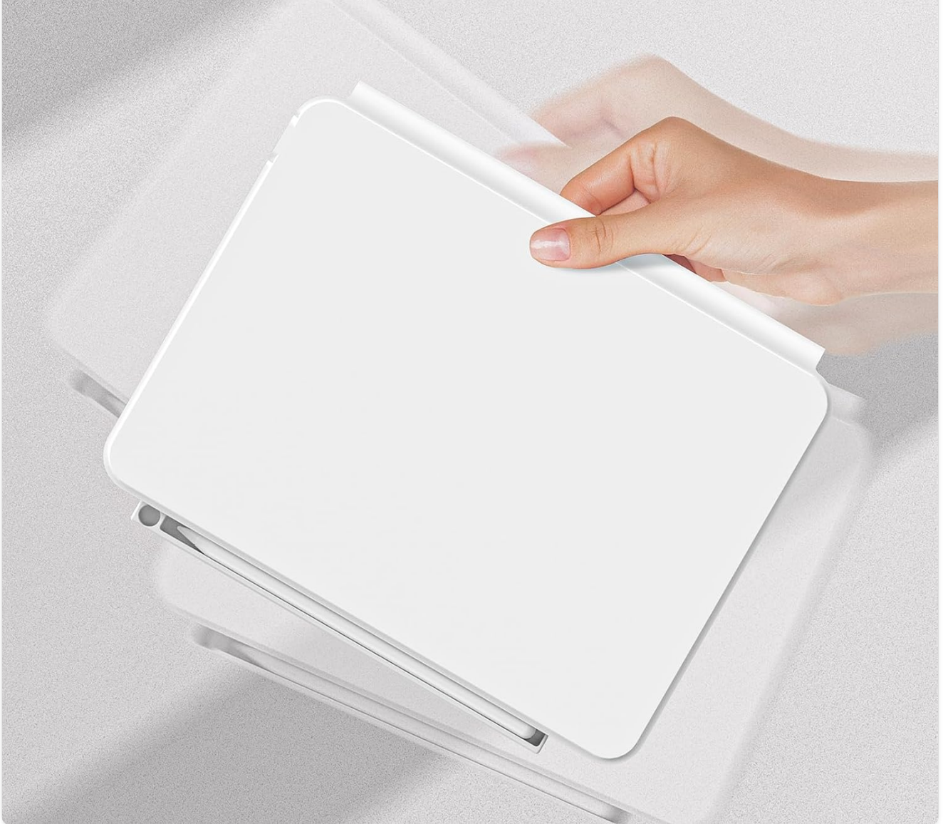
Figure 3.2: The stable design ensures the iPad remains securely attached to the keyboard case.