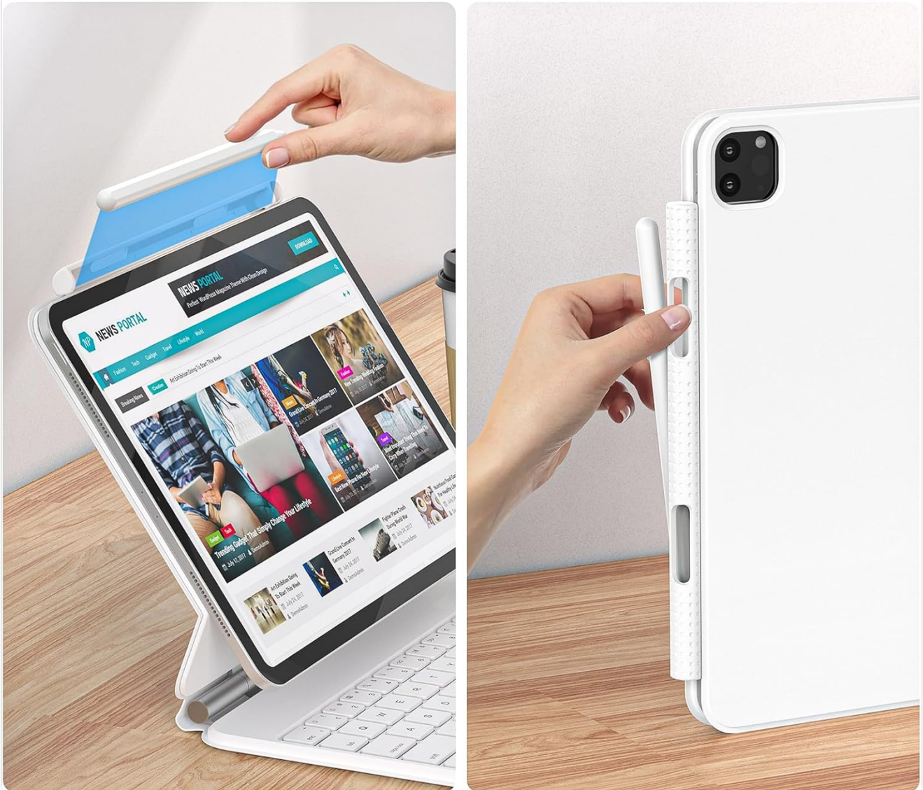
Figure 4.4: The pencil holder features an incision for easy removal of the pencil.

The incision is designed for easy removal of the pencil.