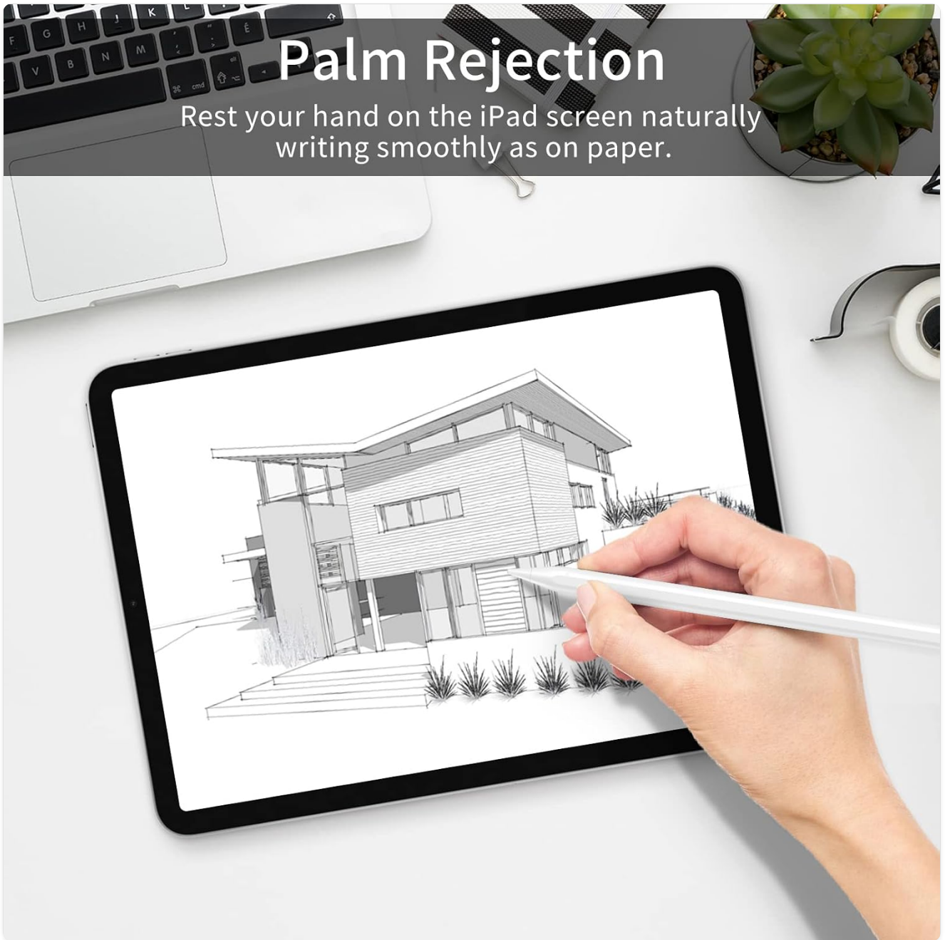
Figure 4.3: Palm rejection allows for natural hand placement on the screen while using the pencil.

Rest your hand on the iPad screen naturally writing smoothly as on paper.