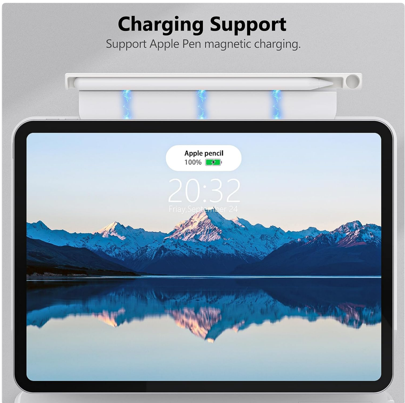
Figure 4.1: The GOOJODOQ pencil supports magnetic charging by attaching to the side of the iPad.