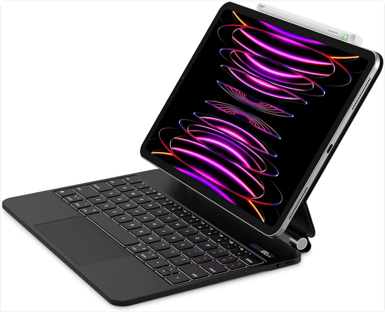
Figure 1.1: The GOOJODOQ Magic Keyboard Case with an iPad and the included pencil.