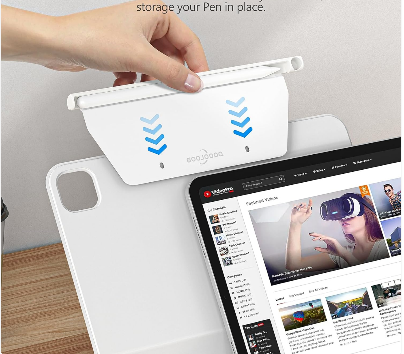
Figure 3.1: Illustration of installing the pencil holder between the iPad and the keyboard case.

Install the case between iPad and keyboard/case, storage your Pen in place.