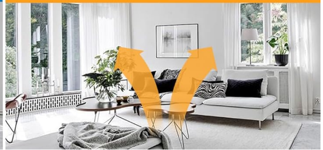
Figure 2: 6-Speed Reversible Function for Summer and Winter Modes.

Winter Mode reverse direction gently draw the air up