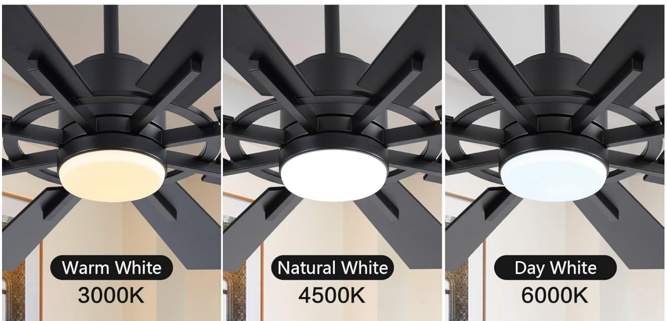
Figure 3: The 3 Color Temperatures Available for the Integrated LED Light.