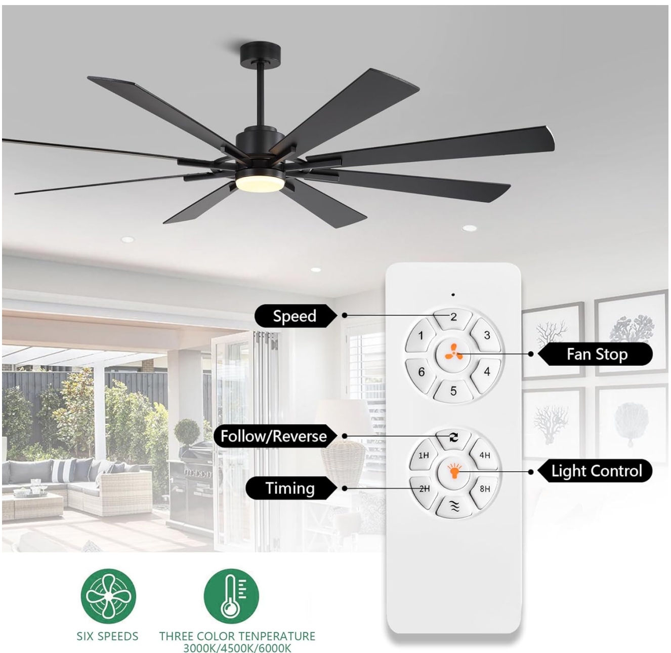
Figure 1: Remote control functions for the WINGBO 80-inch DC Ceiling Fan.

Secure the fan mounting bracket to the ceiling junction box using appropriate screws. Ensure it is firmly attached to a structural beam or a fan-rated outlet box.