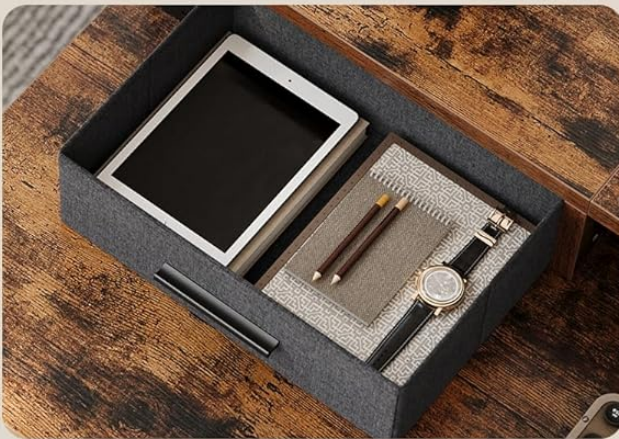
Tissu Oxford résistant