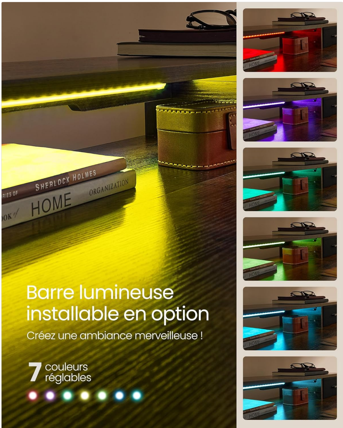
Figure 3.6: Adjustable LED lighting with 7 color options.