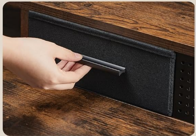
Poignées métalliques pratiques