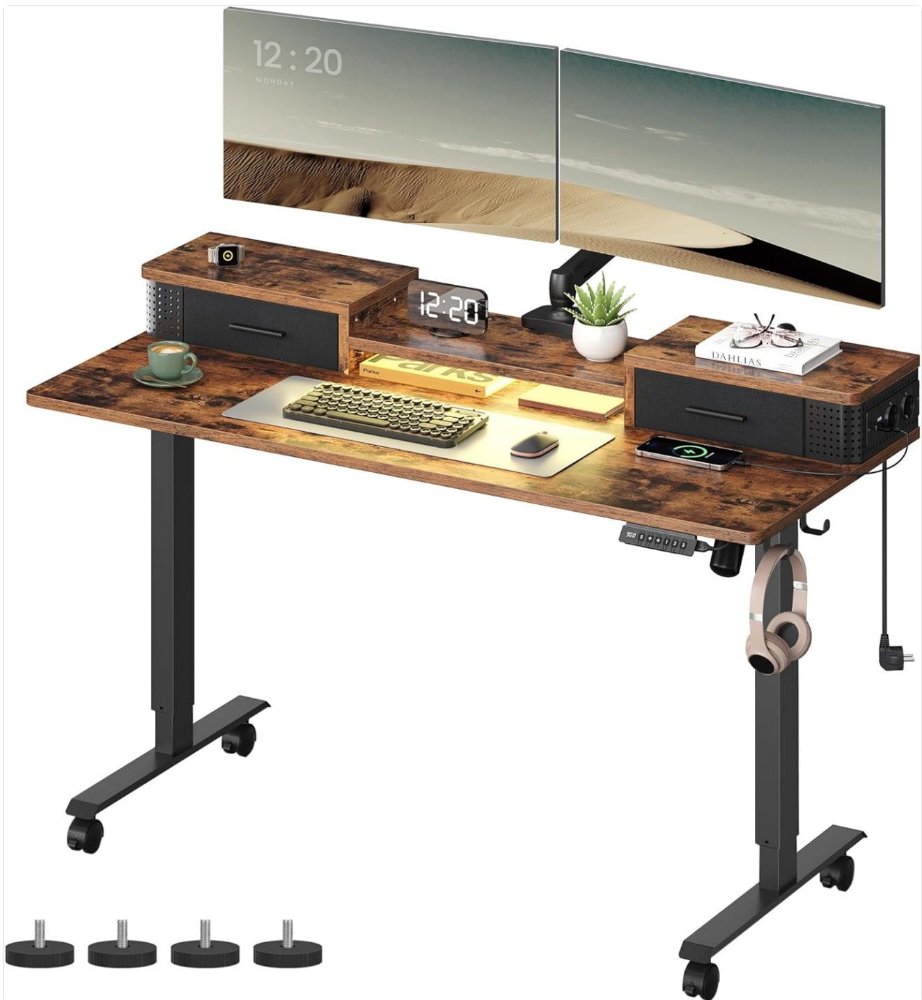
Figure 1.1: Overview of the VASAGLE Electric Height-Adjustable Standing Desk.