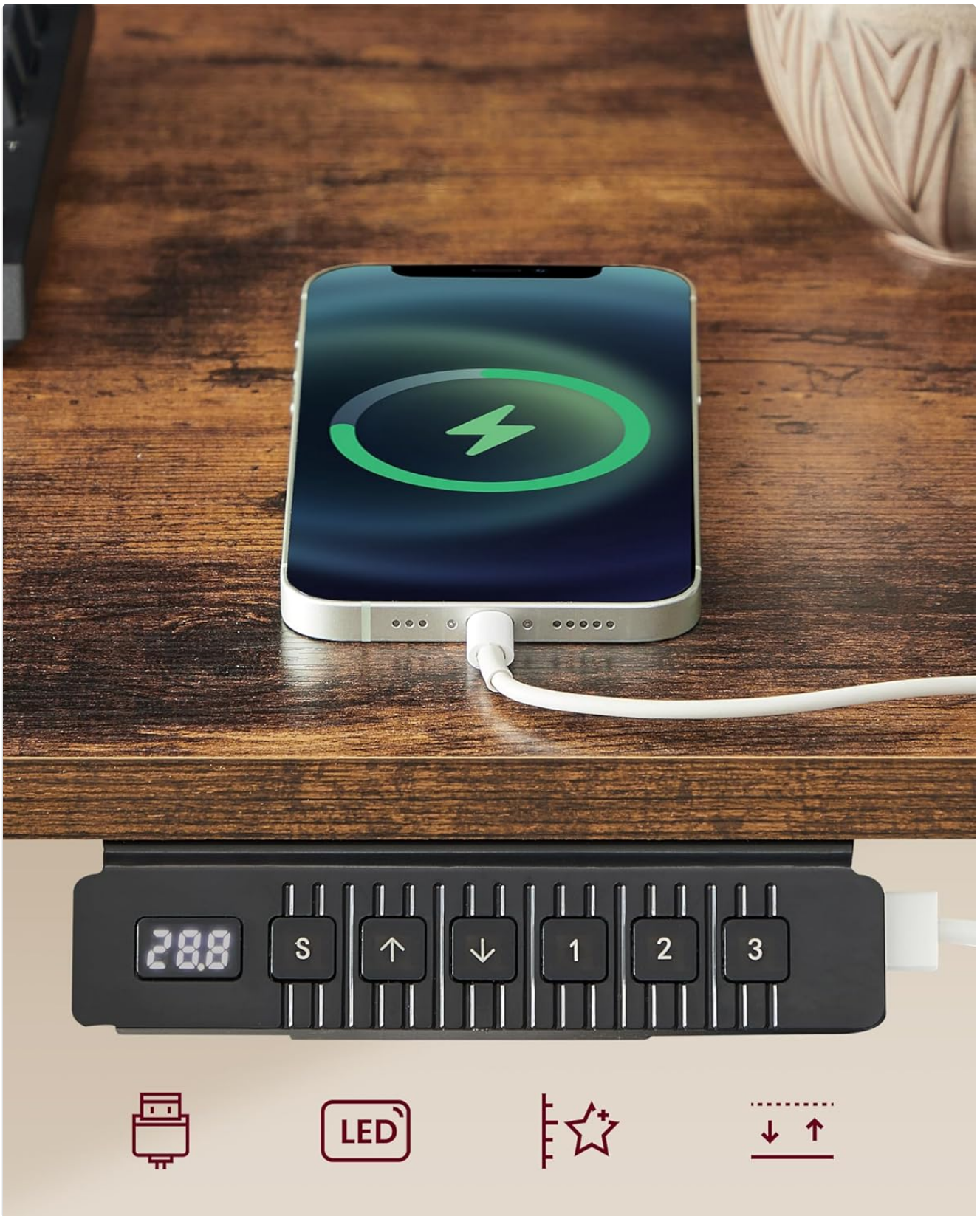
Figure 3.1: Control panel for height adjustment and memory functions.