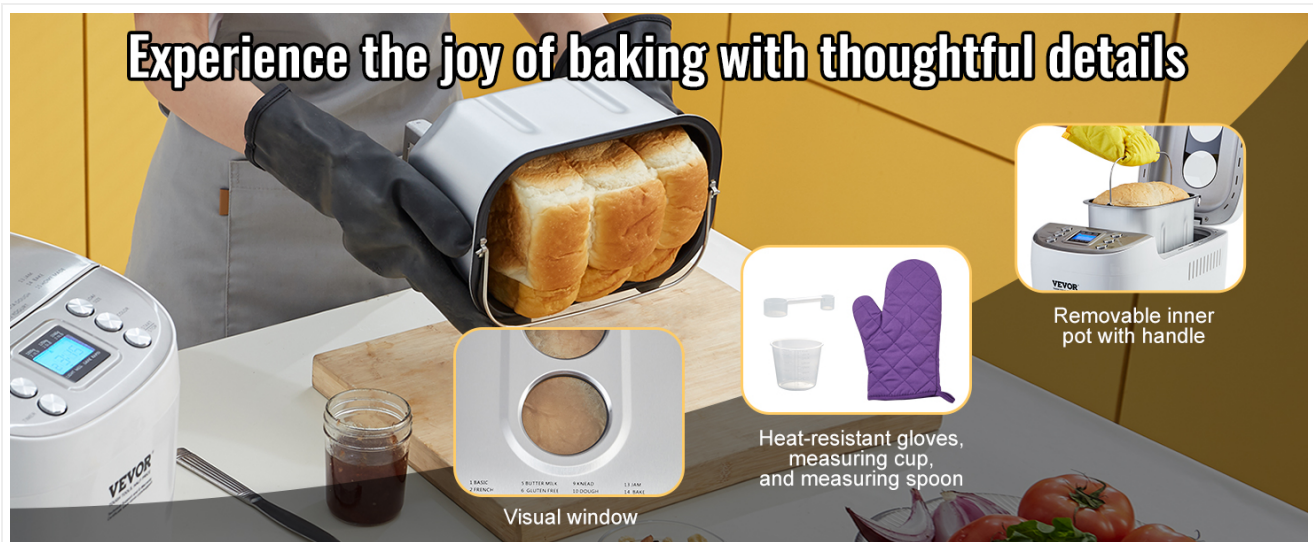
Image 3.1: Key components highlighted, including the visual window, removable inner pot with handle, heat-resistant gloves, measuring cup, and spoon.