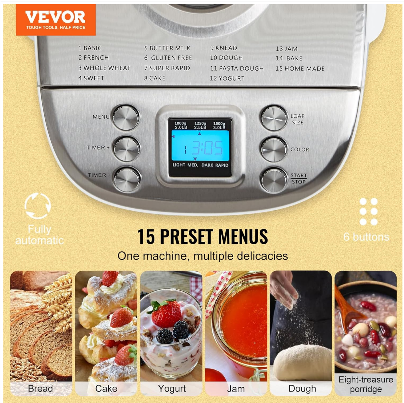
Image 5.1: The control panel displaying the 15 preset menu options and various control buttons.

The control panel features an LCD display and several buttons for program selection and settings adjustment: