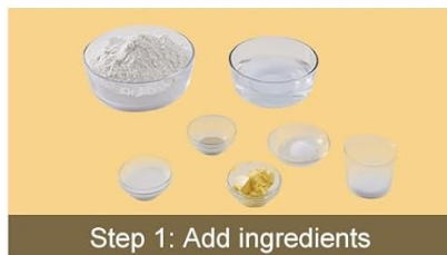
Step 1: Add ingredients

Prepare before bed, wake up to the aroma of fresh bread