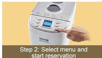
Step 2: Select menu and start reservation