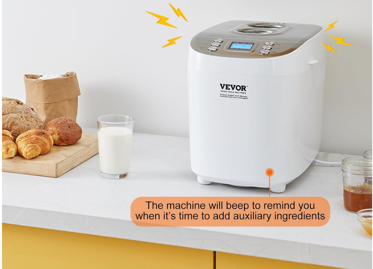
Image 5.4: The bread maker provides an audible reminder for adding extra ingredients during the baking cycle.

Thoughtful reminder design for adding additional ingredients