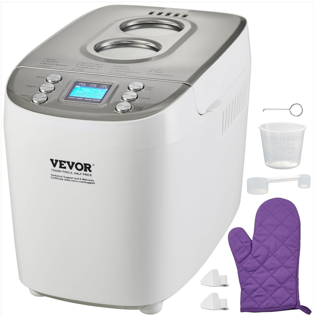
Image 1.1: The VEVOR Bread Maker shown with included accessories such as a measuring cup, spoon, and oven mitt.