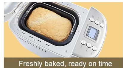
Freshly baked, ready on time

Image 5.3: The 15-hour smart reservation feature allows users to prepare ingredients in advance for fresh bread at a desired time.