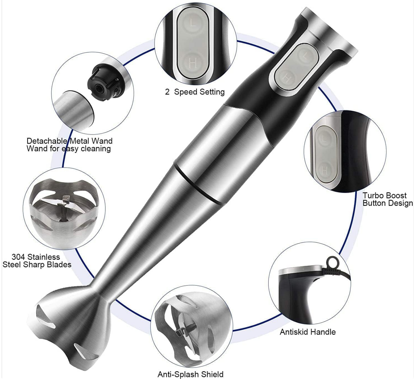
Image: Detailed diagram highlighting key features such as the detachable metal wand, 304 stainless steel sharp blades, anti-splash shield, antiskid handle, turbo boost button, and 2 speed settings.