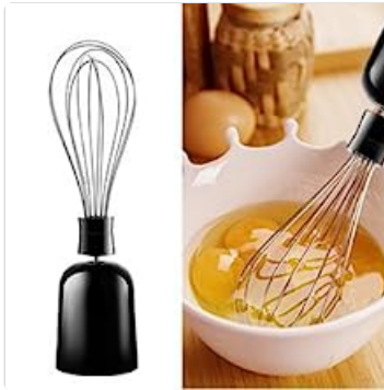
Image: The whisk attachment in action, demonstrating its effectiveness for beating eggs or whipping cream.