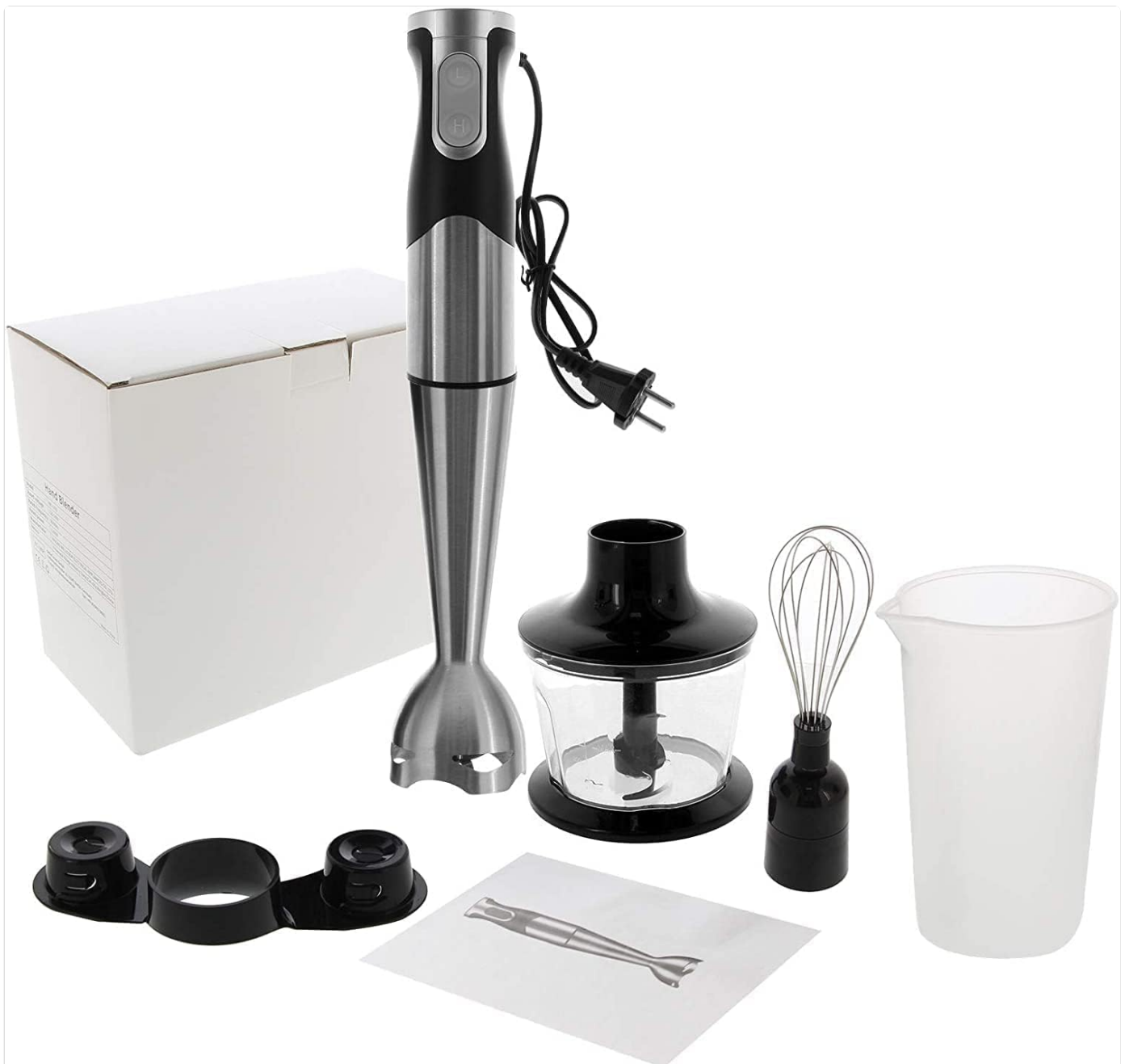
Image: The complete set of the NWOUIIAY blender, including all attachments and the product packaging.