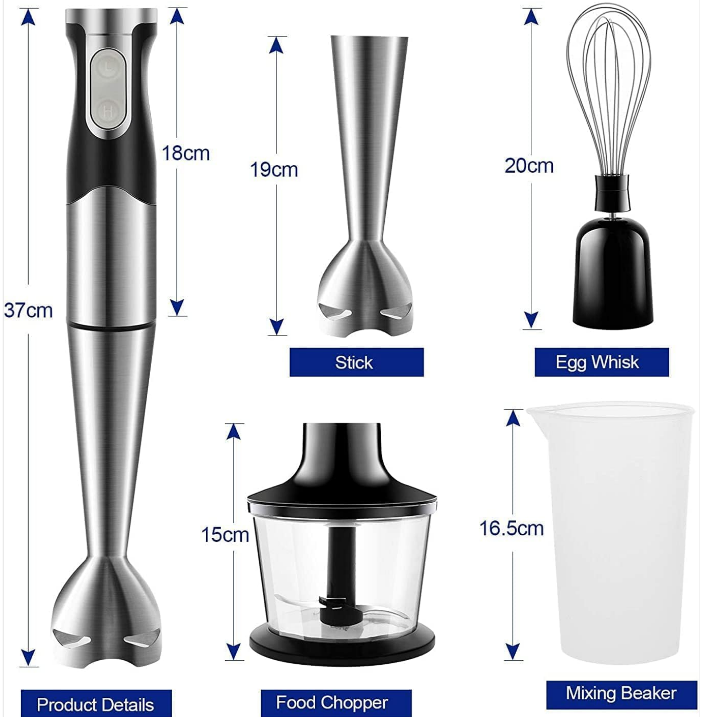
Image: Visual representation of the dimensions for the main product, blending stick, egg whisk, food chopper, and mixing beaker.