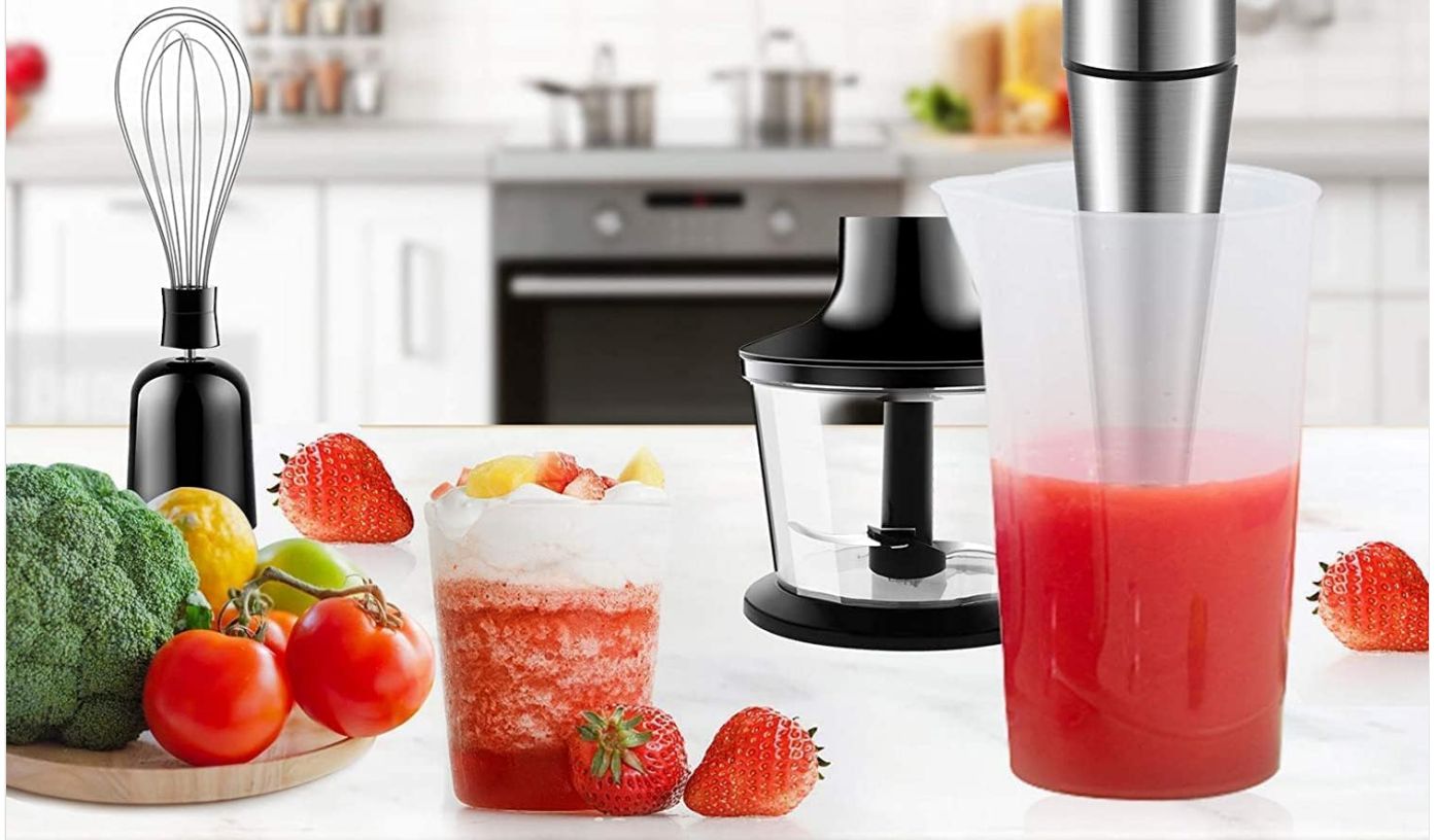
Image: The blender being used with the measuring beaker to prepare a smoothie, demonstrating its versatility for various liquid preparations.