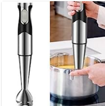
Image: The handheld blender being used to blend ingredients directly in a cooking pot, ideal for soups and sauces.