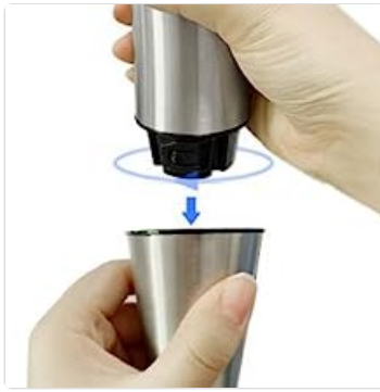
Image: Illustration showing how to detach the blending wand by twisting it counter-clockwise from the motor unit.