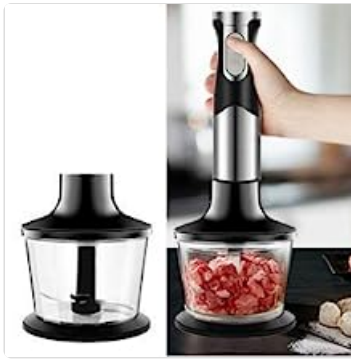
Image: The chopper attachment with meat, illustrating its use for processing solid ingredients.