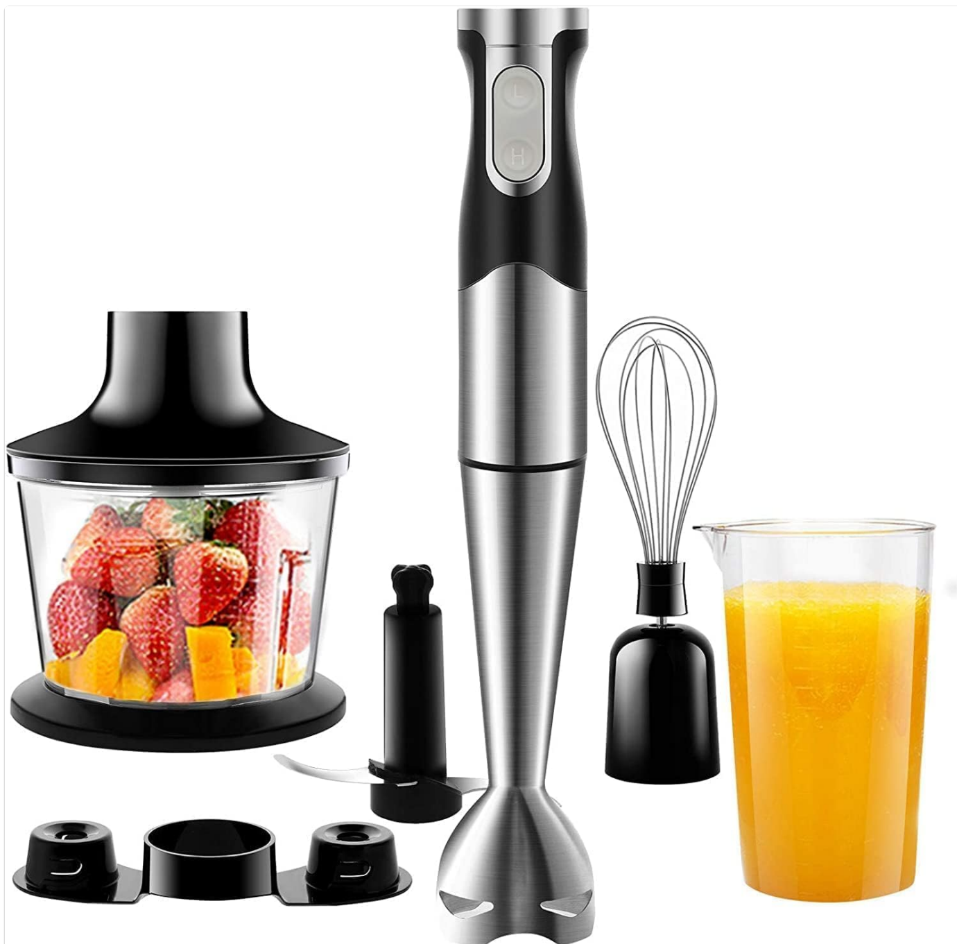
Image: All components included in the package, showing the motor unit, blending wand, chopper, whisk, and measuring cup.