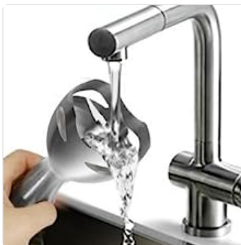
Image: The blending wand being rinsed under running water, demonstrating the ease of cleaning its stainless steel components.