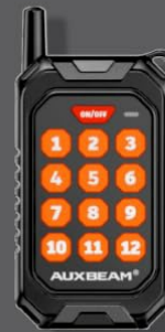
Image: Visual guide demonstrating the two-step pairing process and the unpairing method for the remote control and switch panel.