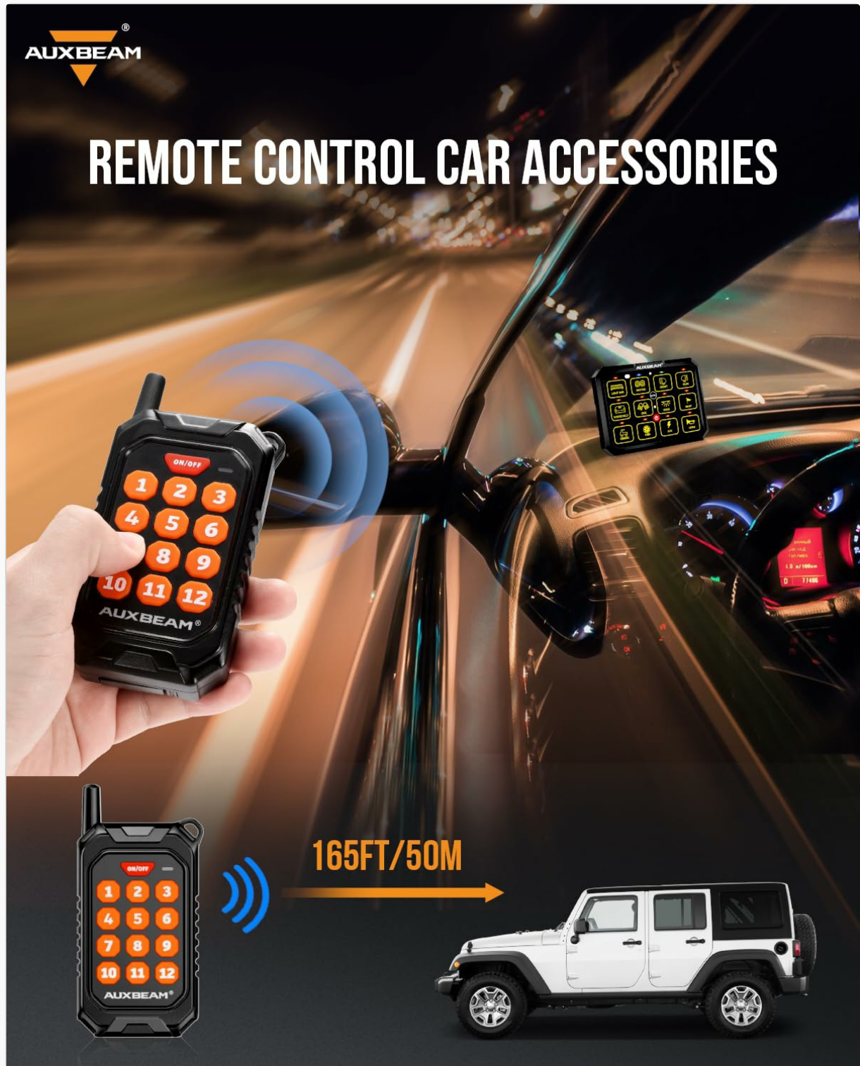
Image: Diagram illustrating the wireless remote control's effective operating range of 165 feet (50 meters) from a vehicle.