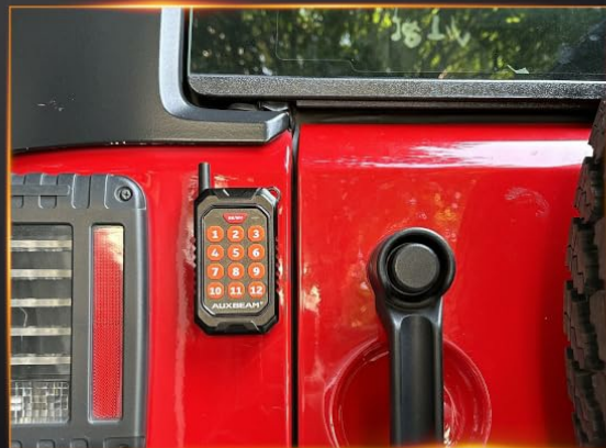
Image: The remote control's compact size (2.3" x 4") and integrated magnet for easy attachment to metal surfaces.