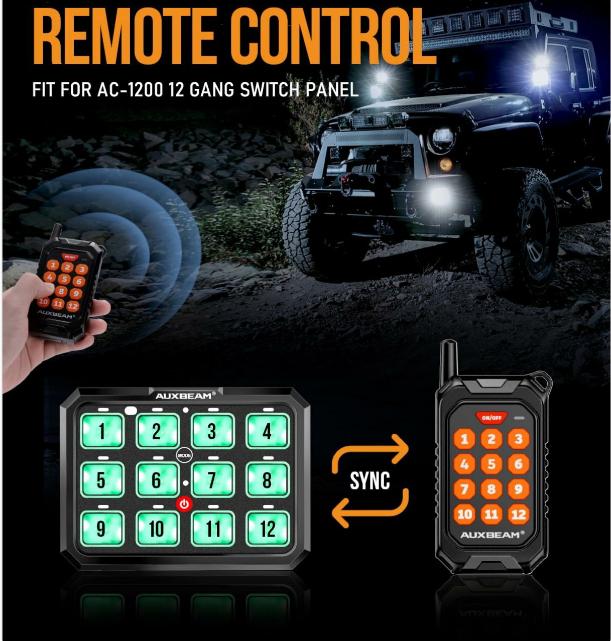
Image: Visual representation of the remote control synchronizing with the AC-1200 switch panel, showing corresponding button states.