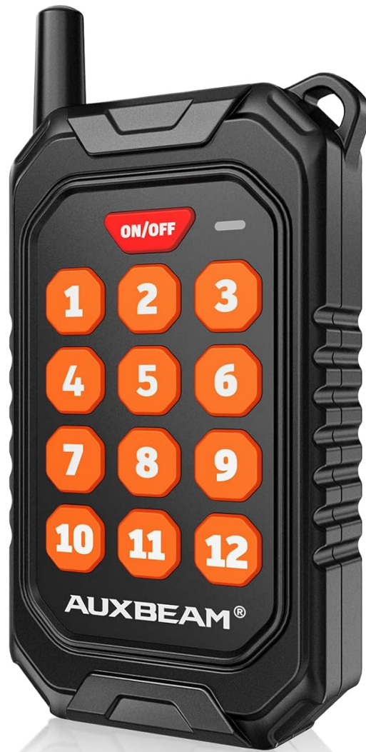
Image: The Auxbeam Wireless Remote Control, featuring 12 numbered buttons and an ON/OFF button.