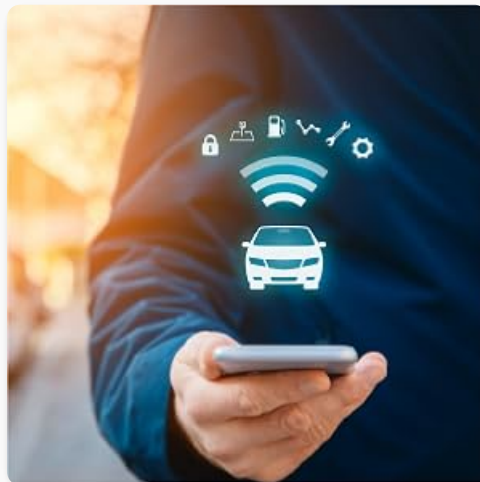
Diagnostic Trouble Codes