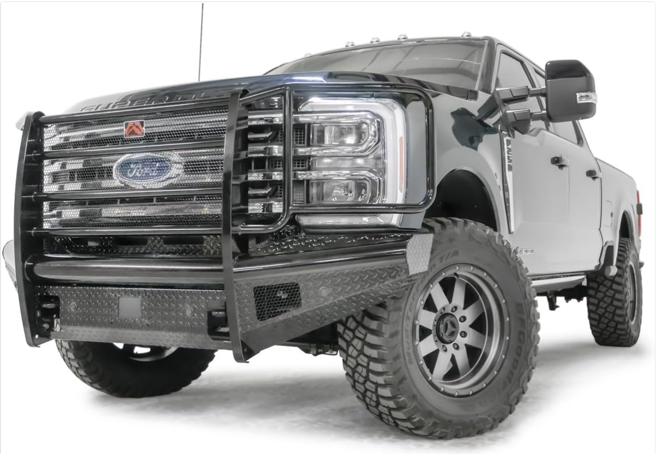
Image 4.1: Front view of the Fab Fours Black Steel Front Bumper with full grill guard installed on a Ford F-350 Super Duty truck. The bumper features a textured black finish and integrated light mounts.