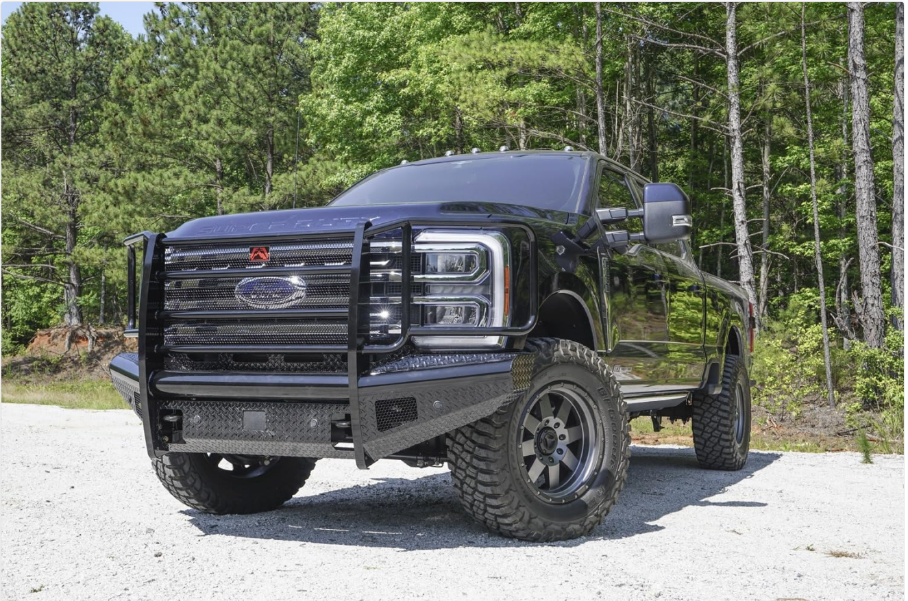
Image 4.2: Angled side view of the Fab Fours Black Steel Front Bumper, showcasing its robust construction and how it integrates with the vehicle's fender lines. The full grill guard is visible.