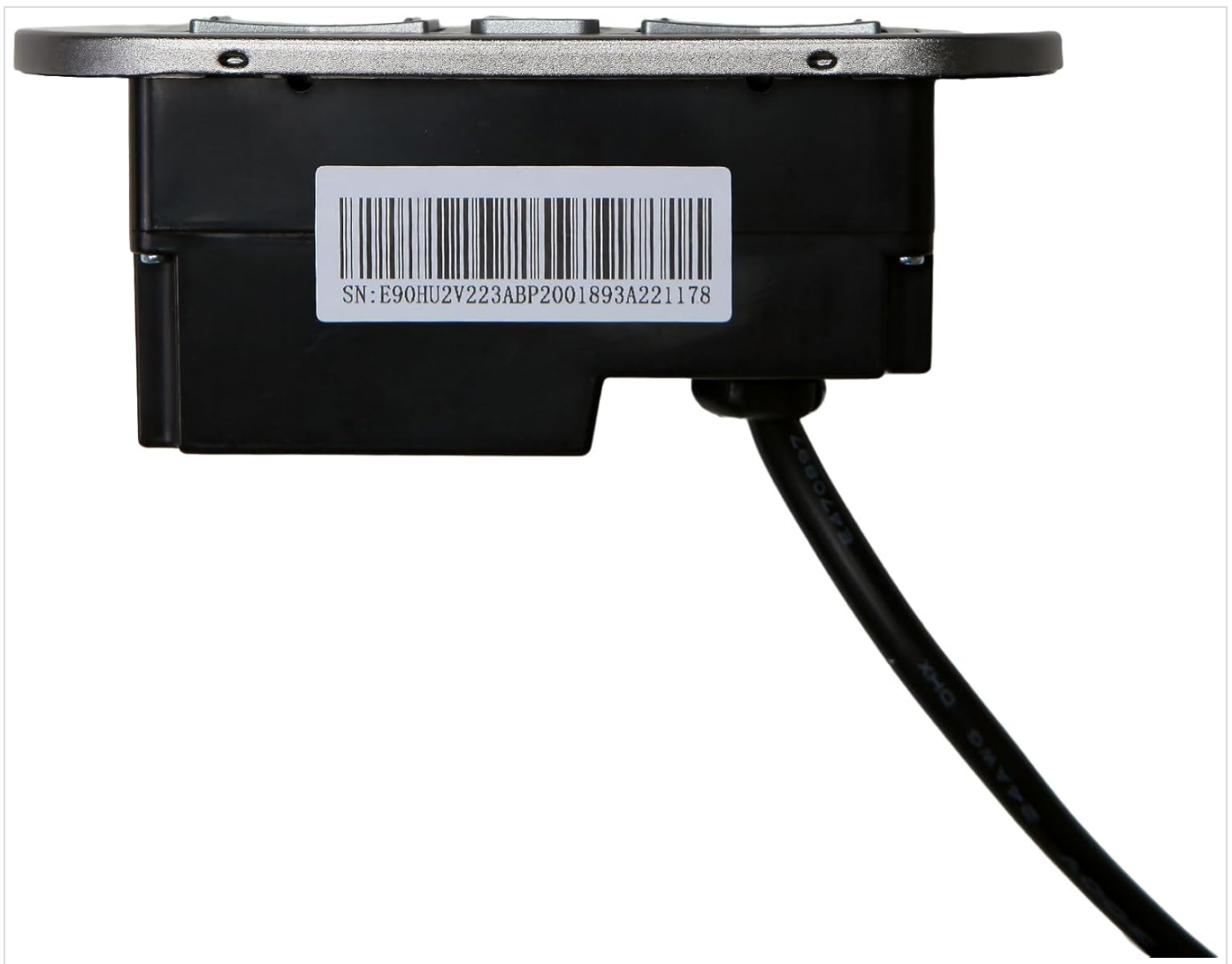
Figure 3: Rear view of the control unit, illustrating the mounting points and serial number label (SN: E90HU2V223ABP2001893A221178).