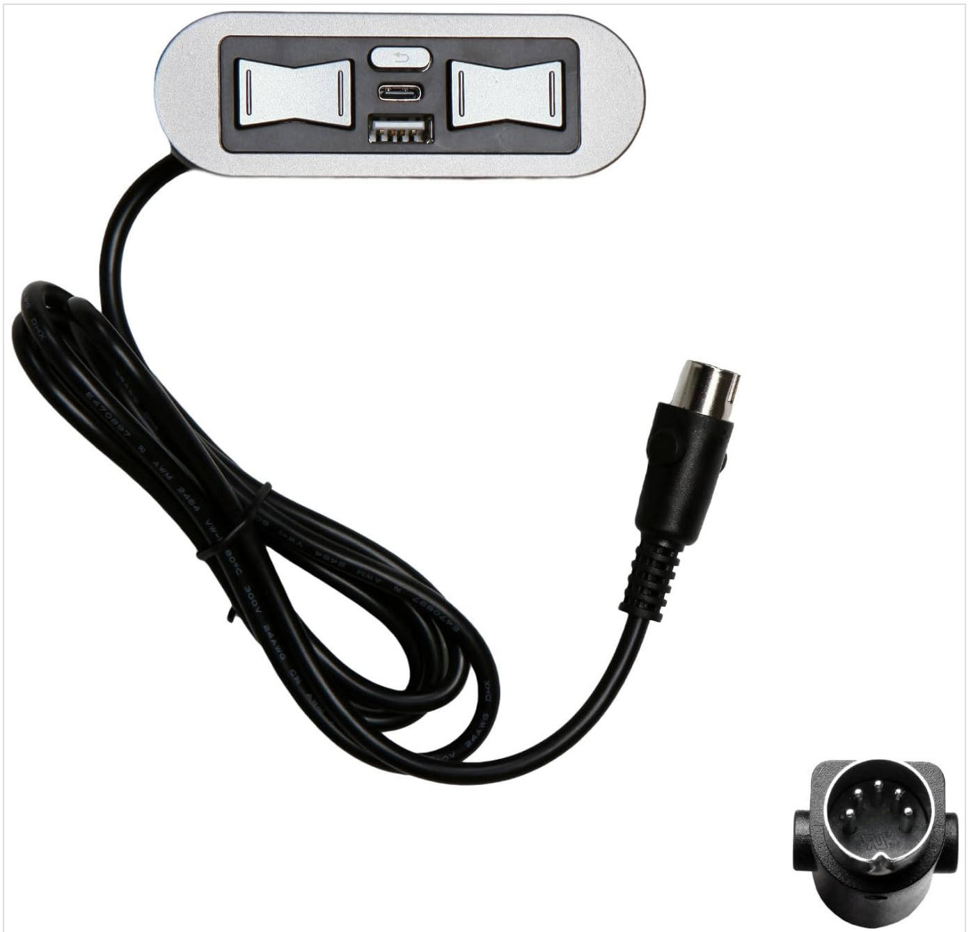
Figure 1: Overview of the Uetmulik HX90HU2 Recliner Hand Control, showing the control unit, cable, and 5-pin connector.