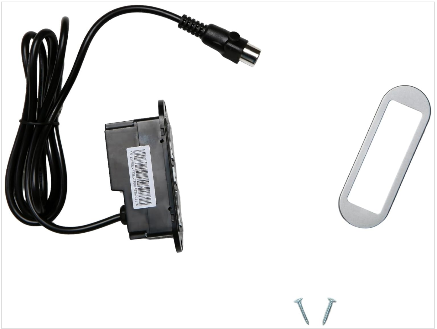
Figure 2: Included components: the hand control unit, connecting cable, decorative front cover, and mounting screws.

Compatibility Note: This control unit is specifically designed for systems using a 5-pin connector. If your existing control has a different pin configuration, this replacement will not be compatible.