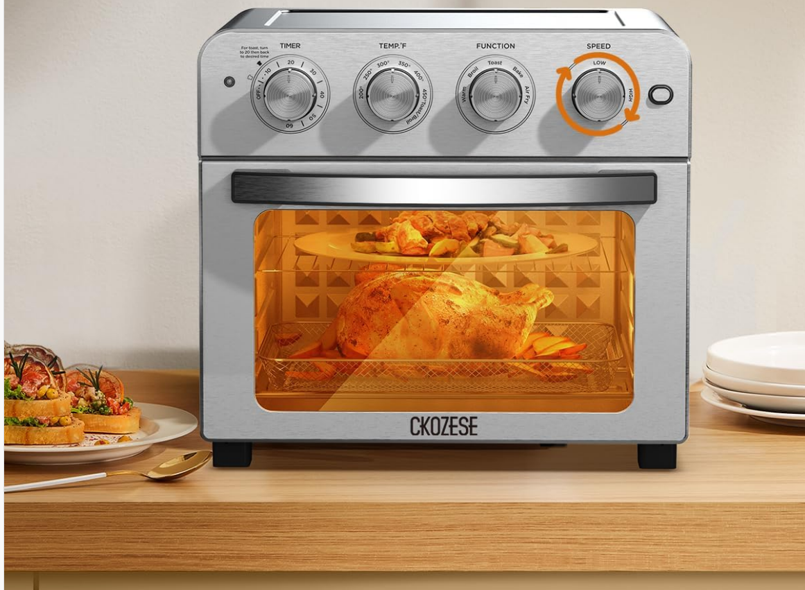
Figure 5: Easy-to-Use Knob Controls