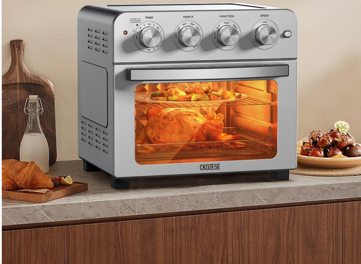
Figure 6: 5-In-1 Air Fryer Oven Combo Functions

Video 1: CKOZESE Air Fryer Toaster Oven (Preview). This short video demonstrates the basic operation and features of the oven.