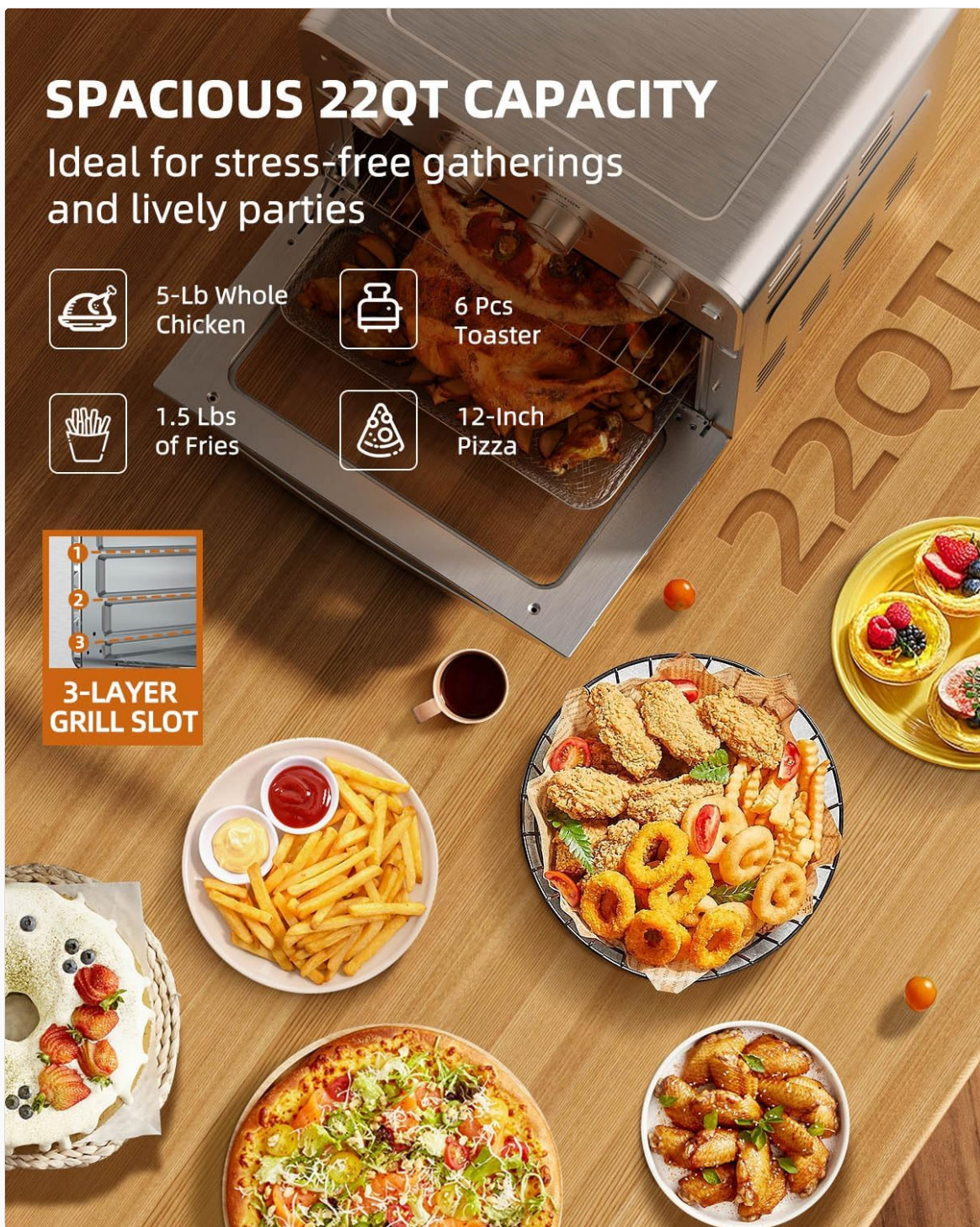
Figure 3: Spacious 22QT Capacity for various foods