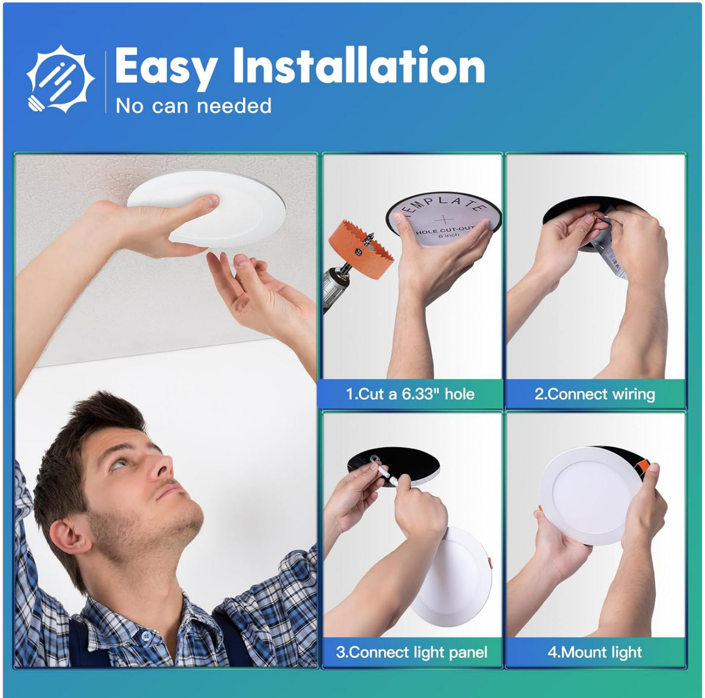
Figure 2: Easy Installation Steps.