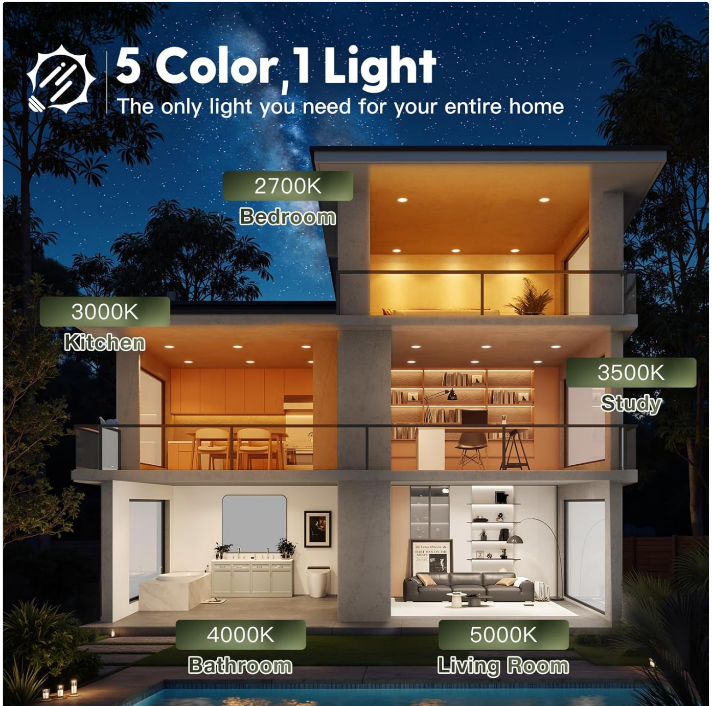
Figure 4: 5 CCT Options for Various Room Settings.

To change the CCT, locate the switch on the side of the junction box and slide it to your desired setting before installing the light or if you need to change it later, access the junction box.