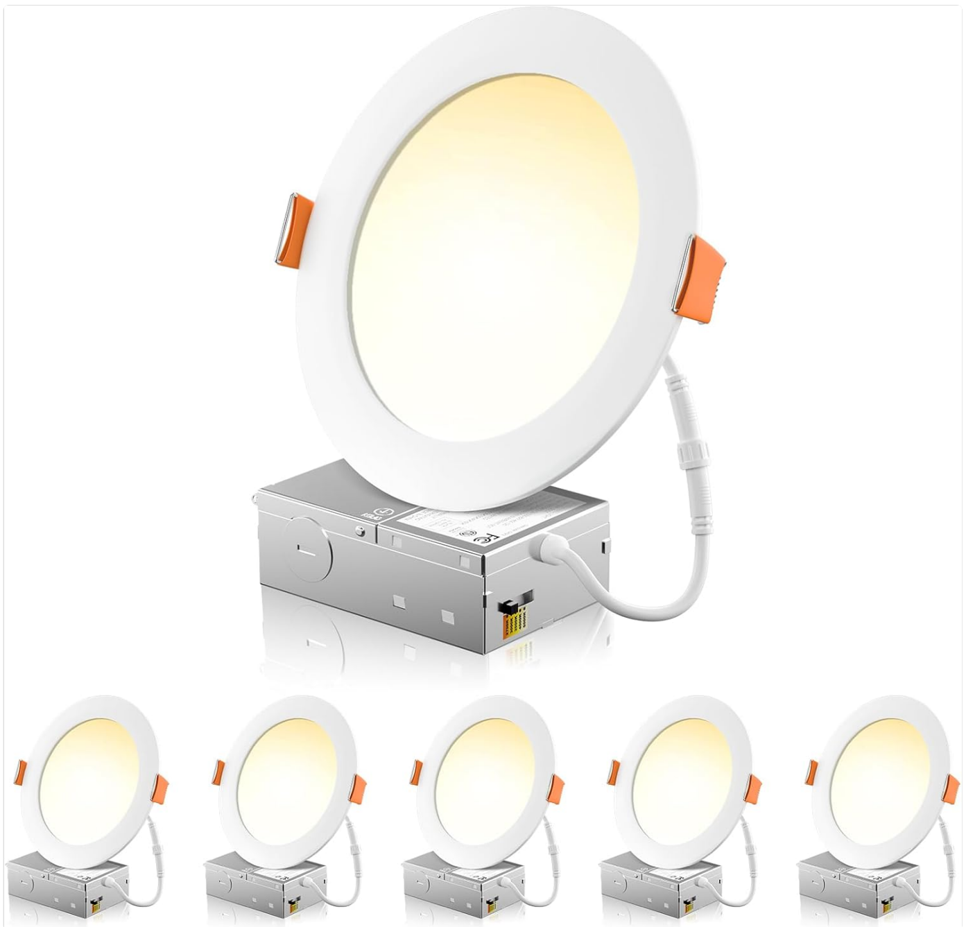
Figure 1: FREELIGHT 6 Inch 5CCT Ultra-Thin LED Recessed Ceiling Light with Junction Box.