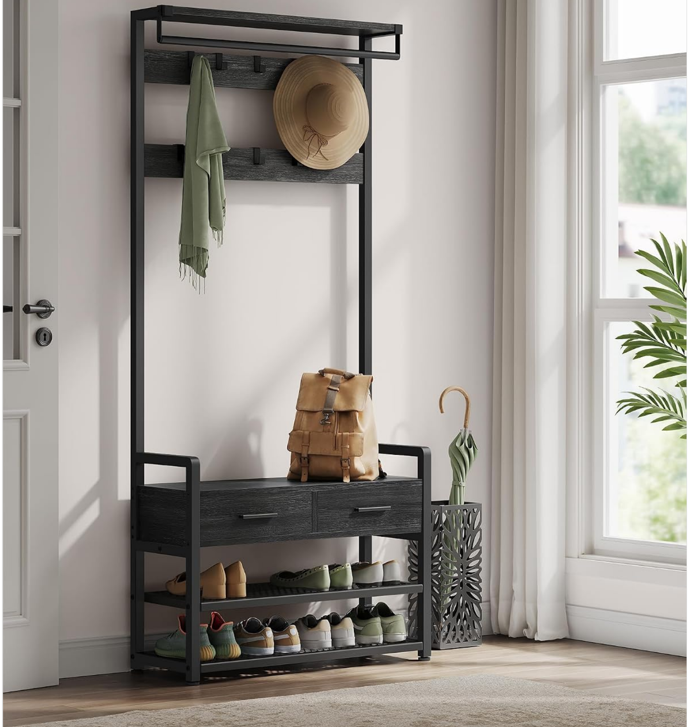
Image: A fully assembled VASAGLE Hall Tree with coats, hats, and shoes, positioned in an entryway.