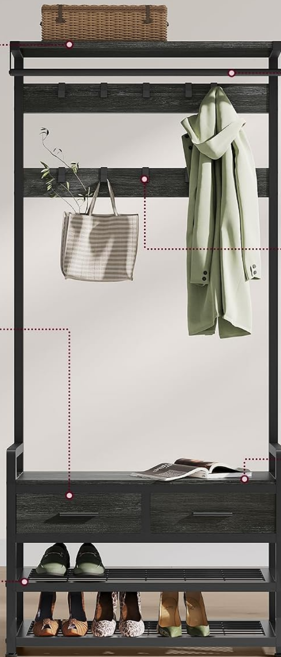
Image: Visual representation of the hall tree's six integrated functions: storage shelf, clothing rail, hooks, drawers, bench, and shoe rack.