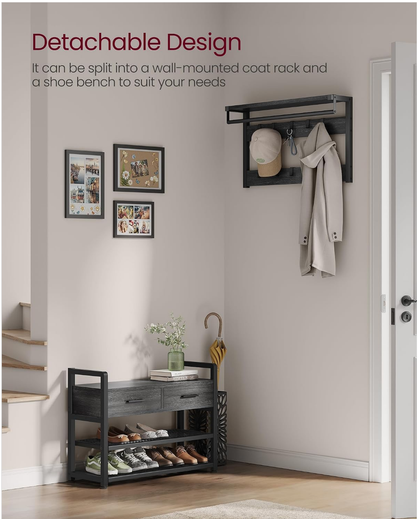
Image: The hall tree configured as two separate units: a wall-mounted coat rack and a standalone shoe bench.

It can be split into a wall-mounted coat rack and a shoe bench to suit your needs