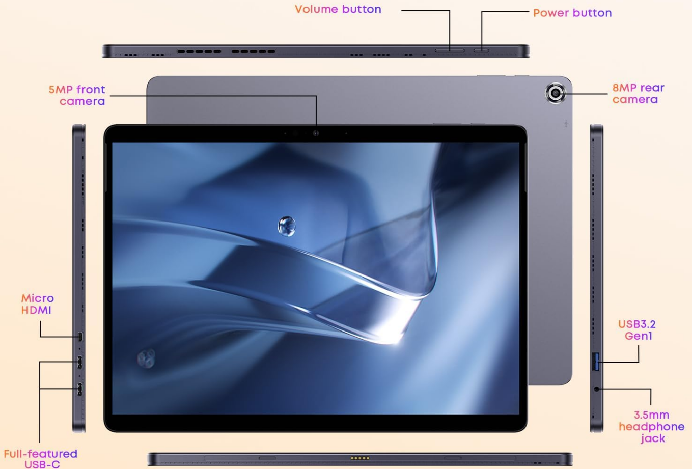
Image: An annotated diagram of the CHUWI Hi10 Max, detailing the location and type of its various ports and features, including USB 3.2 Gen1, full-featured USB-C, Micro HDMI, 3.5mm headphone jack, and camera locations.