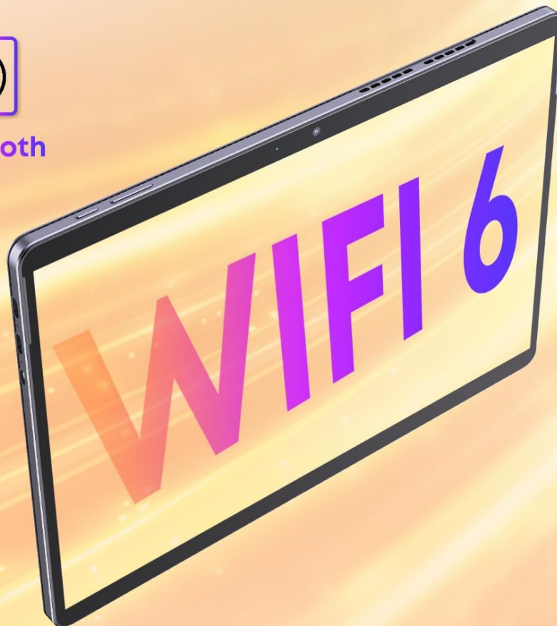
Image: A visual representation of the CHUWI Hi10 Max's high-speed wireless capabilities, specifically highlighting WiFi 6 (802.11ax) and Bluetooth 5.2 for enhanced connectivity.