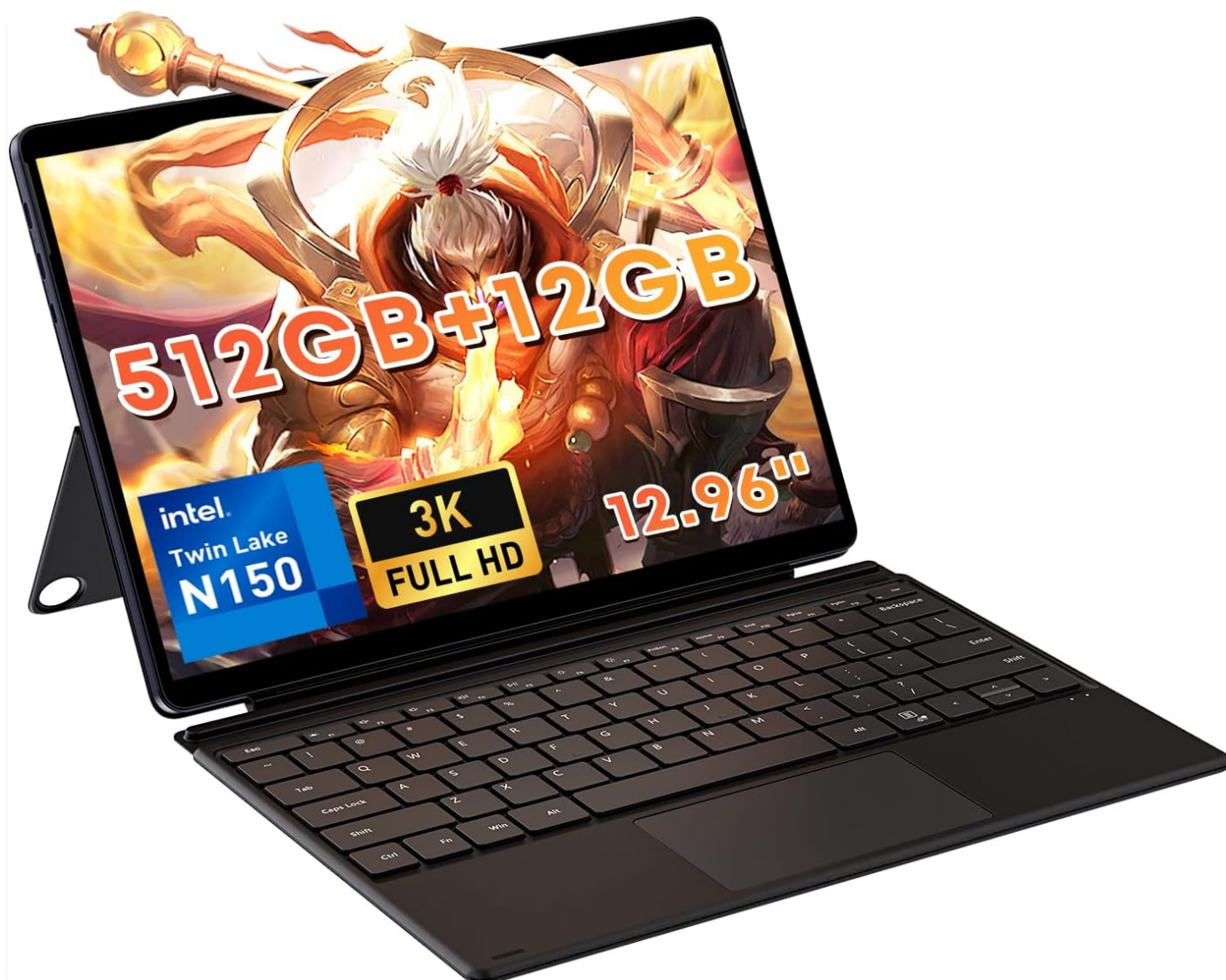
Image: The CHUWI Hi10 Max tablet with its detachable keyboard, showcasing its 2-in-1 functionality. The screen displays a vibrant image, highlighting its high-resolution capabilities.

The CHUWI Hi10 Max is a versatile 2-in-1 tablet designed for productivity and entertainment. It features a powerful Intel N100 processor, a high-resolution 3K display, and comes with a detachable backlit keyboard, transforming it into a laptop for various tasks.