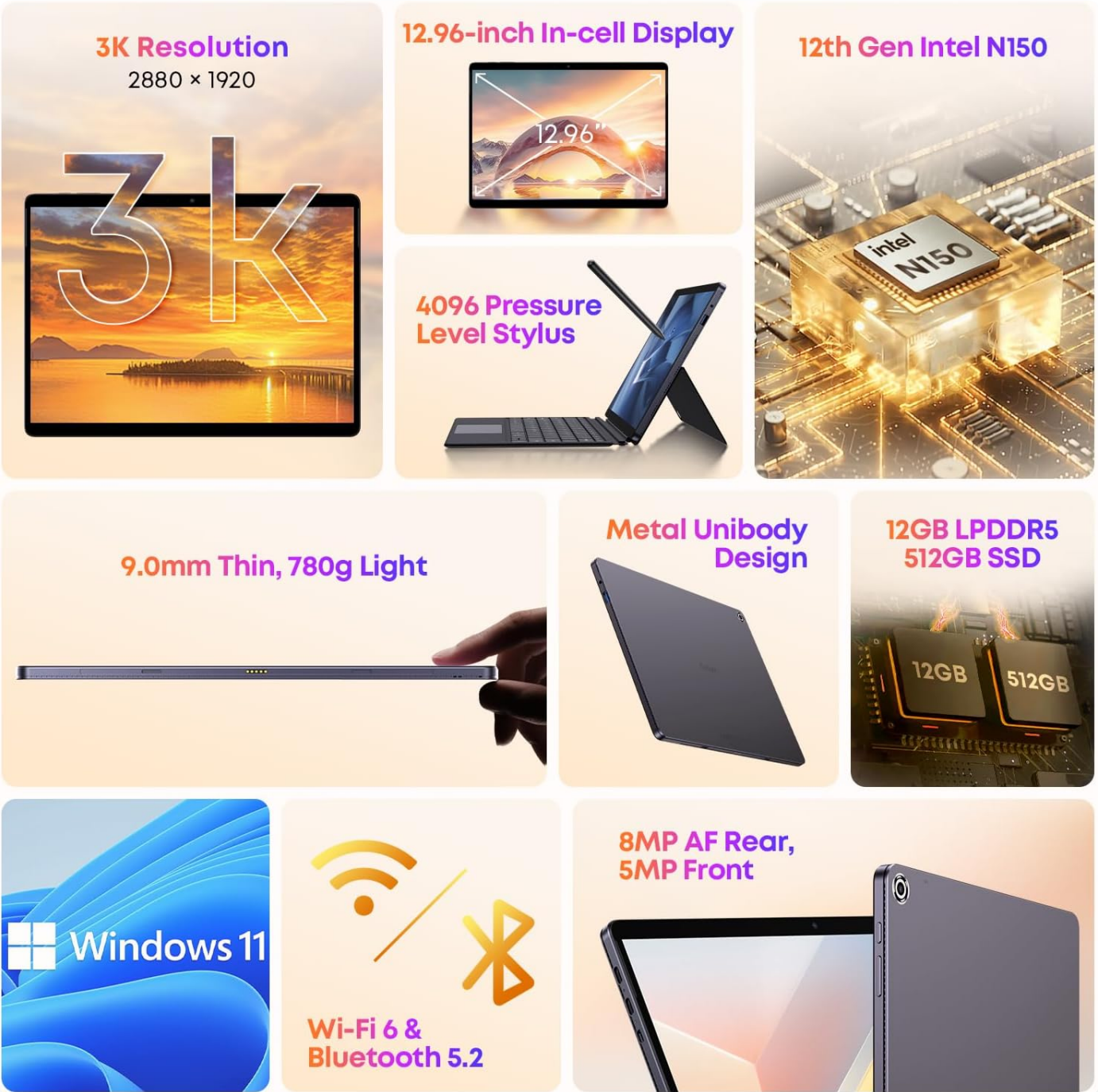
Image: A comprehensive visual summary of the CHUWI Hi10 Max's key specifications, including its 3K resolution, 12.96-inch display, 12th Gen Intel N150 processor, thin design, metal unibody, RAM/SSD, cameras, and connectivity options.