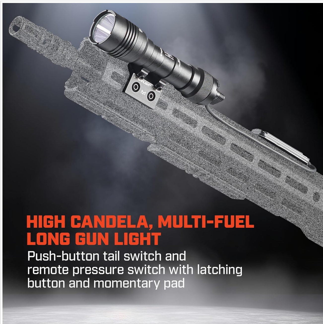
Figure 2: The ProTac Rail Mount HL-X Pro securely mounted on a long gun rail system, demonstrating its low-profile design.