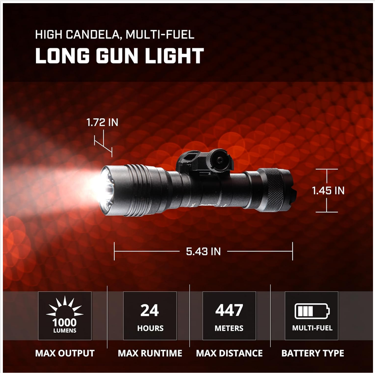
Figure 4: Visual representation of the light's dimensions and key performance metrics.