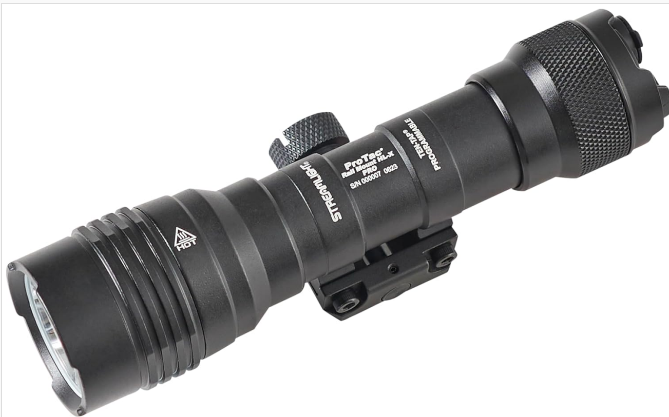
Figure 1: Streamlight ProTac Rail Mount HL-X Pro USB Long Gun Light.

The Streamlight ProTac Rail Mount HL-X Pro is a high-performance, multi-fuel long gun light designed for tactical and outdoor applications. It features a robust construction, versatile power options, and user-friendly controls, making it an essential tool for various lighting needs.