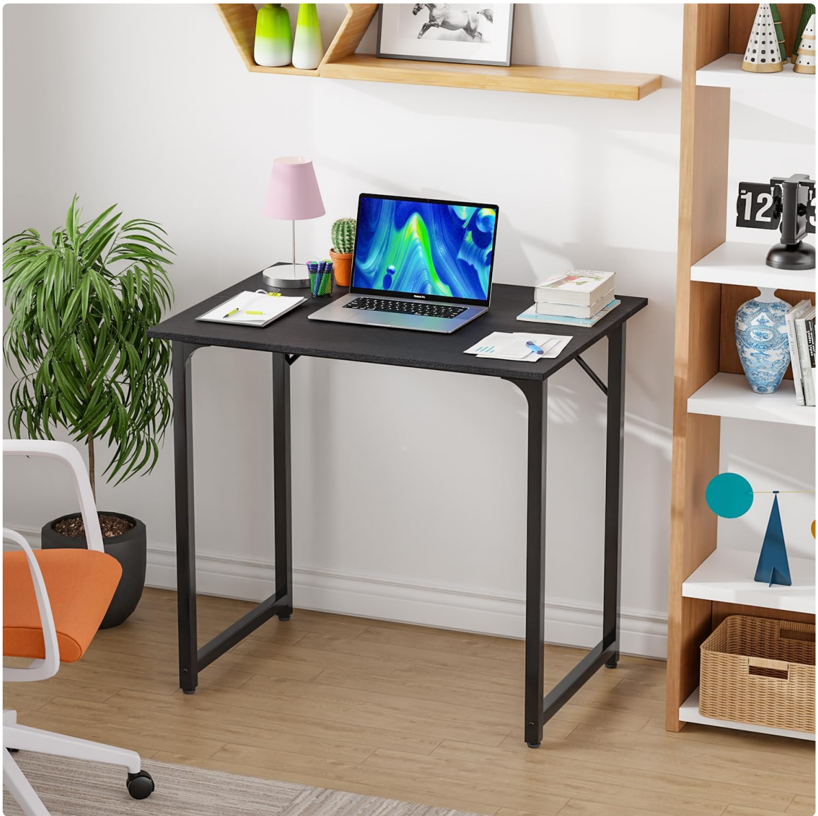
Image showing the 1.5cm thick particle board desktop, highlighting its scratch and water resistance.