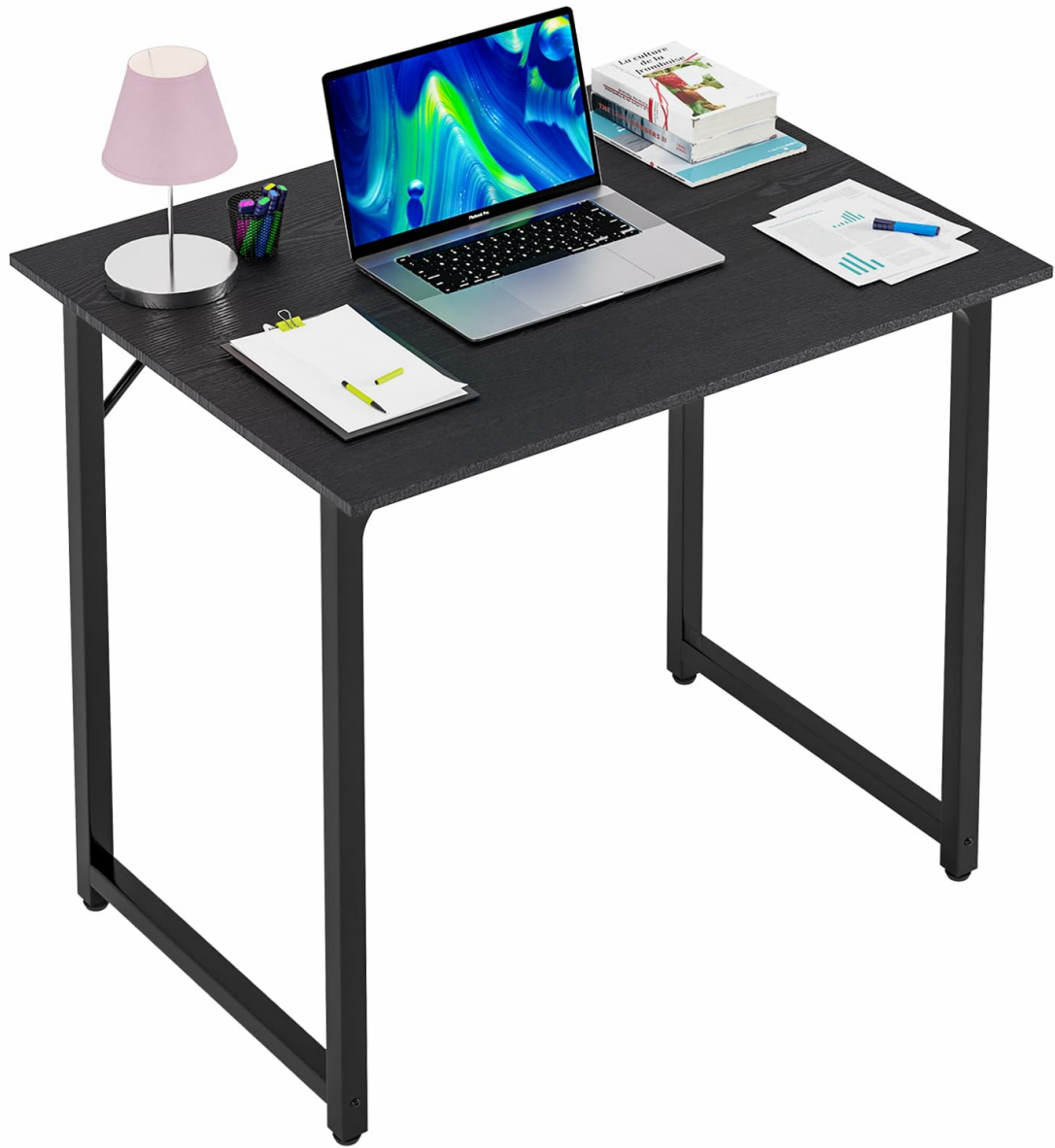
Image of the 32-inch black computer desk in use, showcasing its compact design and suitability for a home office or study area.