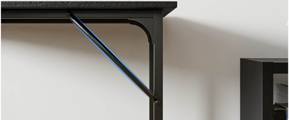
Image illustrating the sturdy metal frame with extra fixed steel brackets for reliable support and stability.

Extra fixed steel brackets provide greater stabilit