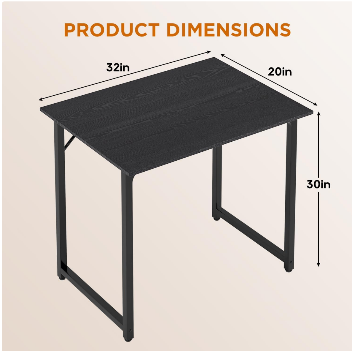
Image showing the overall product dimensions: 32 inches (width) x 20 inches (depth) x 30 inches (height).

Official assembly video for the PayLessHere 32-inch computer desk, demonstrating step-by-step installation of components.