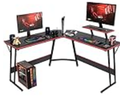
Image illustrating the waterproof and easy-to-clean properties of the desktop, along with its anti-scratch and eco-friendly material.