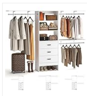
Figure 3: Examples of various installation configurations to fit different closet layouts.