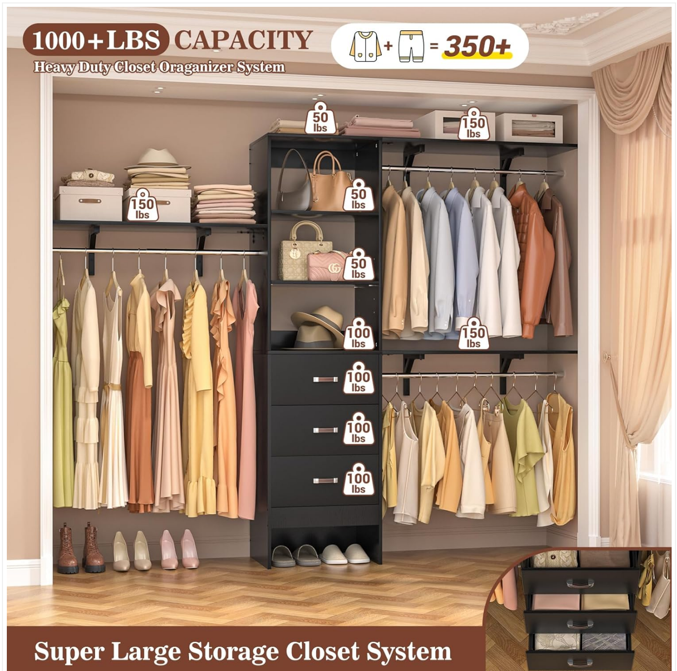
Figure 4: Example of the closet system's storage capacity and organization.