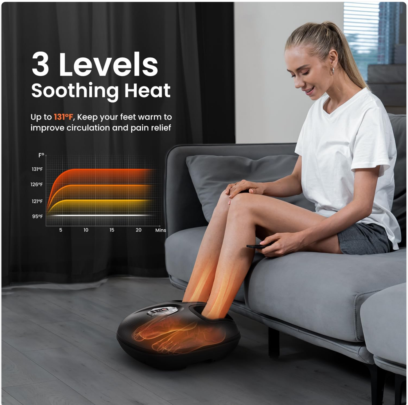
Image: A person relaxing on a couch with their feet in the RENPHO foot massager, illustrating the soothing heat function with a