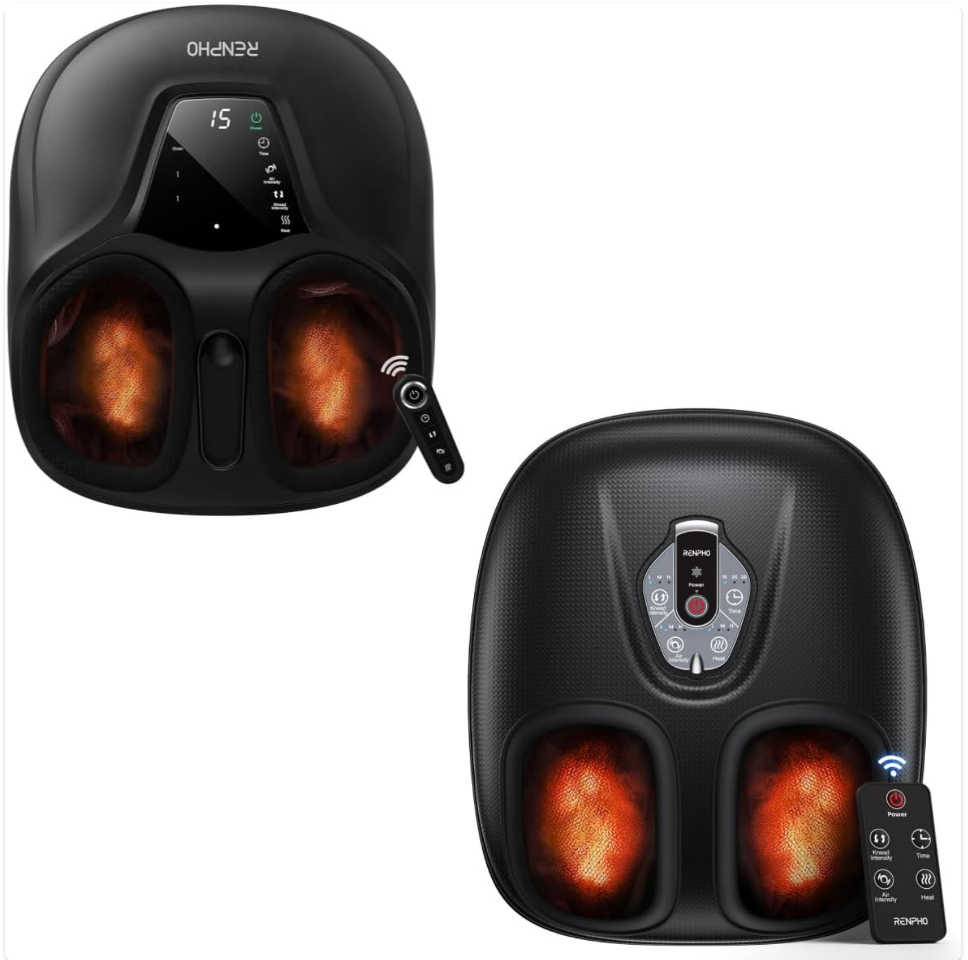
Image: The RENPHO Shiatsu Foot Massager D003R, showing its sleek black design and foot inserts. A remote control is visible next to the unit.

The RENPHO Shiatsu Foot Massager D003R is designed to provide a professional foot massage experience with deep kneading, air compression, and heat functions. It features a user-friendly control panel and a wireless remote for convenient operation.