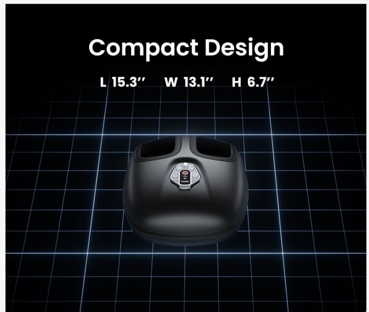
Image: A collage showing various features of the RENPHO foot massager, including its durable PU leather, anti-slip rubber pads, compact design with dimensions (L 15.3", W 13.1", H 6.7"), portability (5.3 LB), and a close-up of the washable foot covers being cleaned in water.