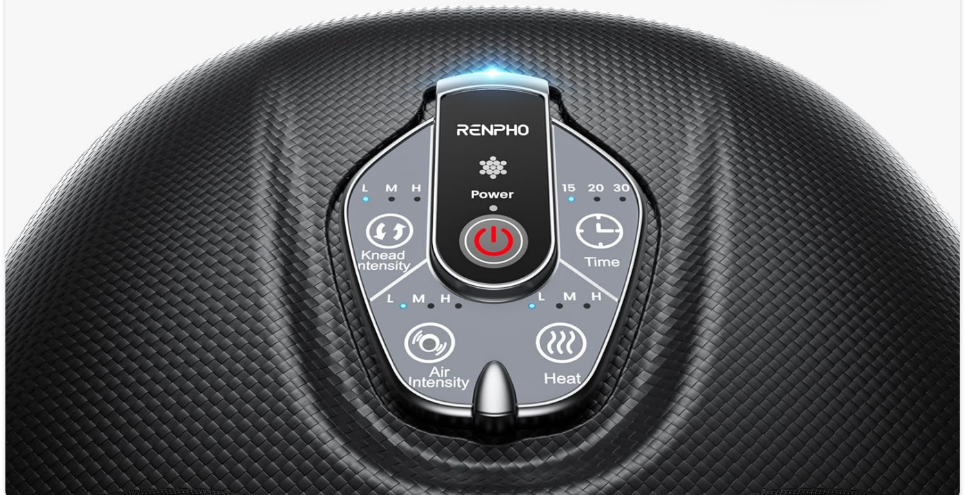
Image: Close-up view of the foot massager's control panel and the wireless remote control, showing buttons for Power, Knead Intensity, Timer, Air Intensity, and Heat.