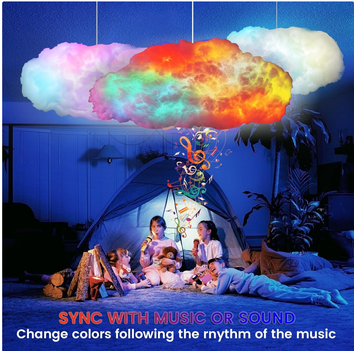
Children singing under colorful cloud lights, illustrating music synchronization.

The cloud lights feature a built-in microphone that allows them to react to sounds. Additionally, through the mobile app, you can play music, and the lights will synchronize with the melody, creating an immersive atmosphere.