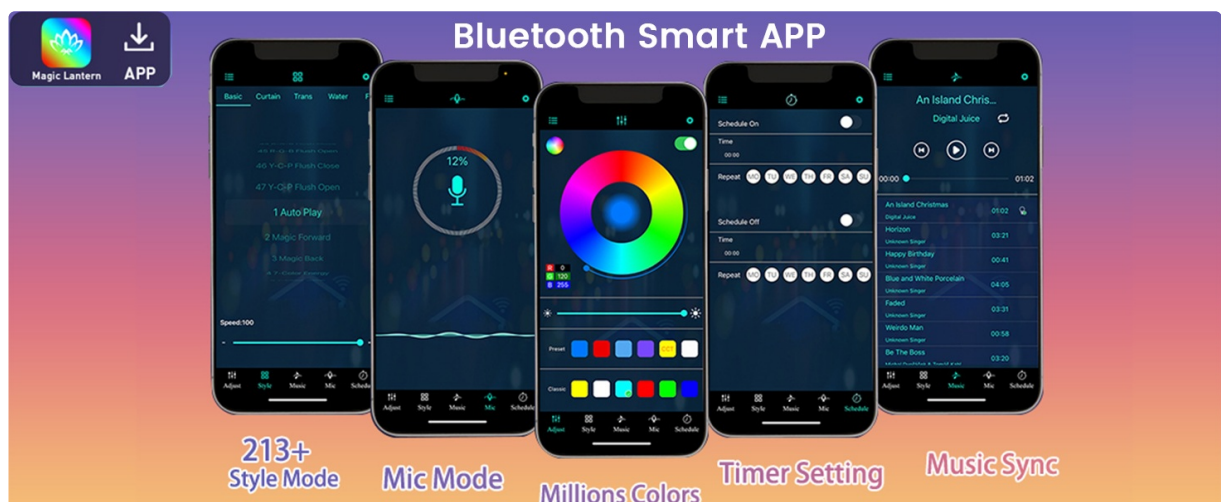
Screenshots of the 'Magic Lantern' mobile application interface, showing style modes, mic mode, color selection, timer settings, and music sync.