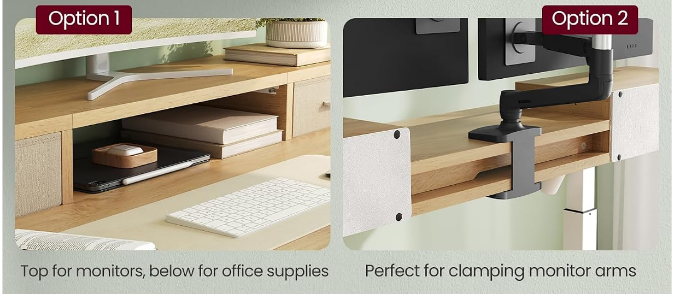
Image: Options for configuring the adjustable middle shelf, either for monitor placement or to support monitor clamping arms.