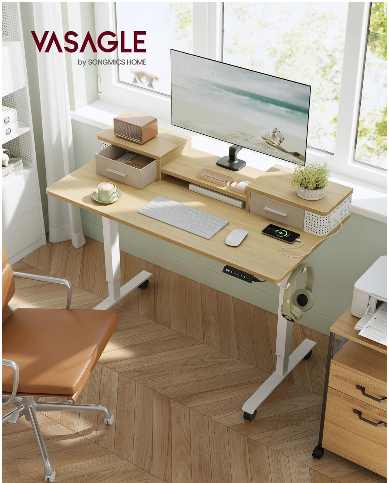
Image: The VASAGLE Electric Standing Desk fully assembled and set up for use.