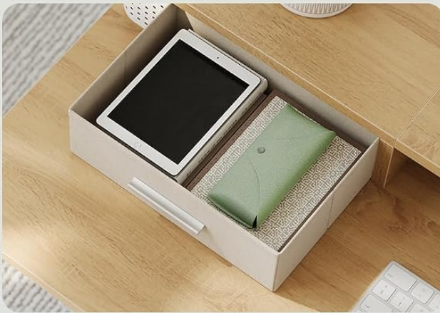
Robust Oxford Fabric

Keep your office essentials neatly sorted