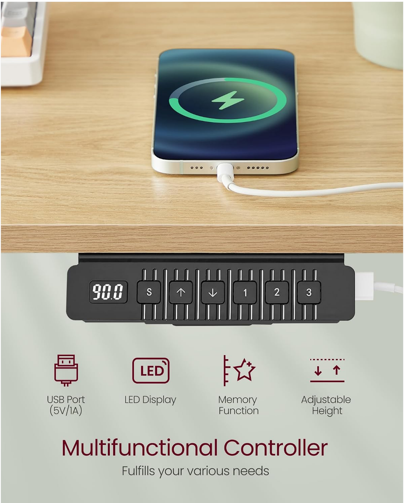
Image: The desk's multifunctional controller, highlighting its USB port, LED display, memory function, and height adjustment buttons.