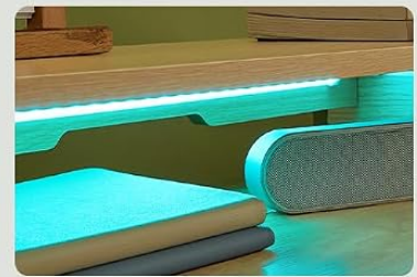
Image: The integrated LED lights providing customizable illumination under the middle shelf.