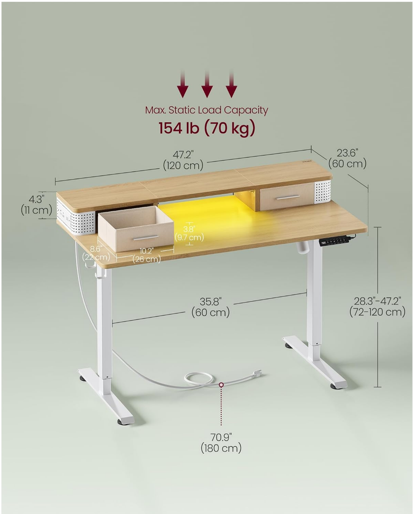
Image: Detailed dimensions of the desk, including height range, desktop size, and drawer measurements.