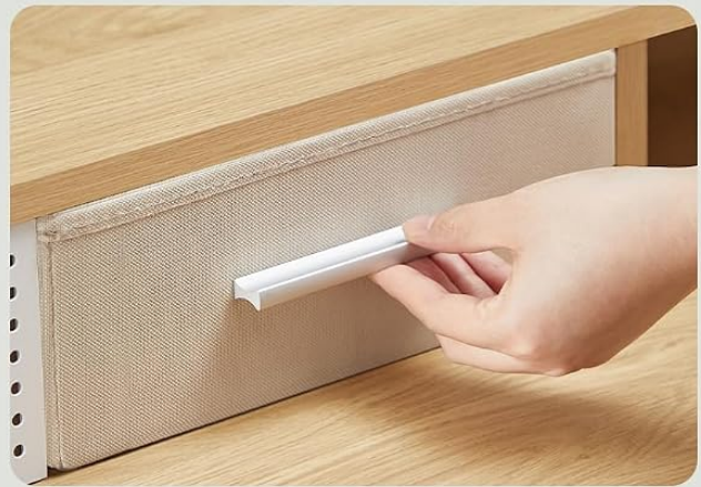
Practical Metal Handles

Image: The two practical fabric drawers designed to keep your workspace organized.