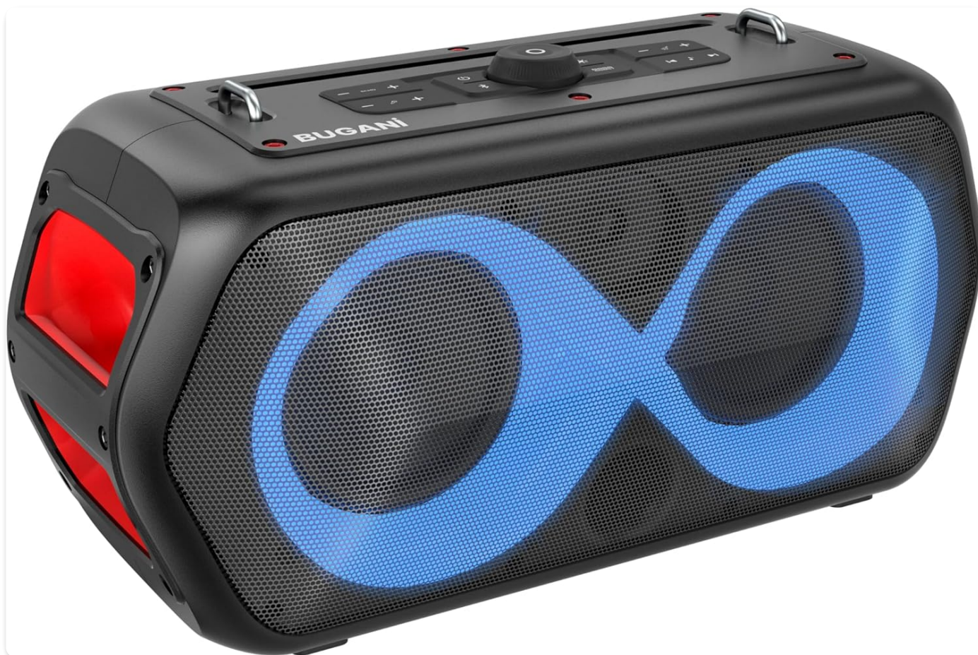
Image: Front view of the BUGANI Party Go speaker, showcasing its robust design and illuminated infinity-shaped LED lights.

The BUGANI Party Go is a high-power portable Bluetooth speaker designed for outdoor and party environments. It features 120W peak power, dual subwoofers, a tweeter, 7 lighting effects, and IPX6 waterproofing. It supports stereo pairing for enhanced sound and offers multiple connectivity options.