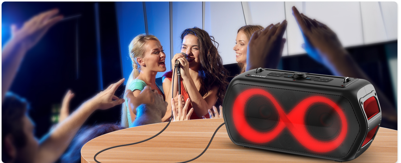
Image: People enjoying karaoke with the BUGANI Party Go speaker, demonstrating its microphone input capability.

The speaker is equipped with a 6.35mm microphone jack and a 6.35mm guitar jack, allowing for karaoke or live instrument playback. Use the dedicated volume and echo controls on the panel to adjust the audio levels for these inputs.