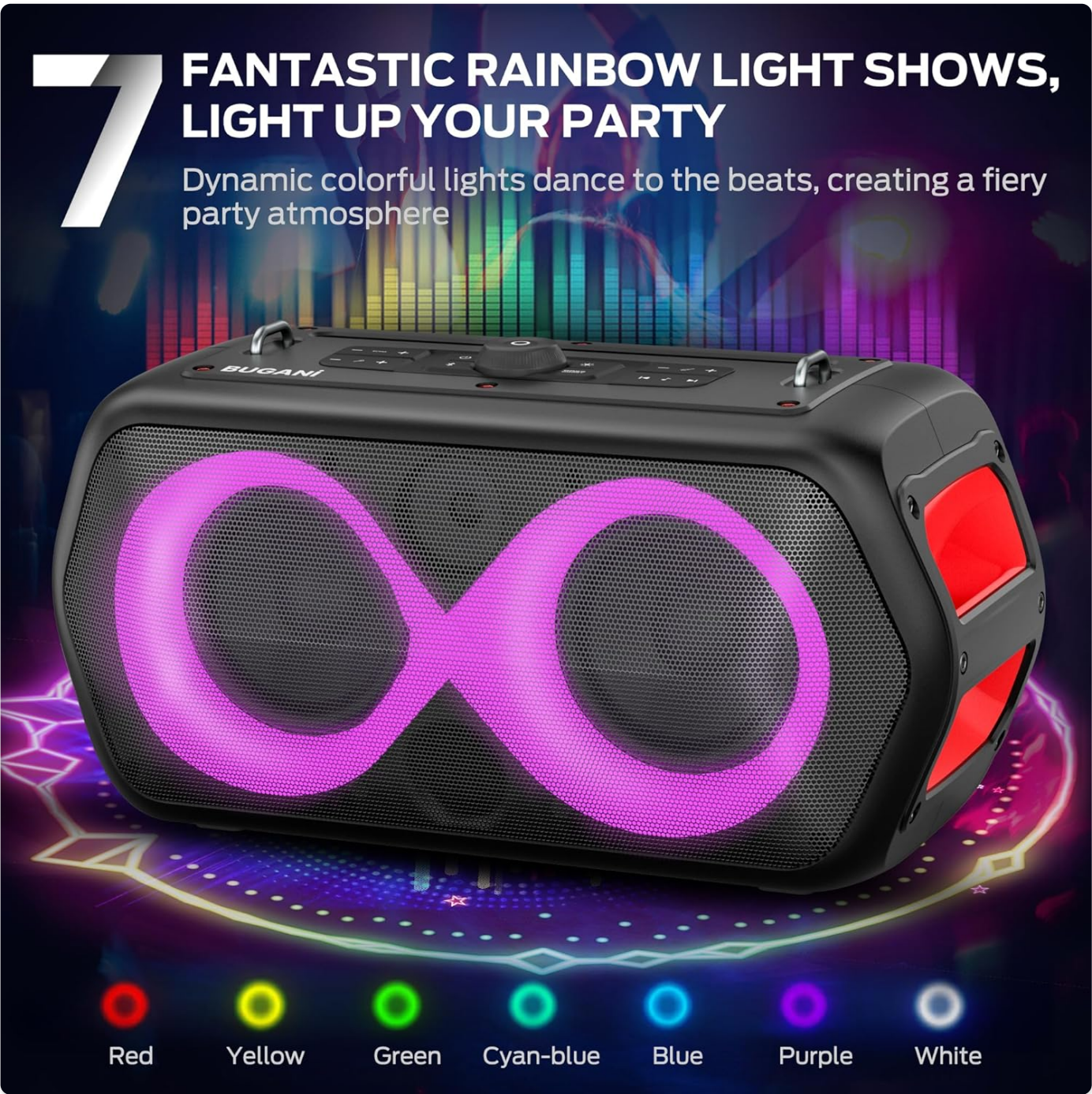
Image: The speaker displaying a vibrant purple light effect, illustrating one of the seven available lighting modes.

The speaker features 7 dynamic RGB lighting effects that synchronize with the music. Press the Lighting Effects On/Off button to cycle through the available modes or turn the lights off.