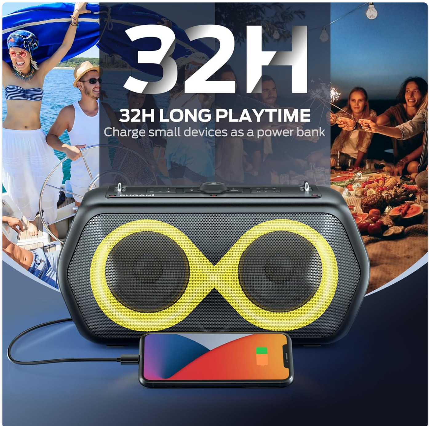
Image: The speaker demonstrating its power bank capability by charging a smartphone, highlighting its long playback time.

The speaker can also function as a power bank to charge other smart devices via its USB port.