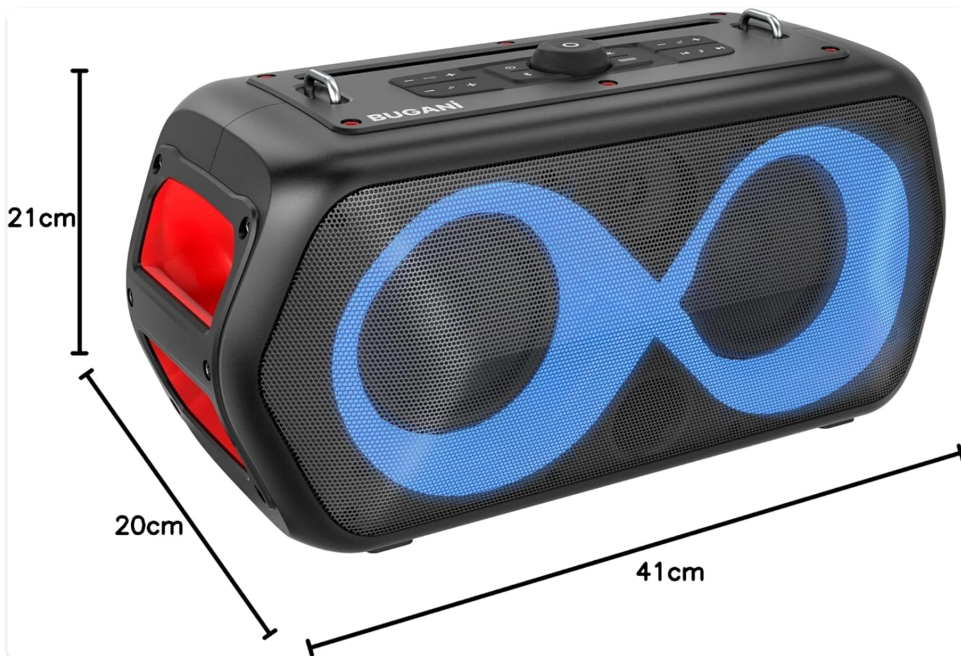
Image: Diagram showing the physical dimensions (length, width, height) of the BUGANI Party Go speaker.