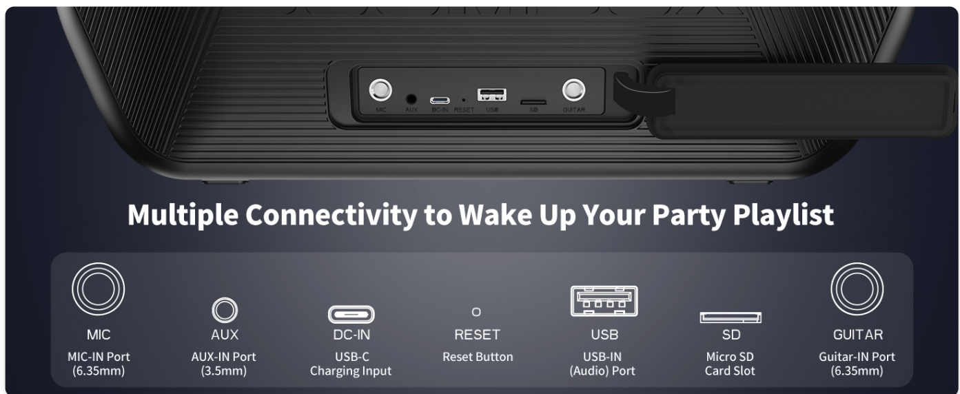
Image: Close-up view of the speaker's rear panel, highlighting the various input ports including MIC, AUX, USB-C, USB, and Micro SD.