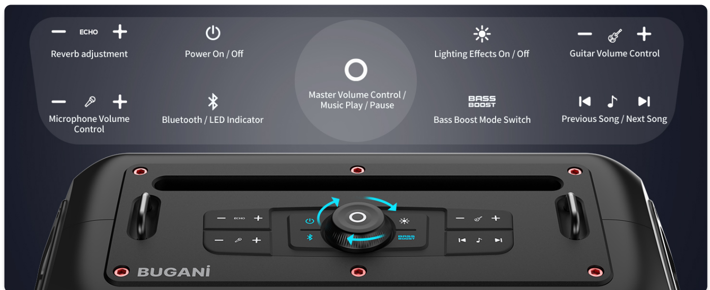
Image: Detailed view of the speaker's control panel, showing buttons for power, volume, lighting, and input selection.

Press and hold the Power button on the control panel for approximately 3 seconds to turn the speaker on or off.