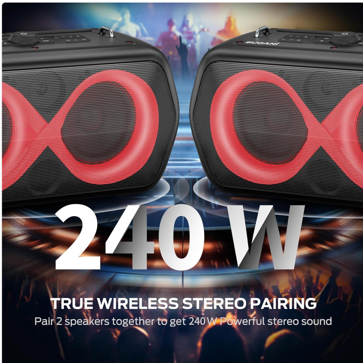
Image: Two BUGANI Party Go speakers positioned to demonstrate True Wireless Stereo pairing, creating a wider soundstage.