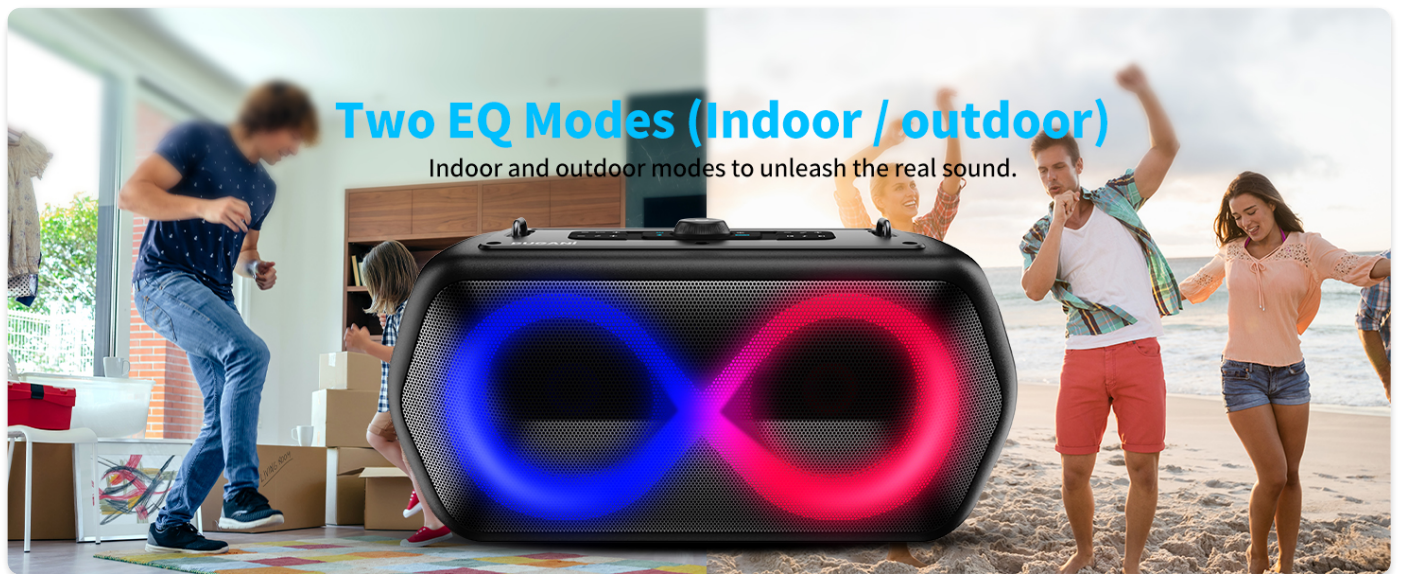
Image: Visual representation of the speaker adapting its sound profile for different environments, illustrating the Indoor and Outdoor EQ modes.