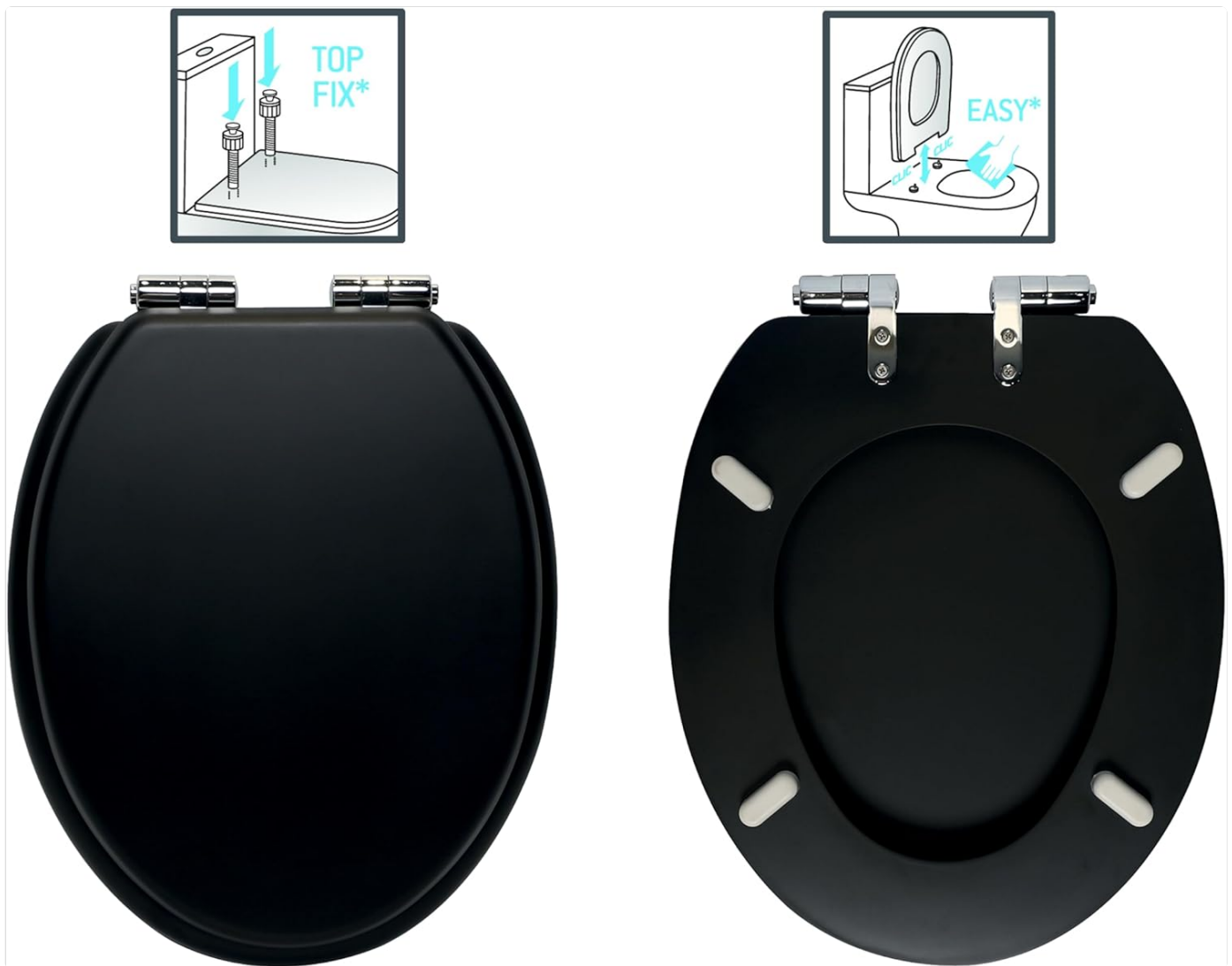
Image: Diagram illustrating the "Top Fix" installation method, where screws are inserted from above the toilet bowl to secure the seat hinges.