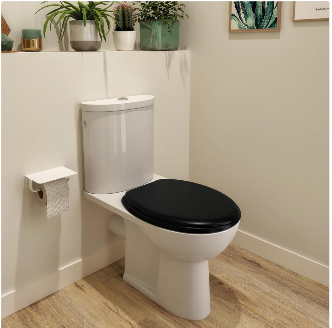
Image: SENSEA PURITY Oval Toilet Seat installed in a modern bathroom setting, showcasing its sleek black design.