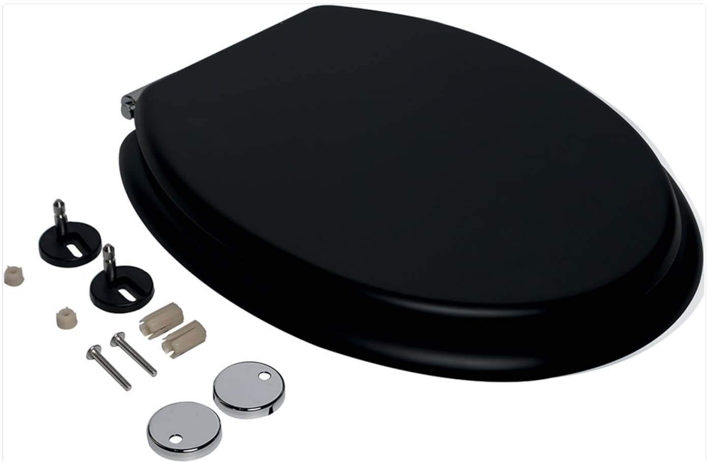
Image: All components of the SENSEA PURITY toilet seat laid out, including the black seat and lid, chrome hinges, screws, and plastic expansion plugs for installation.