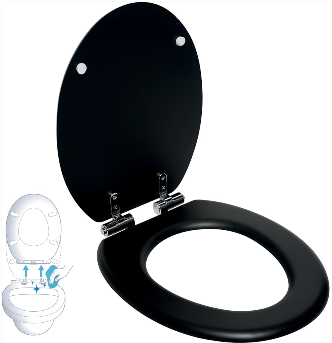
Image: Diagram illustrating the quick-release mechanism, showing how to press a button to easily detach the toilet seat for cleaning.