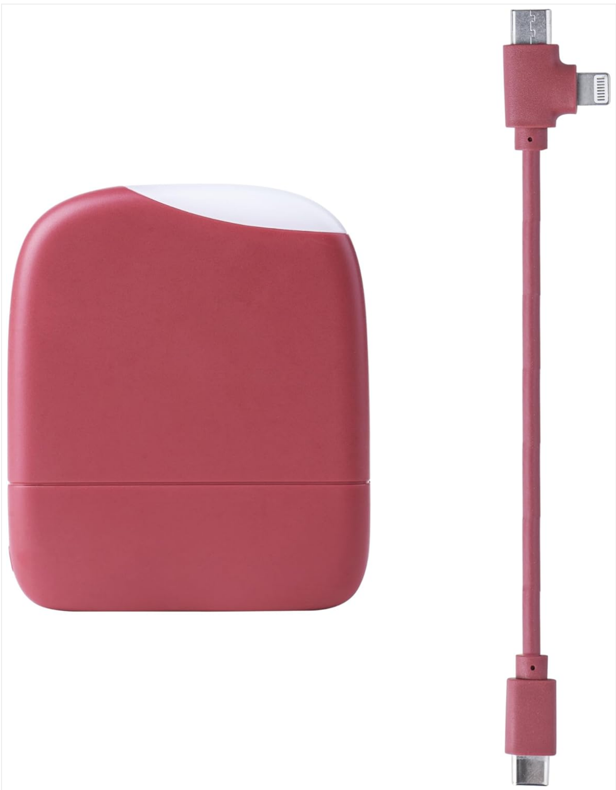
Figure 2.1: The Xopar Ice-Powerbank, shown in red.