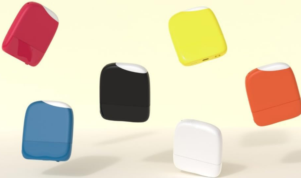
Figure 3.1: Diagram illustrating the USB-C input port and the dual output cable (USB-C and Lightning).