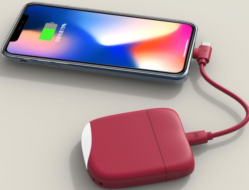
Figure 4.1: The power bank actively charging a smartphone.