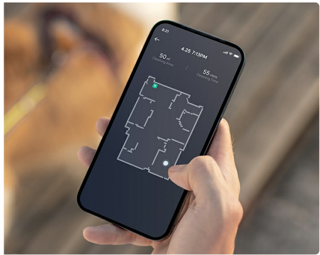
Figure 2: RoboVac G30 Hybrid SES in 2-in-1 Vacuum and Mop Mode

*The map only shows the Cleaning Area and Cleaning Time for your reference. After the cleaning is finished, the map can not be used for the next cleaning.