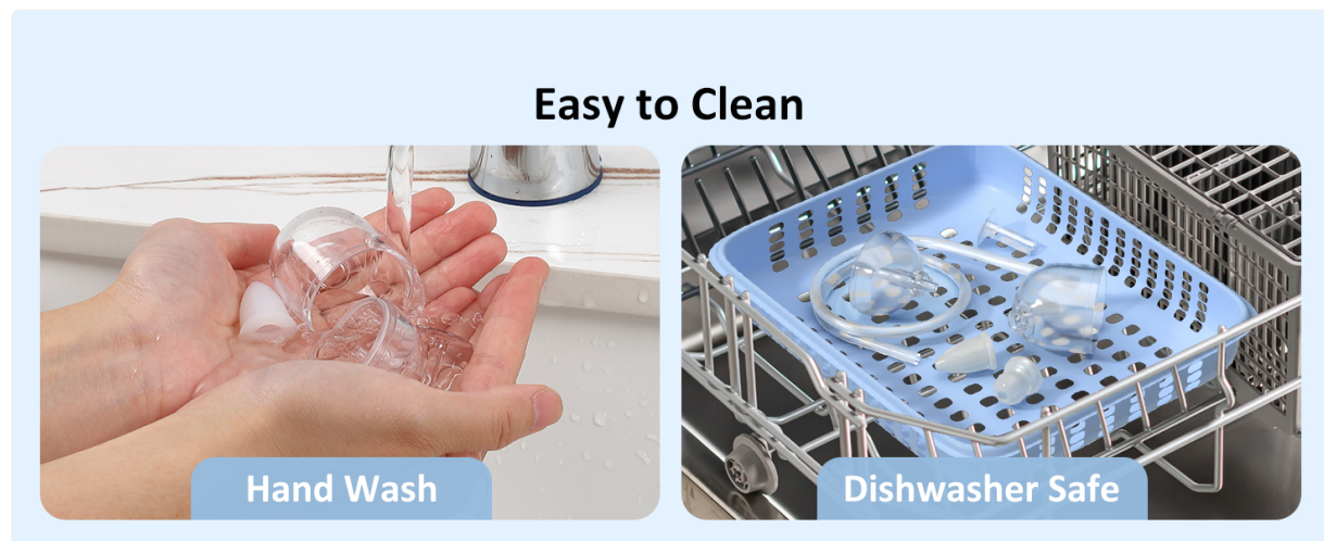
Image 2.1: The aspirator features ultra-soft, food-grade silicone tips designed to be gentle on a baby's delicate skin.