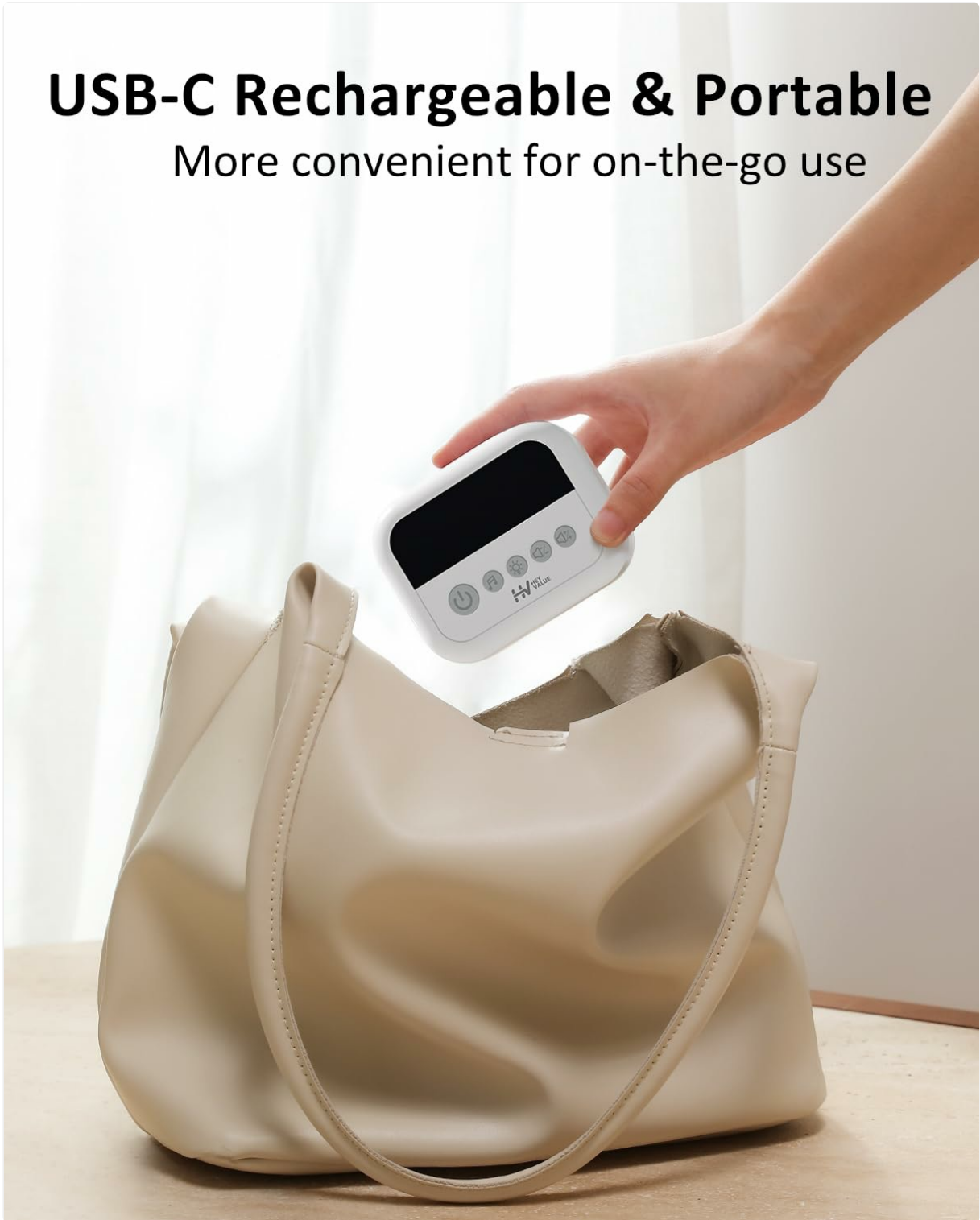
Image 4.1: The compact and USB-C rechargeable design makes the aspirator portable for on-the-go use.