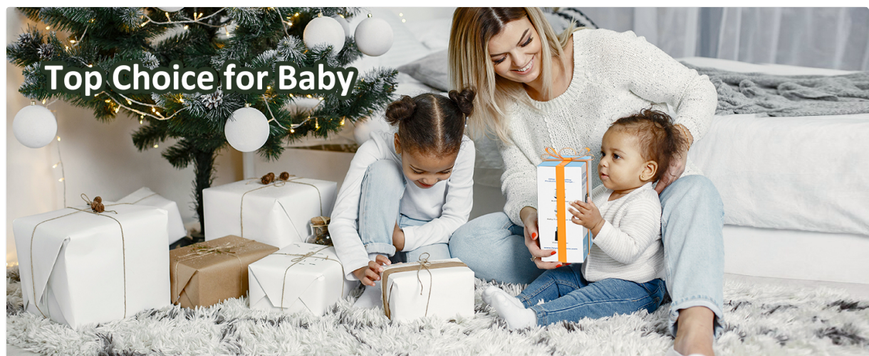
Image 5.2: The device includes soothing nursery rhymes to help calm and distract the baby during use.