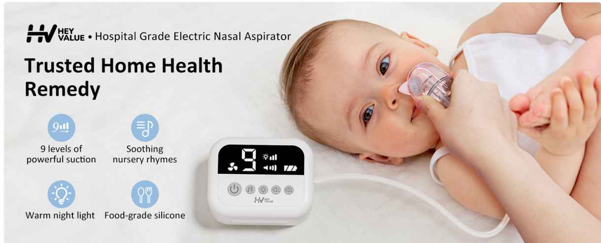
Image 5.1: The aspirator offers 9 levels of powerful suction to effectively clear nasal passages.