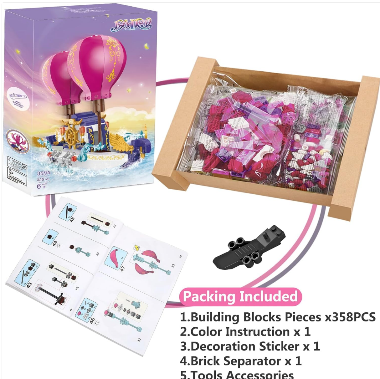
Image 2: The product packaging, showing the included building blocks, brick separator, and instruction manual.