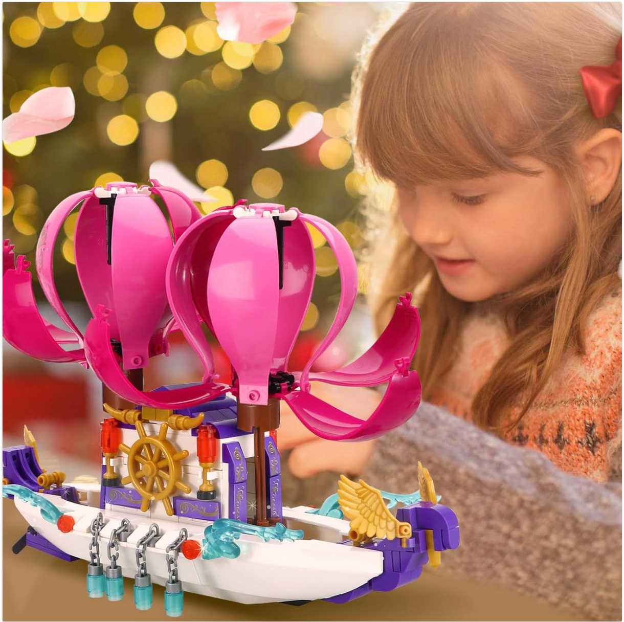
Image 4: A child interacting with the transformed petal-style sailboat, demonstrating its play potential.