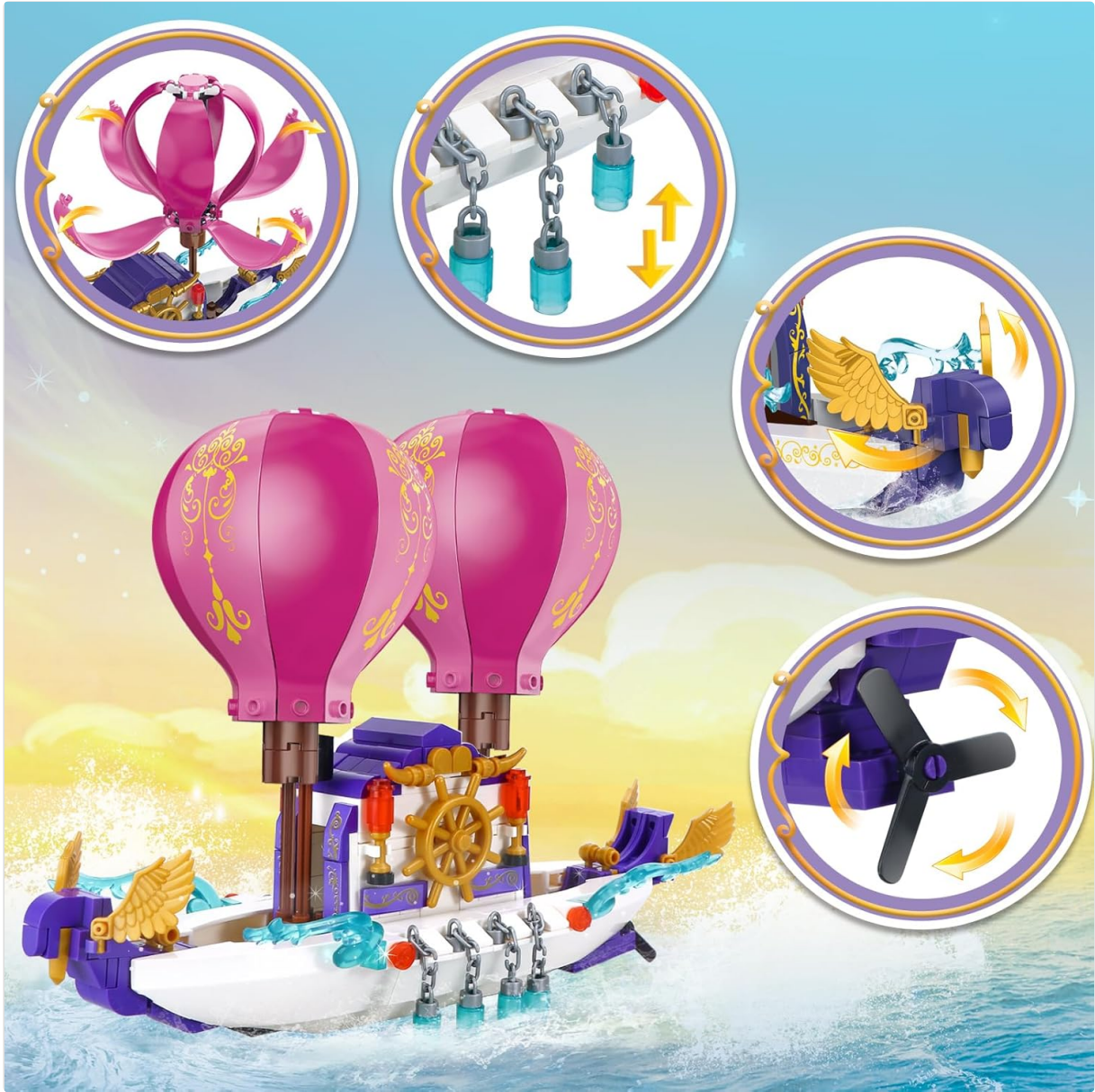
Image 3: Detailed view of the cruise ship, highlighting the hot air balloon transformation into a petal-style sailboat and the functional propeller.