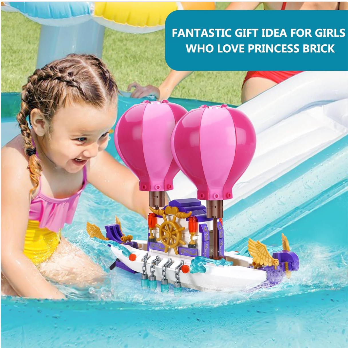
Image 5: The cruise ship being played with in a water environment, showcasing its suitability for various play settings.

FANTASTIC GIFT IDEA FOR GIRLS WHO LOVE PRINCESS BRICK