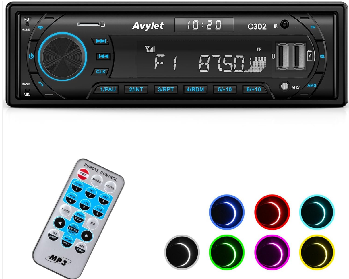
Image: Front view of the Avylet C302 car radio, showing the main display, rotary knob, USB port, AUX input, and various control buttons for mode, band, track control, and numeric presets.

Familiarize yourself with the buttons and their functions: