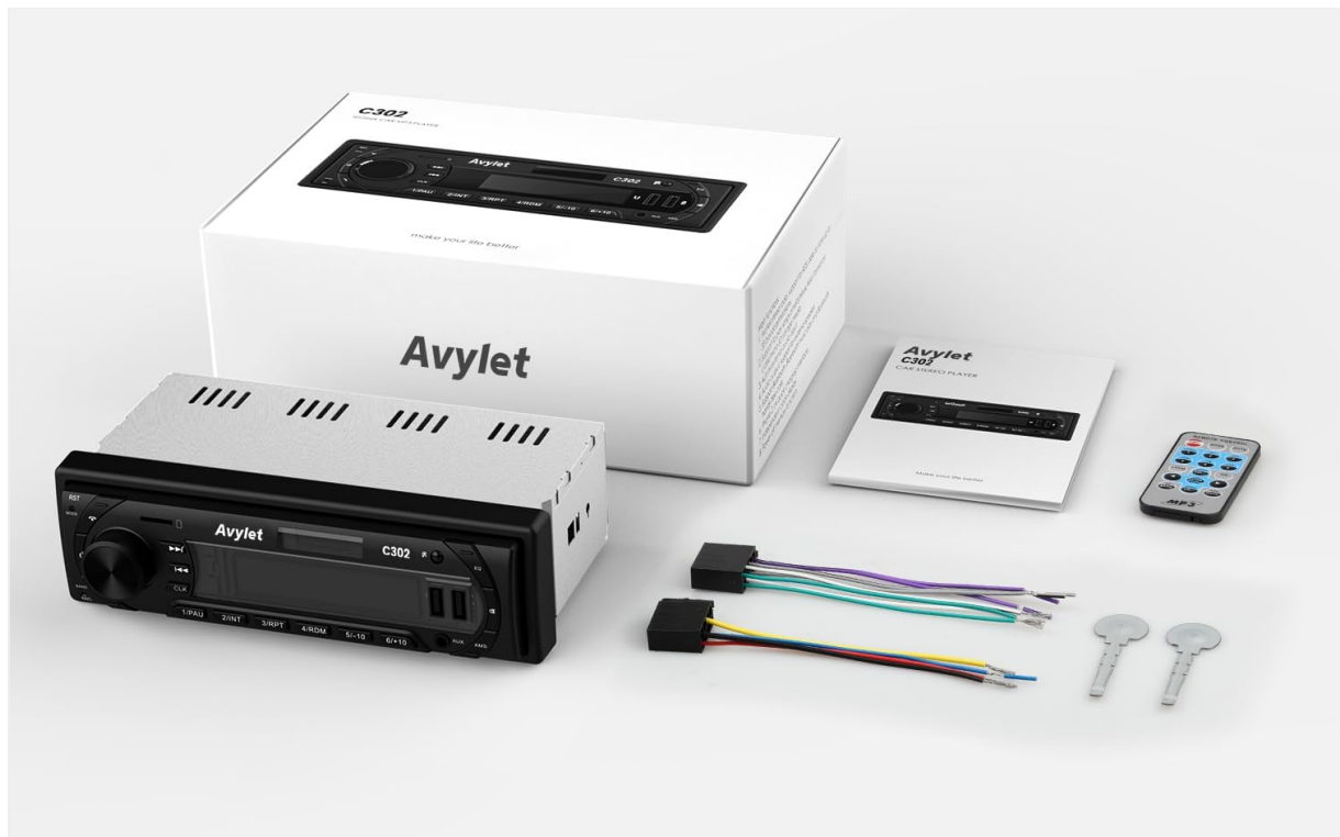
Image: Contents of the Avylet C302 package. This image displays the Avylet C302 car radio unit, a remote control, two wiring harnesses, two radio removal keys, and the user manual, all neatly arranged next to the product box.

Please check that all items listed below are included in your package: