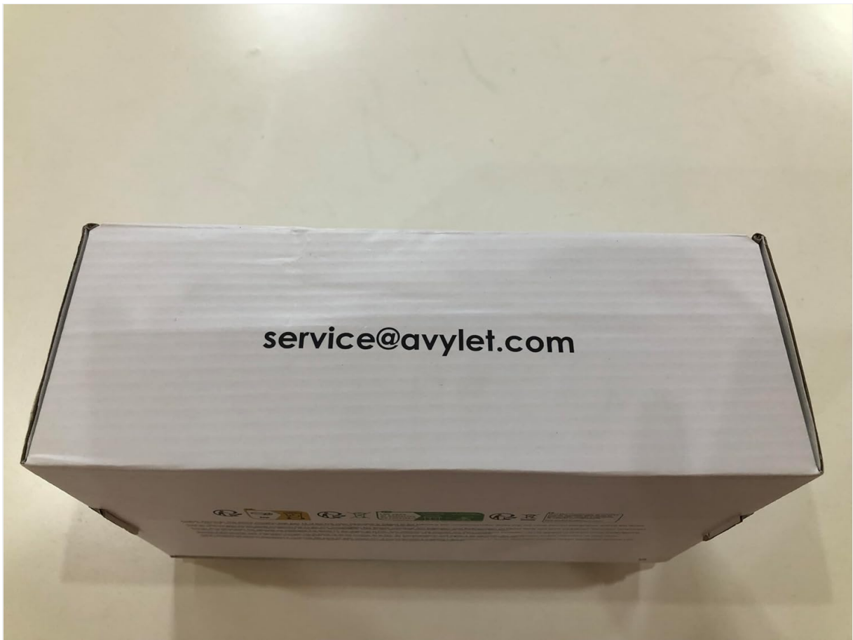
Image: The top surface of the Avylet C302 product box, clearly showing the customer service email address: service@avylet.com .