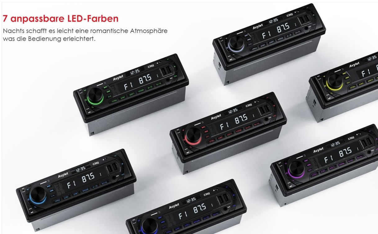
Image: A visual representation of the Avylet C302 car radio's customizable LED backlight feature. Several units are shown, each illuminated with a different color (blue, red, cyan, black, green, magenta, yellow), demonstrating the seven available color options.

Nachts schafft es leicht eine romantische Atmosphäre was die Bedienung erleichtert.