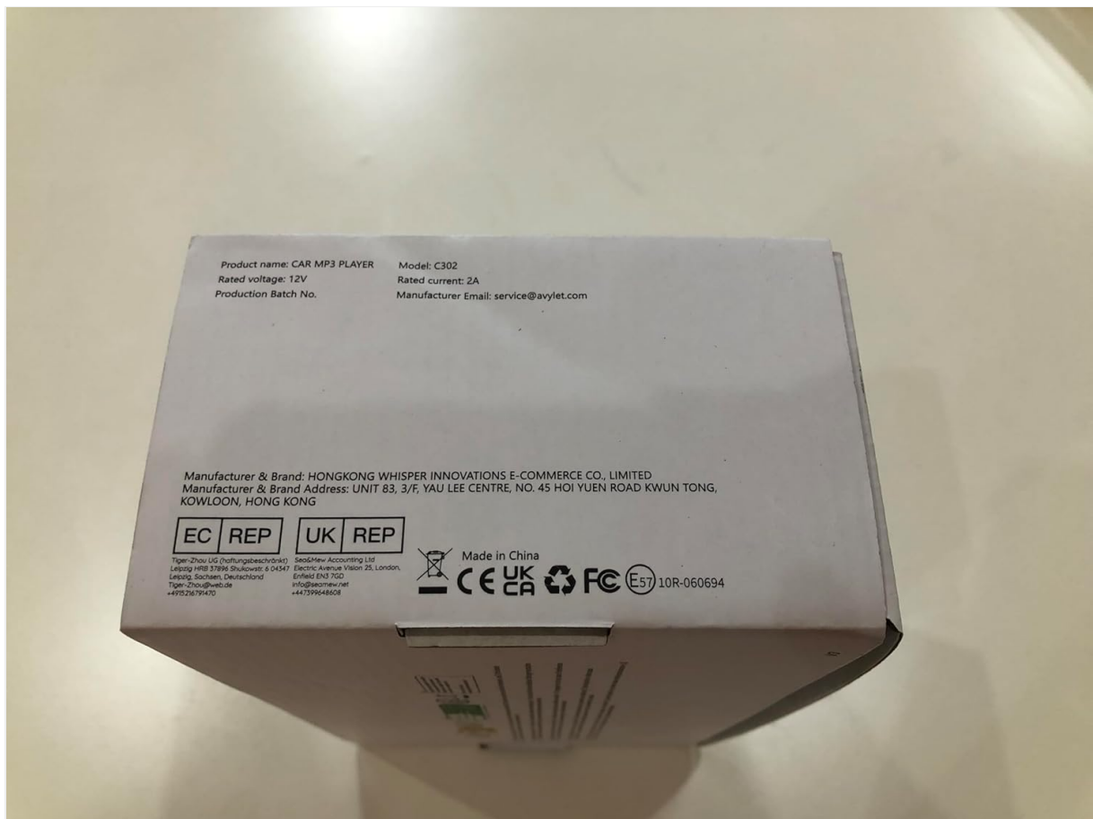
Image: The back of the Avylet C302 product box, displaying manufacturer details, product name, model, rated voltage, and various compliance markings such as CE, UKCA, FCC, and the WEEE symbol for proper disposal.