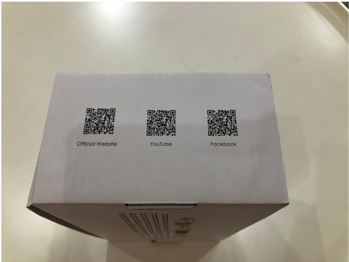
Image: The side of the Avylet C302 product box, featuring three QR codes. These codes link to the official website, YouTube channel, and Facebook page, providing quick access to online resources.