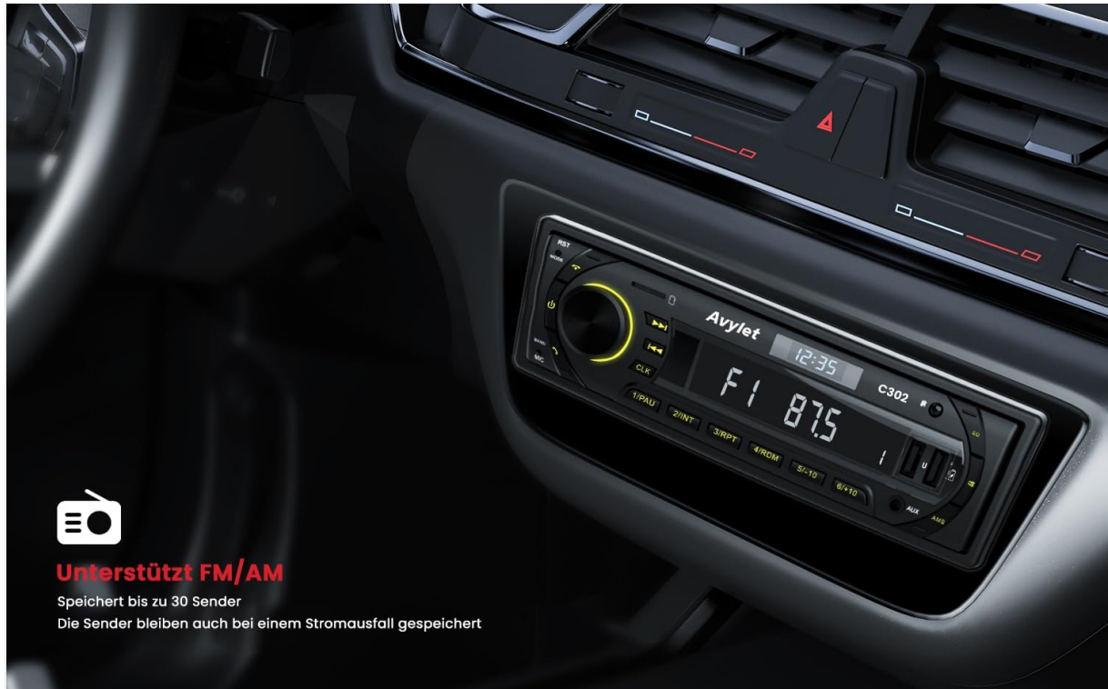
Image: The Avylet C302 car radio seamlessly integrated into a vehicle's dashboard, showing the display tuned to an FM radio frequency (87.5 MHz). This highlights its primary function as an FM/AM receiver.