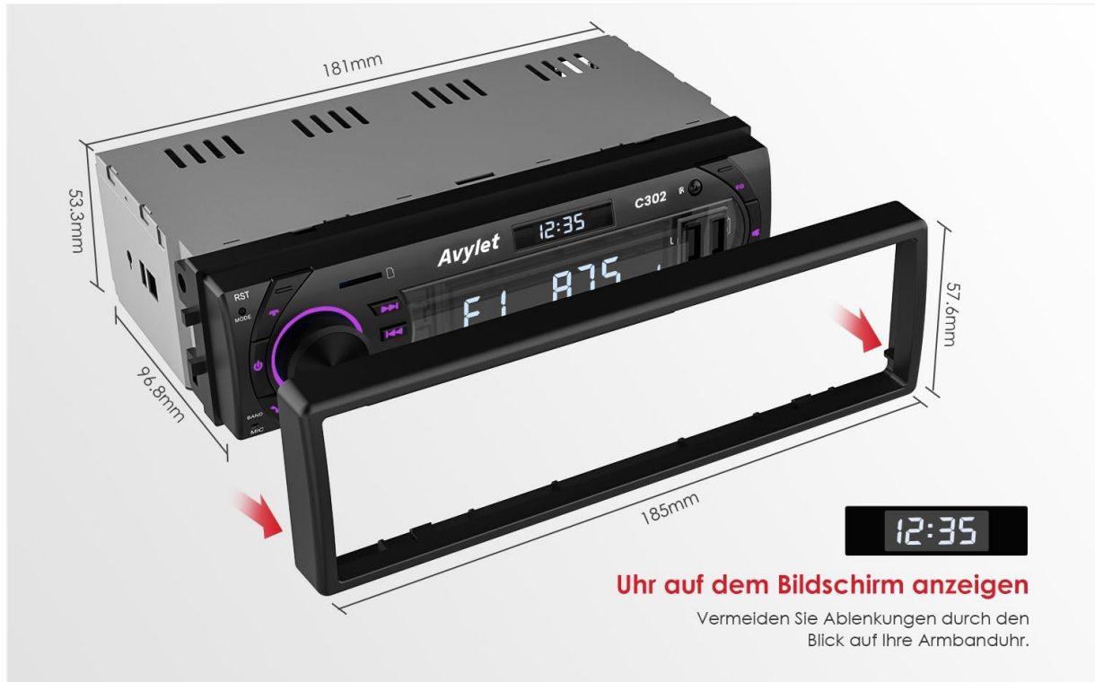
Image: Dimensional drawing of the Avylet C302 car radio. The image shows the unit's depth (11.5 cm), width (18.9 cm), and height (5.8 cm), along with the dimensions of the removable trim frame.

The compact design of the Avylet C302 ensures a perfect fit for standard 1-DIN slots. Refer to the image above for detailed dimensions.