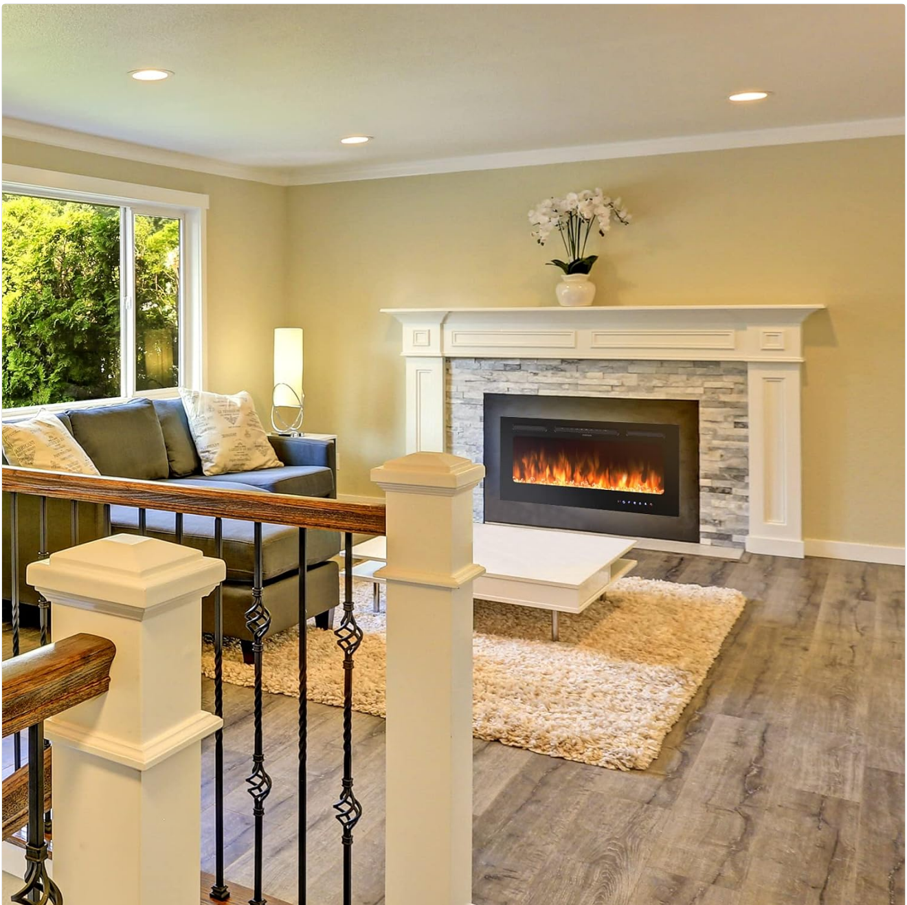
Figure 4.2: Examples of the fireplace installed using both wall-mounted and recessed methods, showcasing its versatility in various room designs.