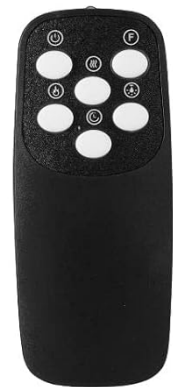
Figure 5.1: Overview of the touch control panel and remote control, highlighting the various functions for operating the fireplace.