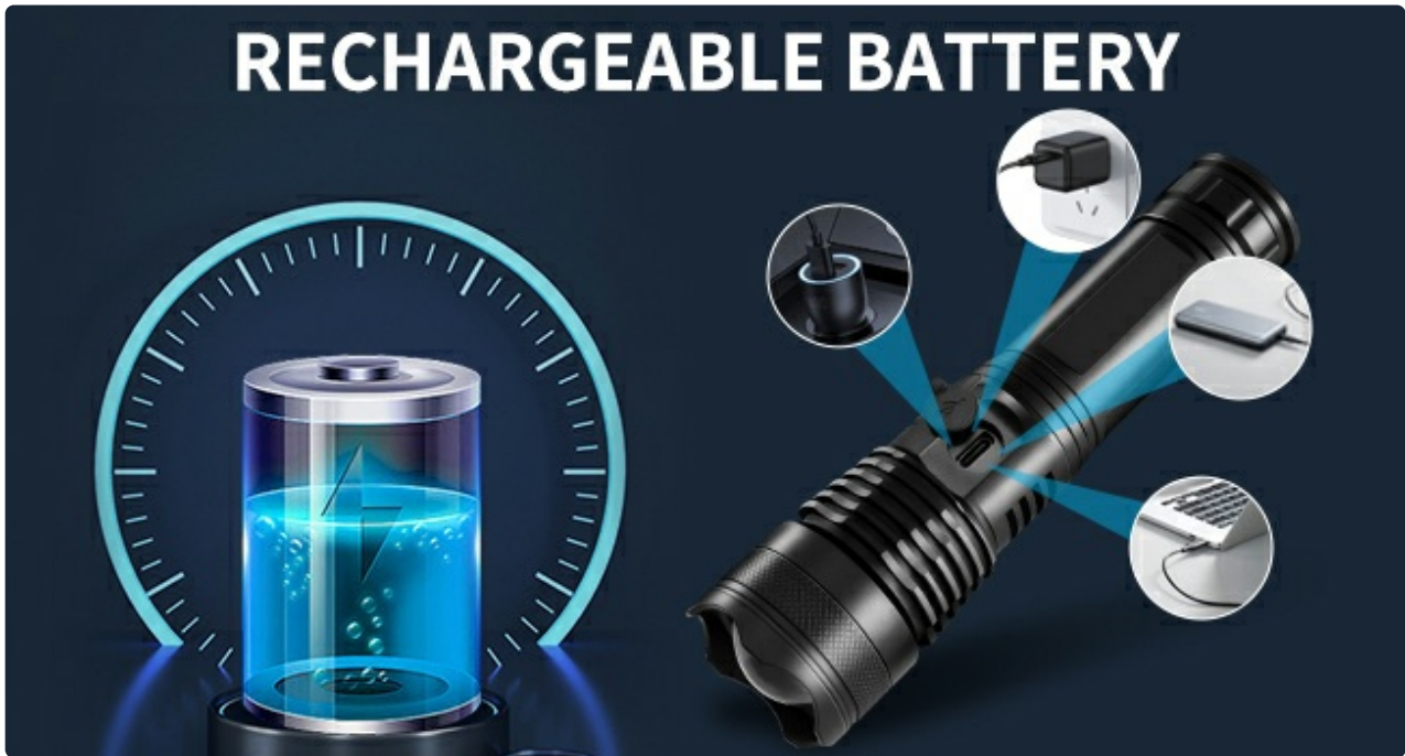
Image: Rechargeable battery with different charging options.

Monitor the four blue power indicators to keep track of the battery level. Recharge the flashlight when the indicators show low power to ensure it's always ready for use. Avoid completely draining the battery to prolong its lifespan. The Type-C charging port is designed for efficient and convenient recharging.