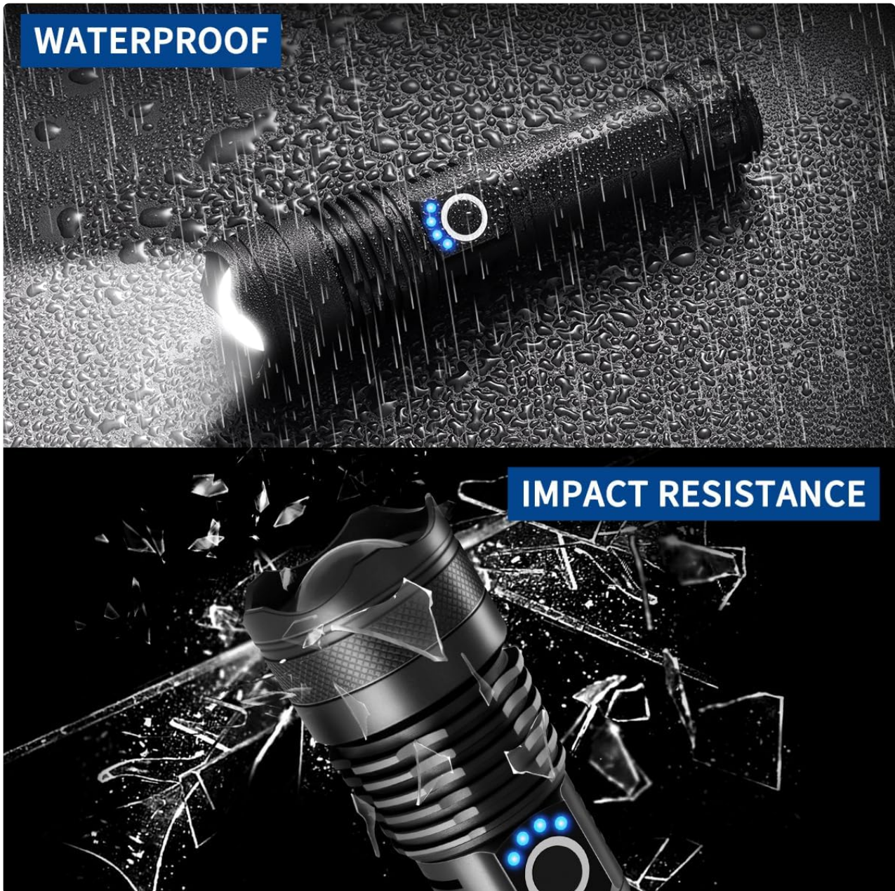
Image: The flashlight being used in diverse environments, highlighting its versatility.