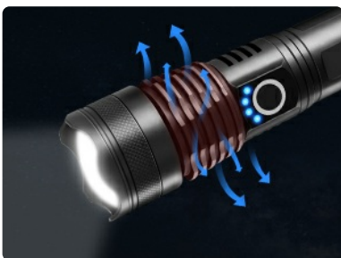
Image: Detailed view of the all-aluminum flashlight's components and features.