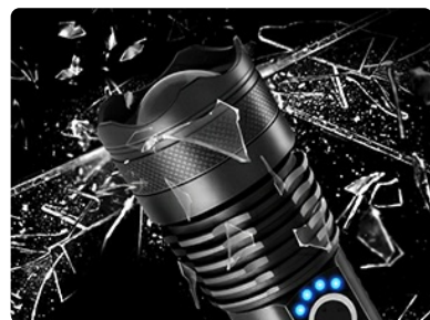
Images: Demonstrations of heat dissipation, waterproof design, and impact resistance.