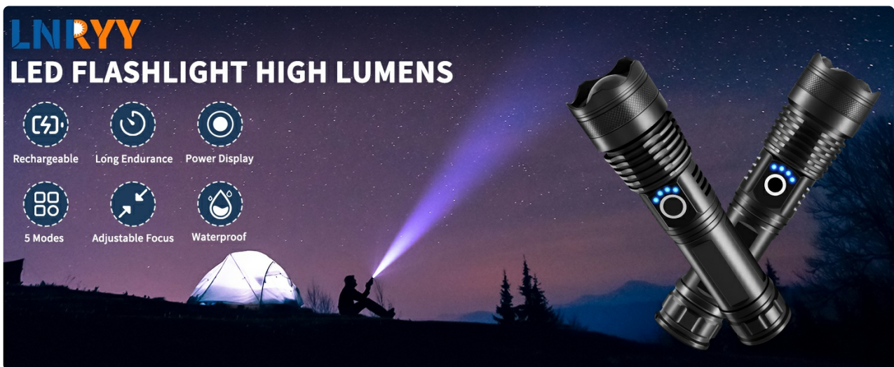
Image: LNRYY LED Flashlight High Lumens banner, illustrating the product in an outdoor setting.

Thank you for choosing LNRYY High Lumens Rechargeable Flashlights. This manual provides essential information for the safe and effective use of your new flashlights. Designed for versatility and durability, these flashlights are ideal for a wide range of activities including camping, hiking, home use, and emergency situations. Please read this manual thoroughly before operation and retain it for future reference.