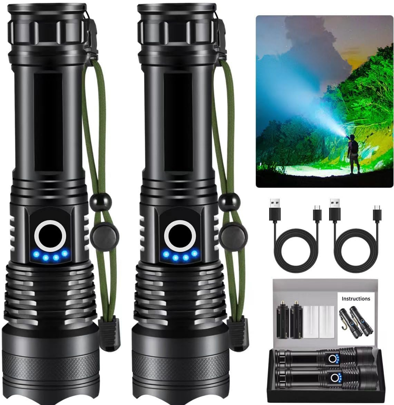
Image: A visual representation of all components included in the product package.