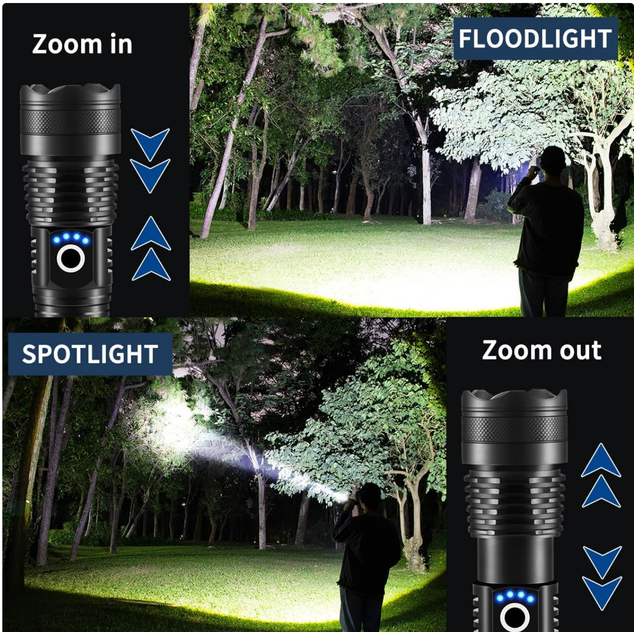
Image: Illustration of the flashlight's zoom function, showing how to switch between spotlight and floodlight.

Video: Demonstrates the flashlight's brightness and adjustable focus in a dark outdoor setting.