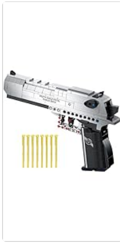
Image 4.2: Visual guide for key assembly and operational steps, including loading and firing.

If you encounter difficulties with the visual instructions, consider using a translation app like Google Lens on the physical manual for text assistance, as some manuals may contain non-English text.