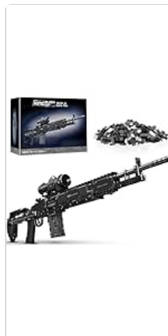
Image 5.2: Demonstrating the adjustable magnifier's visual effects.

The scope on your M24 model features an adjustable magnifier. Rotate the adjustment dials on the scope to change the simulated magnification effect, as illustrated below.