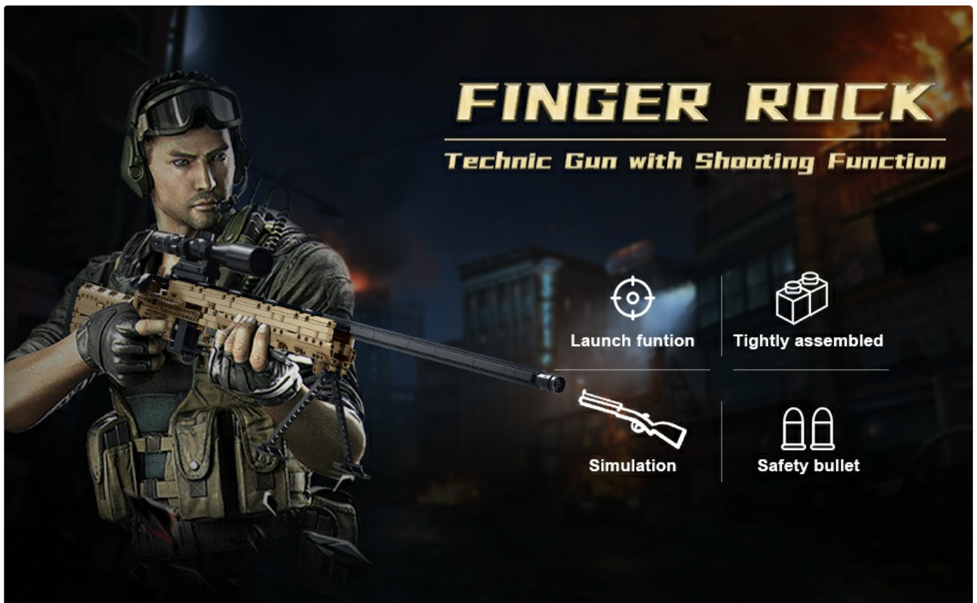
Image 1.1: The completed Finger Rock M24 Sniper Rifle Model, featuring 1086 pieces and recommended for ages 14 and up.