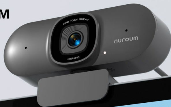
Image: The NUROUM V15-AF webcam connected to a laptop, illustrating the simple USB plug-and-play setup.