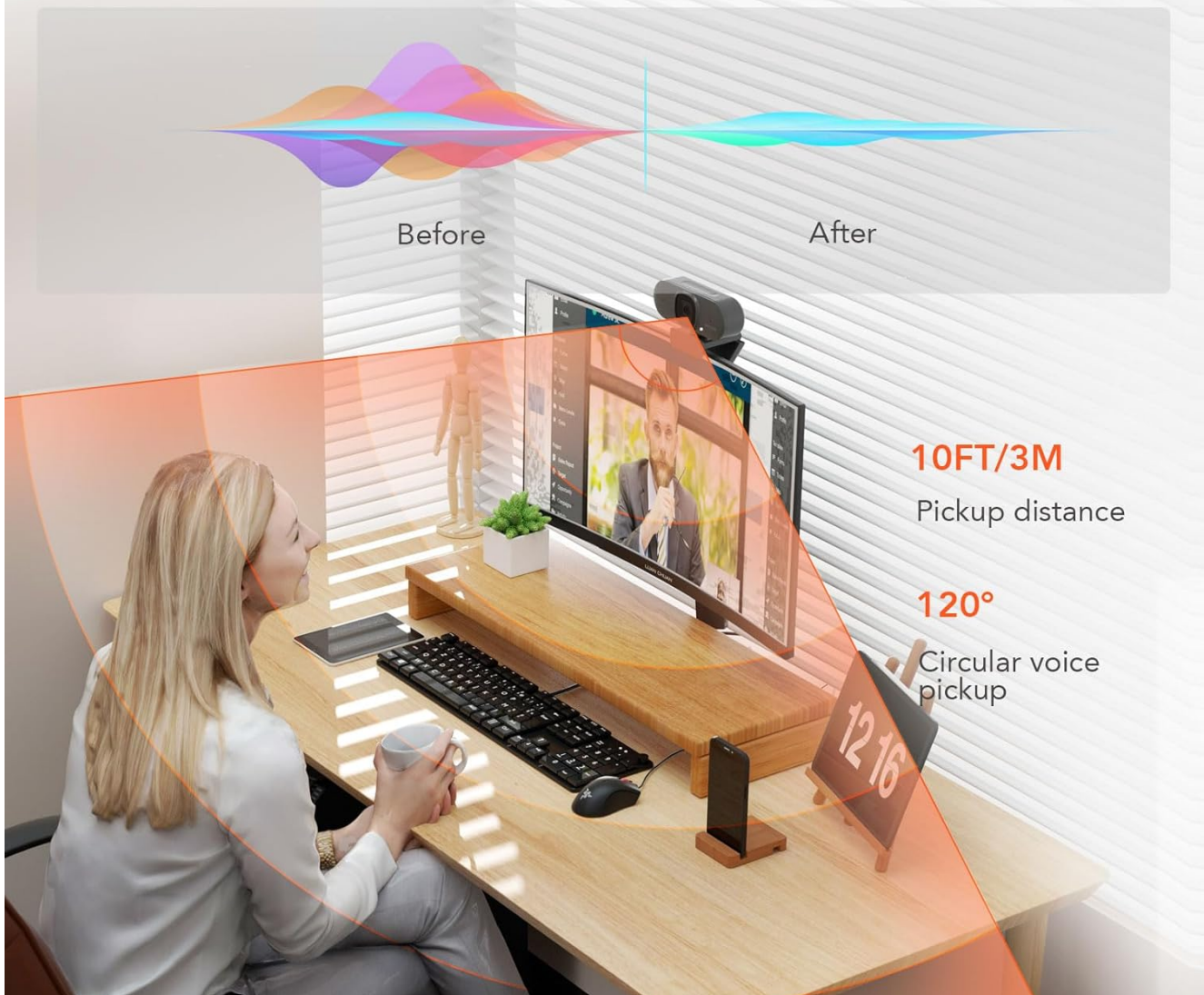
Image: Illustration of the 3-meter voice pickup range and noise suppression feature of the dual microphones, showing a user at a desk.