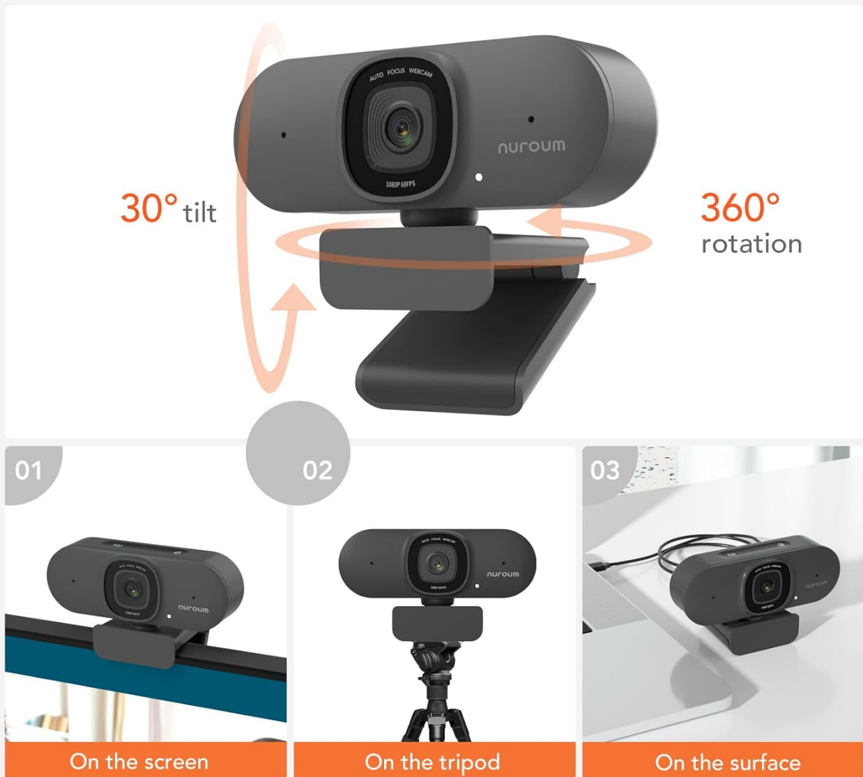
Image: Various installation methods for the webcam: clipped onto a screen, mounted on a tripod, and placed on a flat surface.