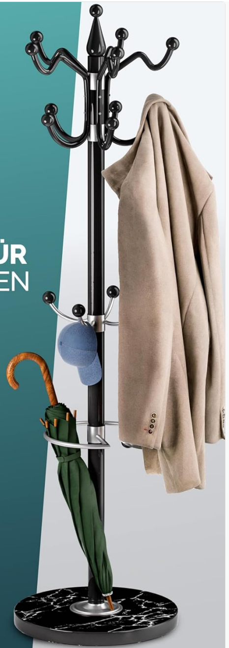
Image 4.1: Visual representation of key features, aiding in assembly understanding.