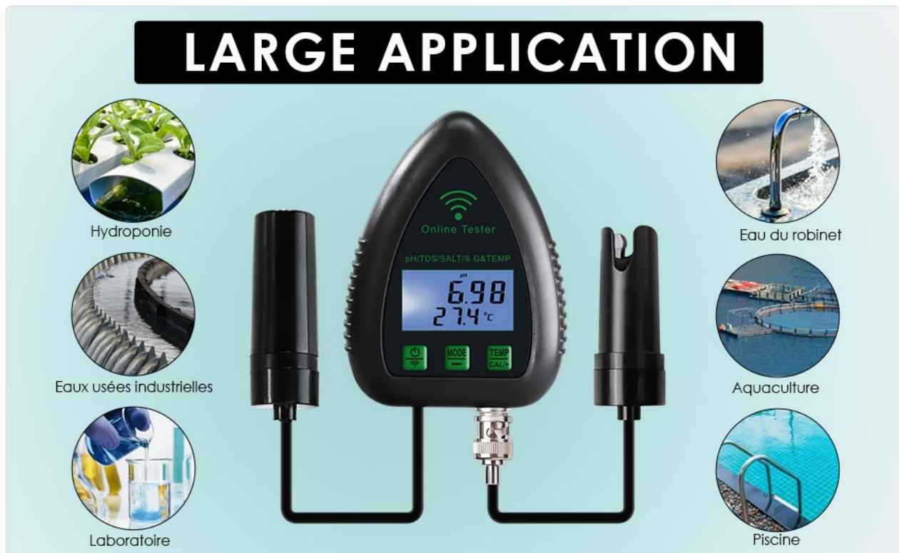
Image 12.1: Visual representation of various applications including Hydroponics, Industrial Sewage, Swimming Pools, Aquaculture, Tap Water, and Laboratories.

The GAIN EXPRESS WQM-397 Water Quality Tester is suitable for a wide range of applications: