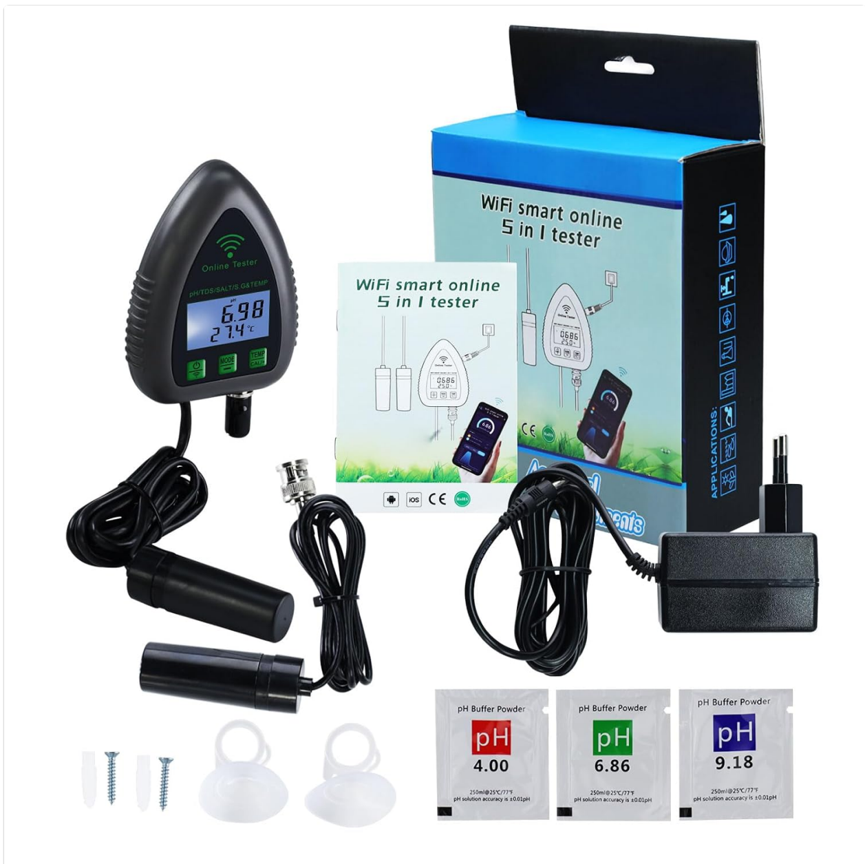
Image 3.1: Contents of the GAIN EXPRESS WQM-397 package, including the main unit, electrodes, power adapter, and calibration powders.