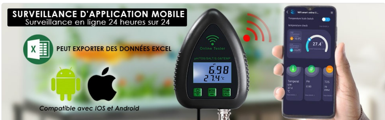
Image 5.2: Illustration of mobile application monitoring, showing real-time data and compatibility with iOS and Android.