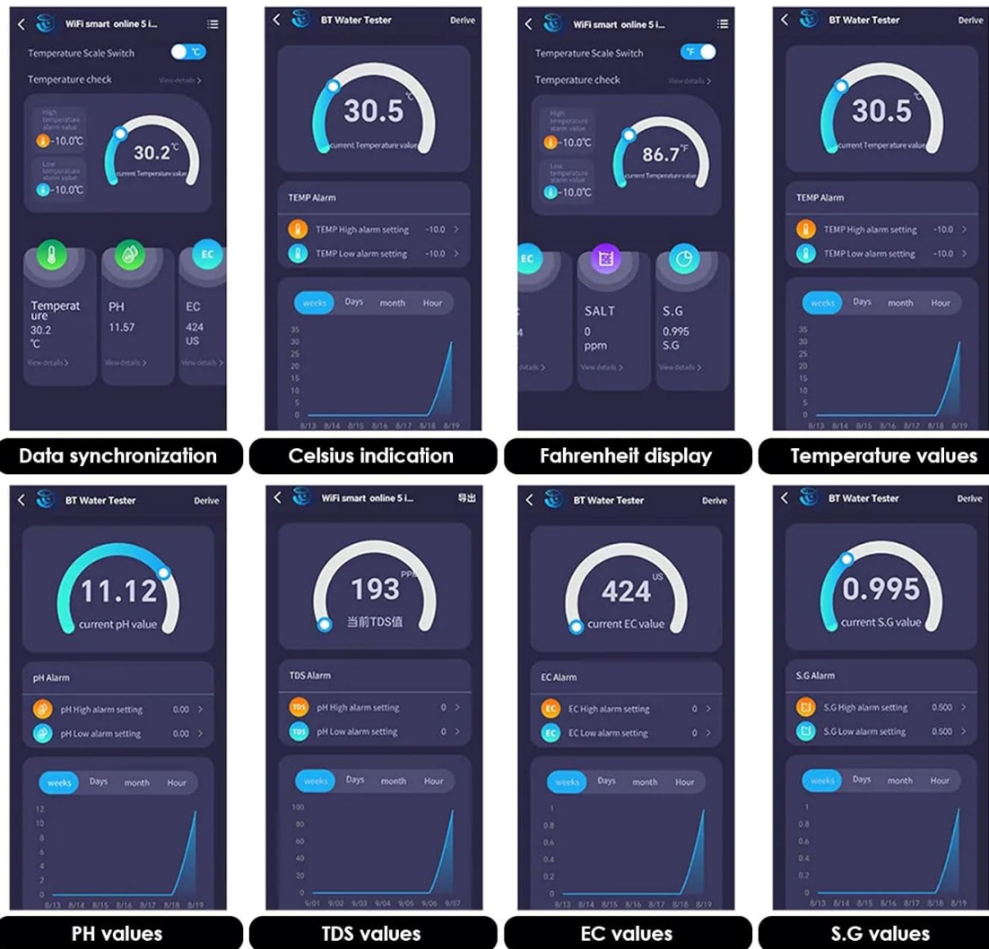
Image 6.2: Example of TDS measurement, illustrating the device displaying a TDS value and temperature, with a chart indicating TDS levels.