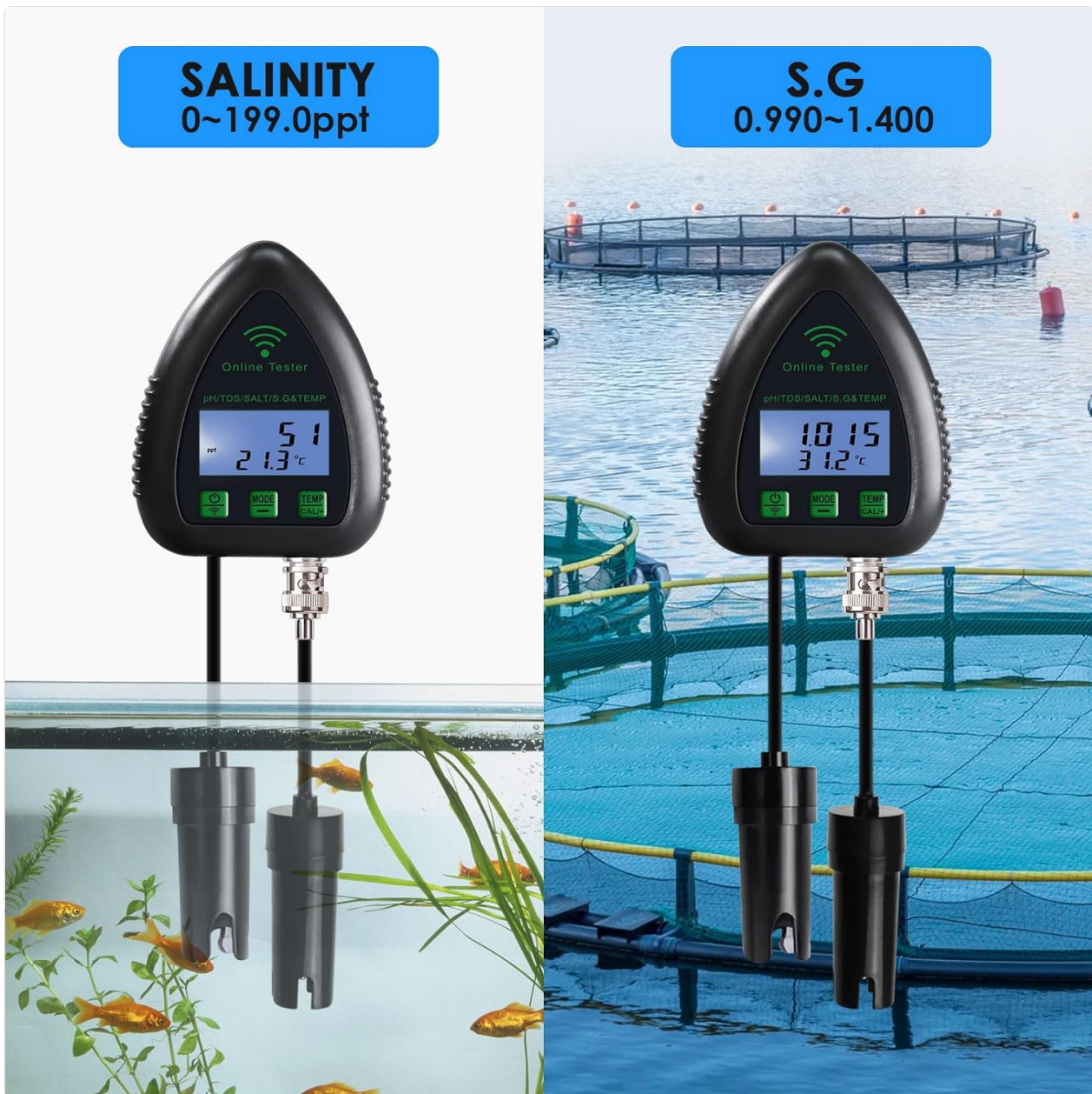
Image 6.3: Examples of Salinity and Specific Gravity (S.G) measurements, showing the device displaying respective values and temperatures in different aquatic environments.