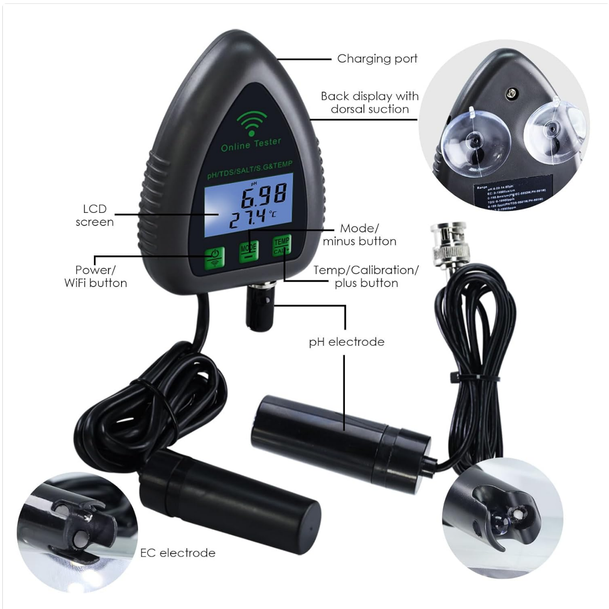
Image 4.1: Labeled diagram showing the main unit, LCD screen, Power/WiFi button, Mode button, Temp/Calibration button, Charging port, pH electrode, and EC electrode.