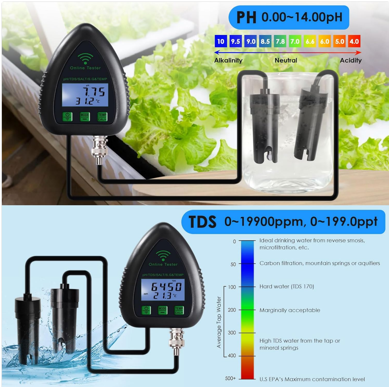
Image 6.1: Example of pH measurement, showing the device displaying a pH value and temperature, with a pH scale for reference.