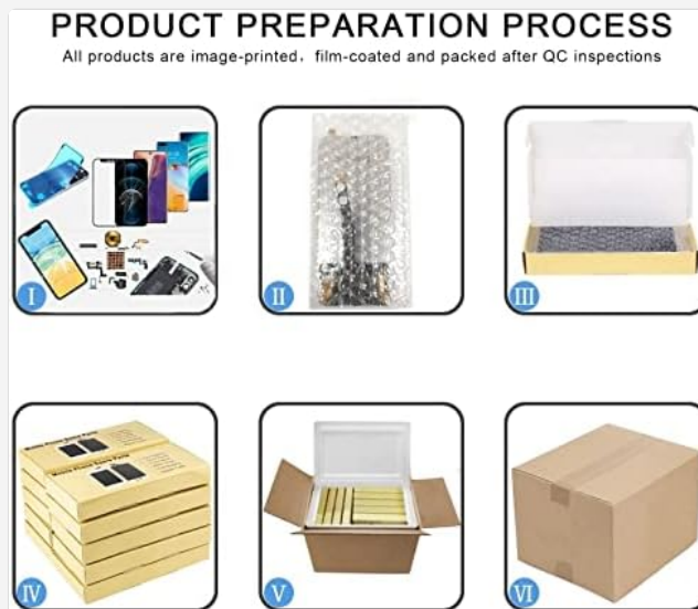
Image: Illustration of the product preparation process, showing quality control, protective packaging, and bulk packaging. This highlights the care taken before the product reaches the customer.

5. Reassembly: Reassemble your phone, taking care to secure all components and screws.