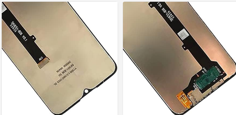
Images: Close-up views of the LCD flex cable and its connection point. Handle this component with extreme care to prevent damage.

Please make sure the LCD cable is not over-bent. Bending it over 90 degrees will cause a black display or other damage.