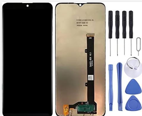
Image: The LCD screen assembly alongside a set of repair tools. The tools include screwdrivers, pry tools, a suction cup, and picks, indicating that the product is intended for self-installation or professional repair.