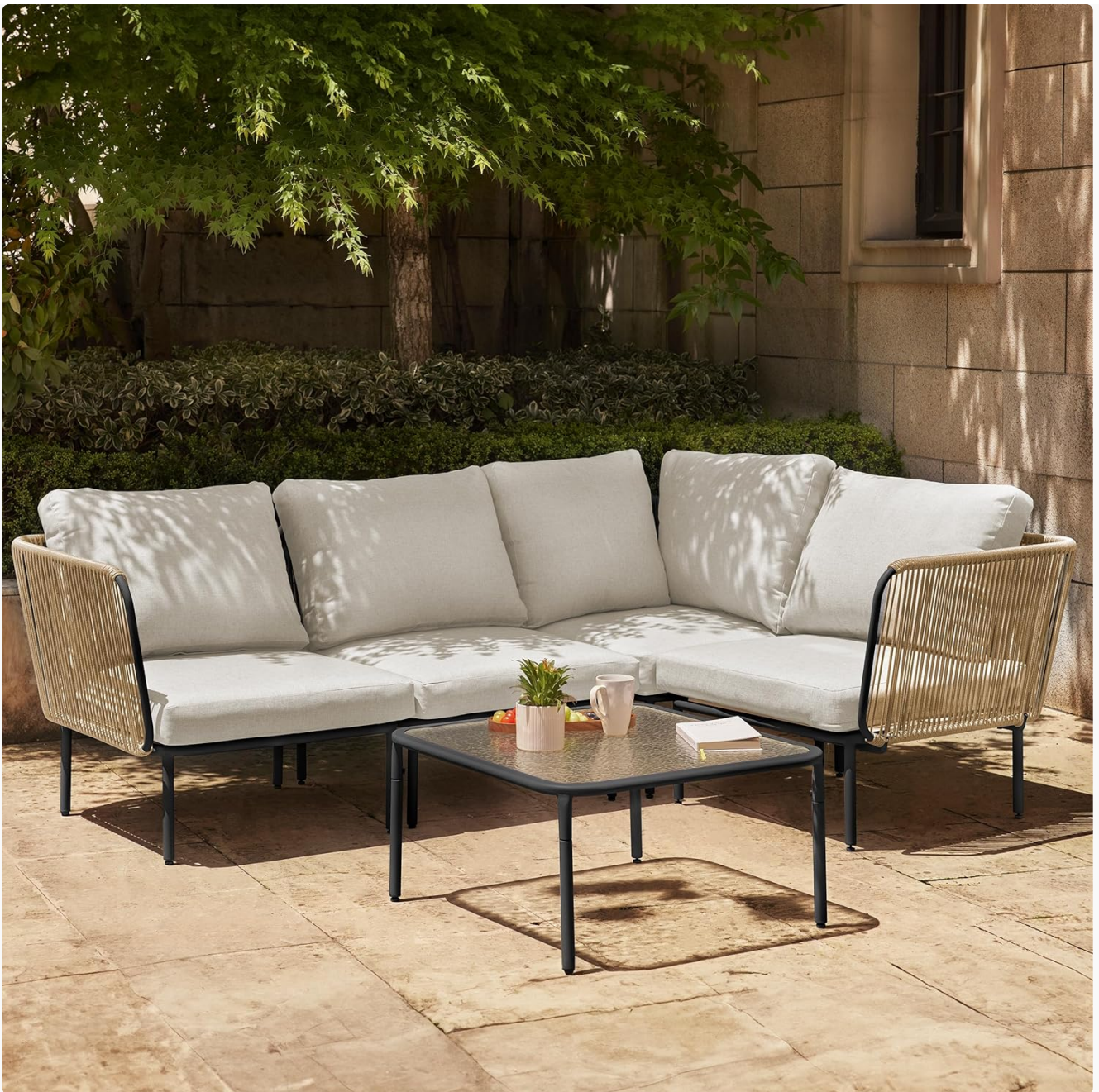
Image 1.1: The EAST OAK 5-Piece Montauk Modular Patio Furniture Set in an L-shaped configuration.