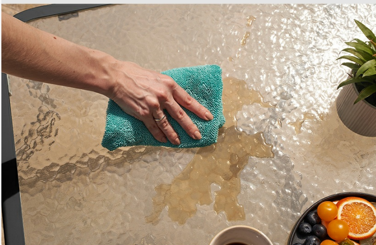
Image 5.1: Easy maintenance for daily use, including cushion cleaning.

Spend more time relaxing and less time cleaning.