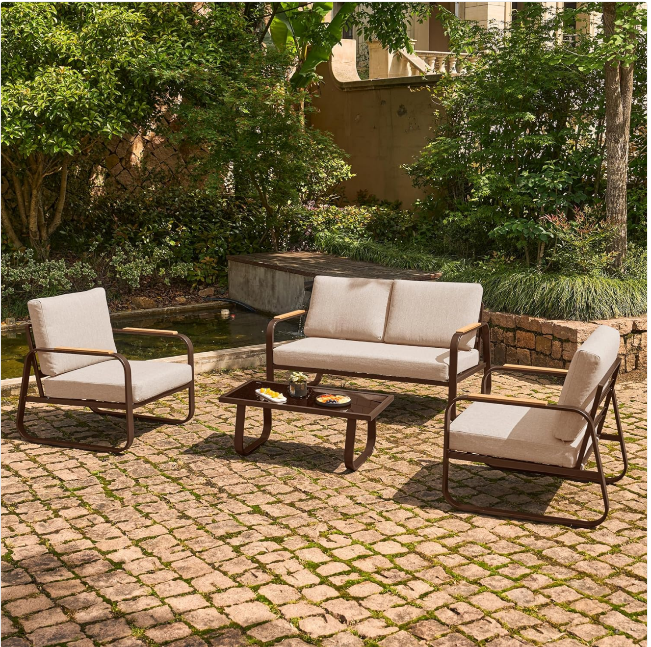
Image: The complete EAST OAK 4-Piece Patio Furniture Set, featuring a loveseat, two single chairs, and a coffee table, arranged on a paved patio in a lush garden environment.