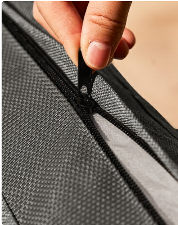
Image 5.2: A close-up view of the cushion zipper, indicating its removable and washable design.