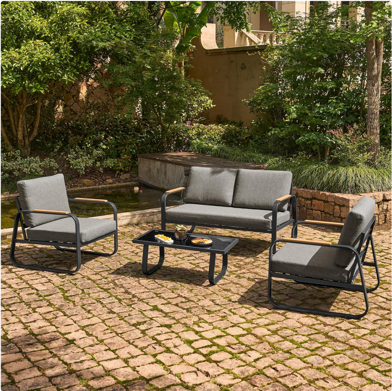
Image 1.1: The EAST OAK 4-Piece Patio Furniture Set, featuring a loveseat, two single chairs, and a coffee table, arranged in an outdoor garden setting.