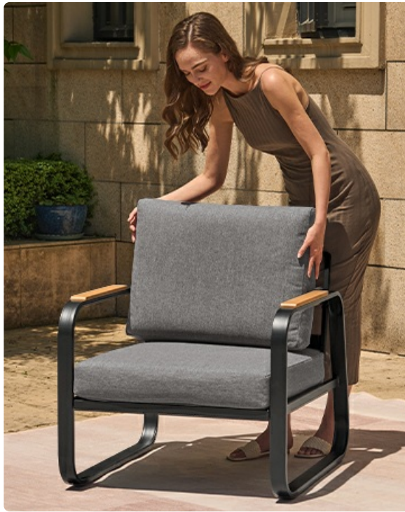
Image 5.1: A person adjusting a cushion, demonstrating the ease of handling for cleaning or repositioning.