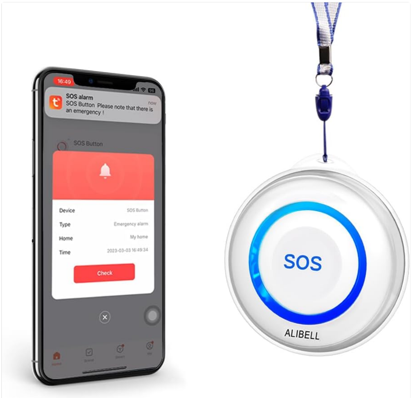
Image: The ALIBELL SOS button and a smartphone showing an emergency alert.