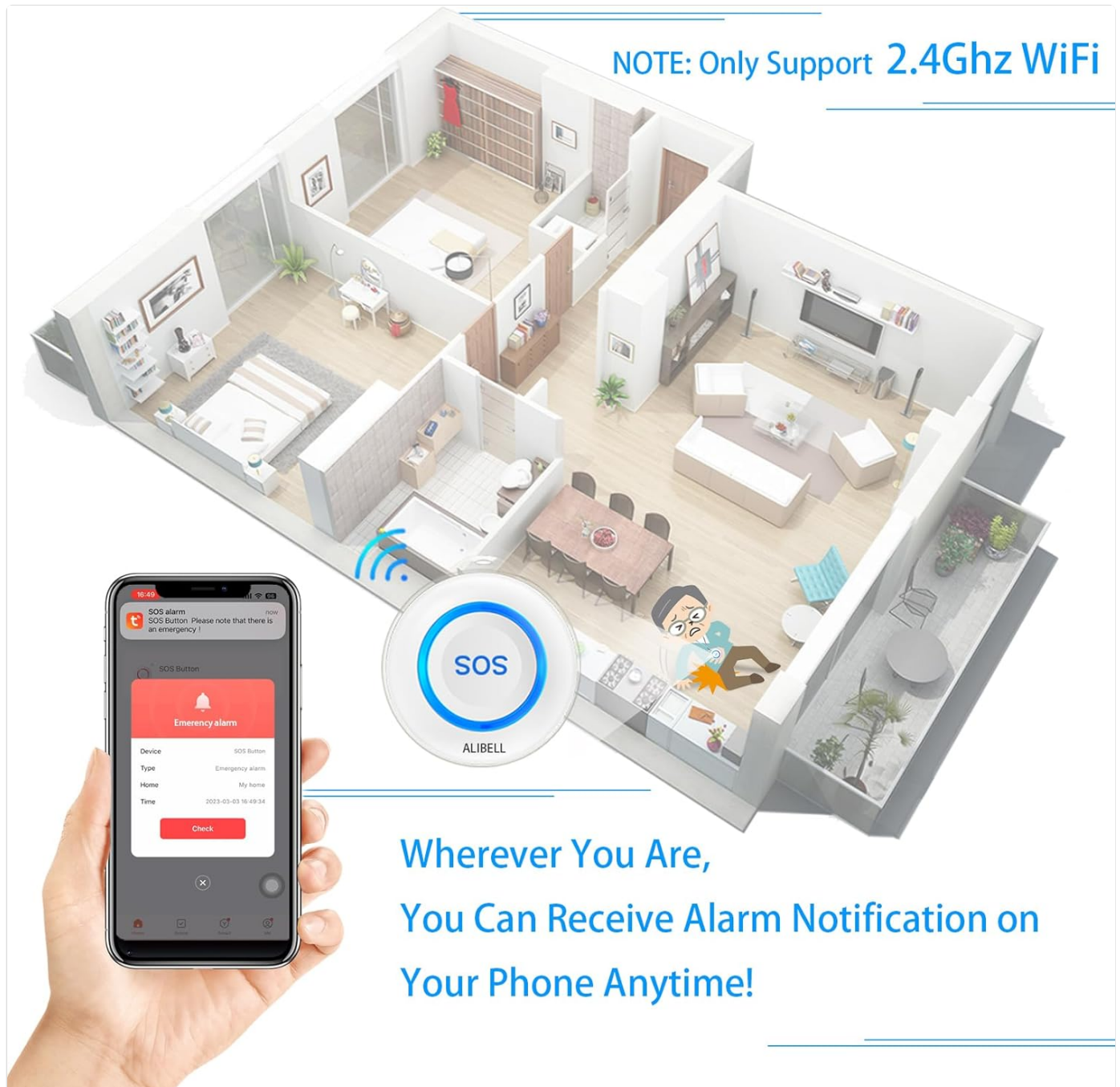
Image: Illustration of the SOS button's WiFi connectivity and remote notification capability.