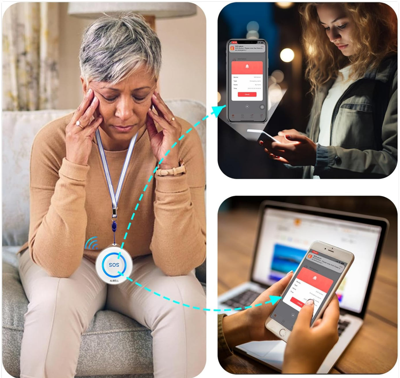
Image: The SOS button in use, with notifications appearing on mobile devices.