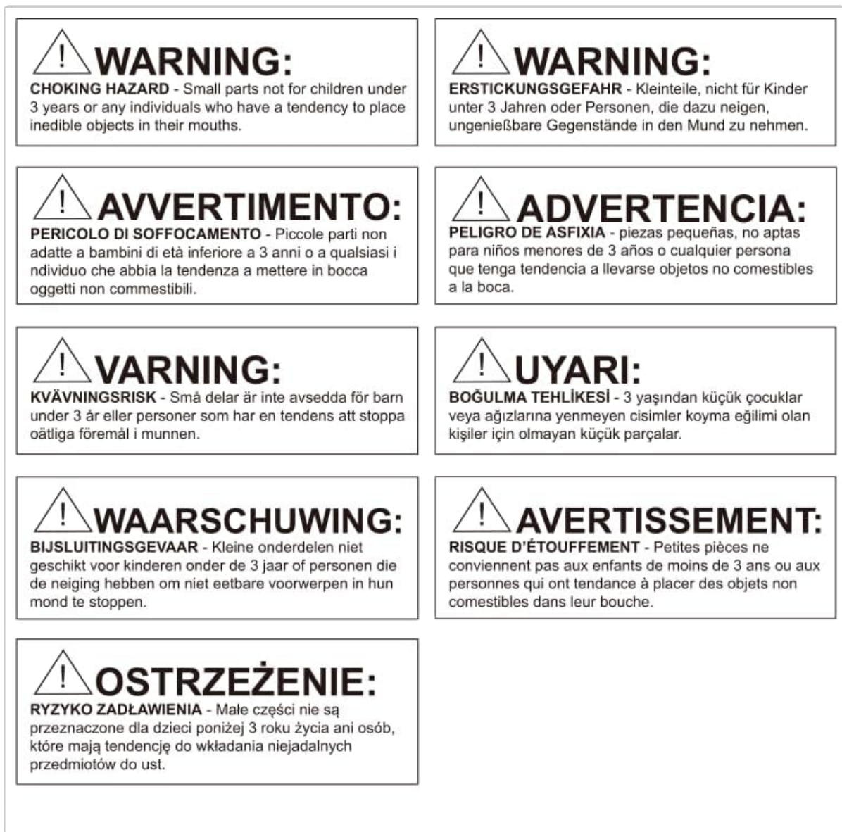
Image: Important safety warning regarding choking hazards.