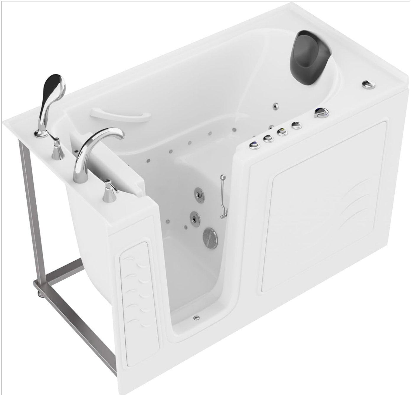
Figure 2.1: Angled view of the ANZZI 3060WIL Walk-In Bathtub, showcasing the door, faucet, and control panel.