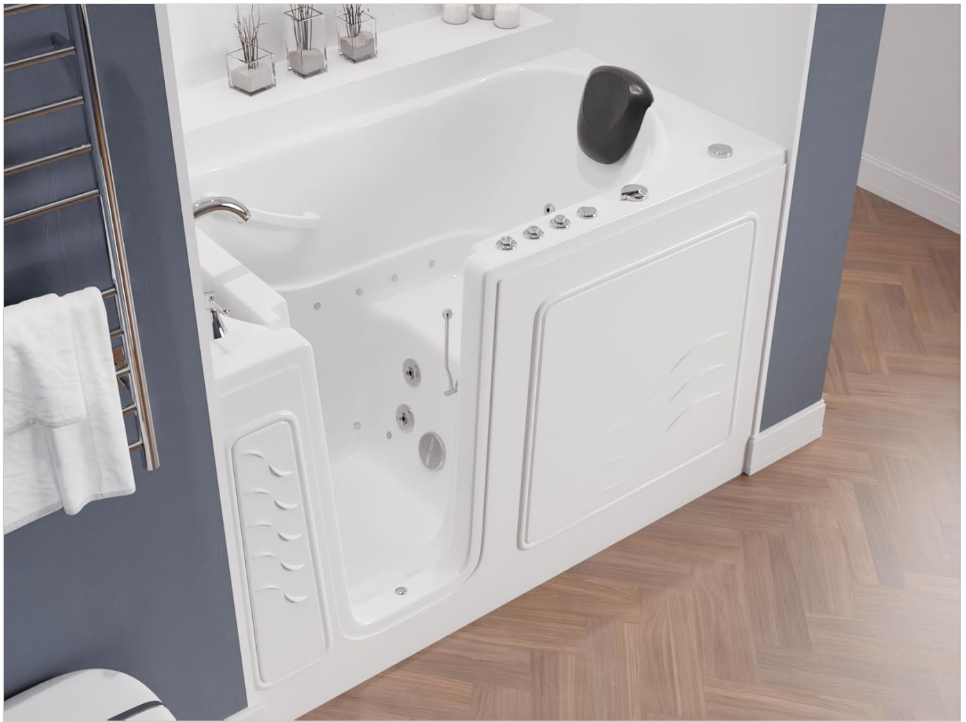
Figure 4.2: Close-up view of the bathtub interior, showing the whirlpool jets and control buttons.