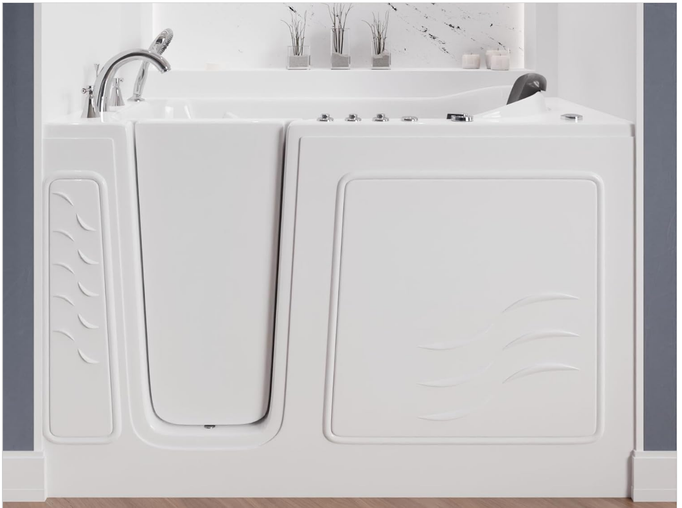
Figure 2.3: Front view of the ANZZI 3060WIL Walk-In Bathtub, highlighting the entry door and control panel.