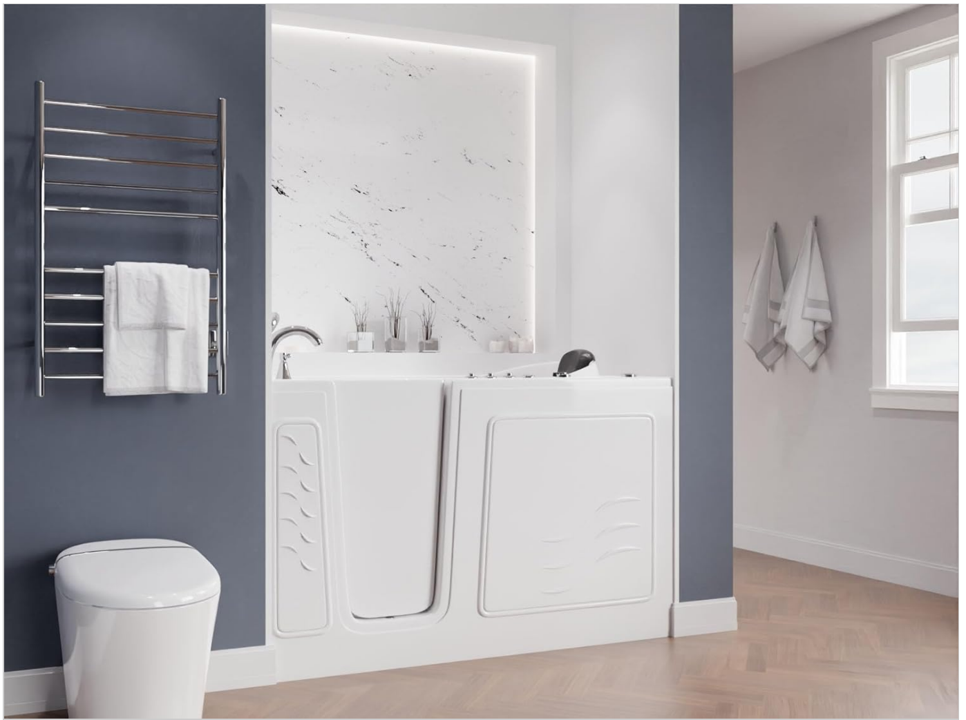
Figure 2.2: The ANZZI 3060WIL Walk-In Bathtub integrated into a modern bathroom setting, viewed from the side.