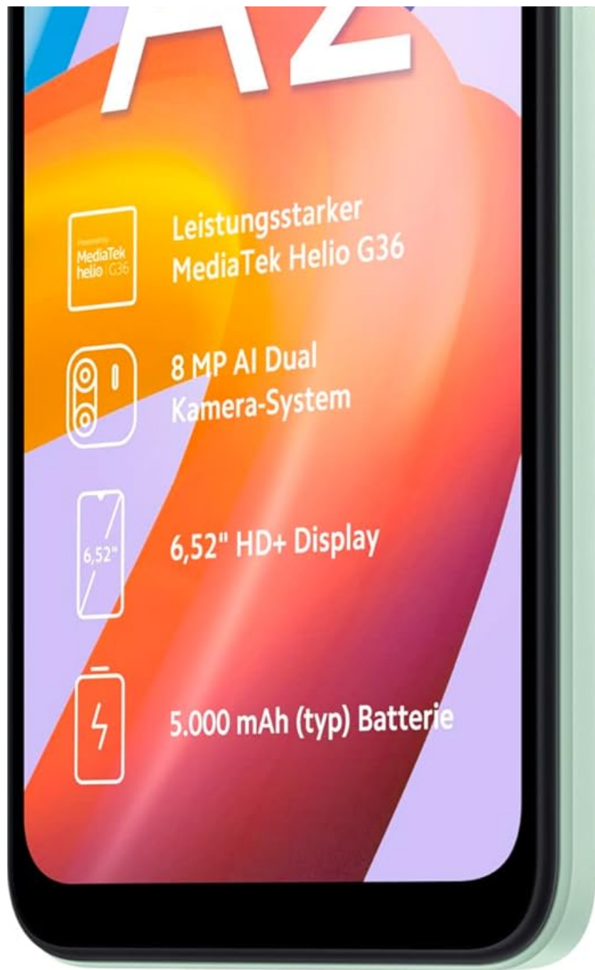
Figure 1.1: Front view of the Xiaomi Redmi A2, highlighting its display and key features.