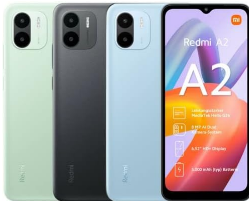
Figure 7.1: Xiaomi Redmi A2 available in various color options.

Color: Light Green Global ROM (other colors may be available)