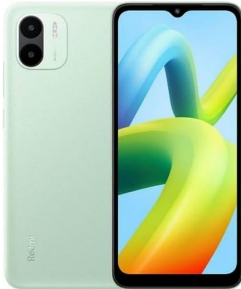
Figure 1.2: Front and back view of the Redmi A2 in Light Green, showcasing its design.