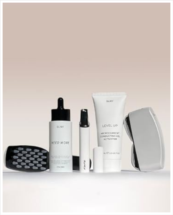
Image: Solaris Laboratories NY Level UP Microcurrent Conductive Gel shown with other skincare items and a microcurrent device, illustrating its use in a complete skincare routine.