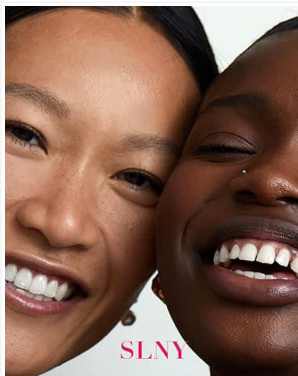
Two women smiling, with the SLNY logo visible, representing the brand's focus on diverse skin types.