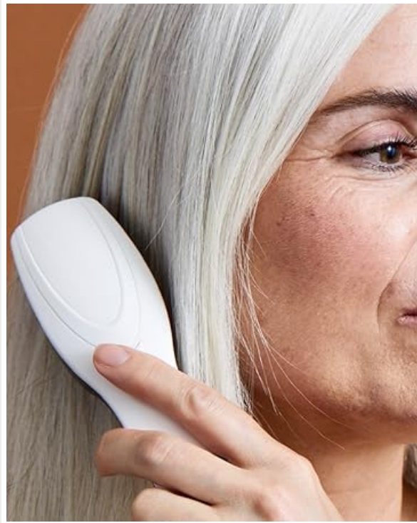
A woman using a scalp massager, part of Solaris Laboratories NY's broader product range.