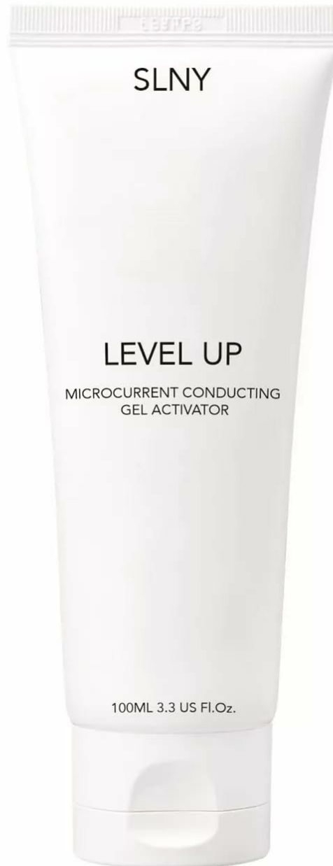
Solaris Laboratories NY Level UP Microcurrent Conductive Gel product packaging.