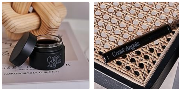
Figure 8: The glass stash jar and smell-proof tube for secure storage.

The glass stash jar and smell proof tube are designed for additional discreet and odor-contained storage of smaller items. Ensure their lids are securely fastened to maintain their smell-proof properties.