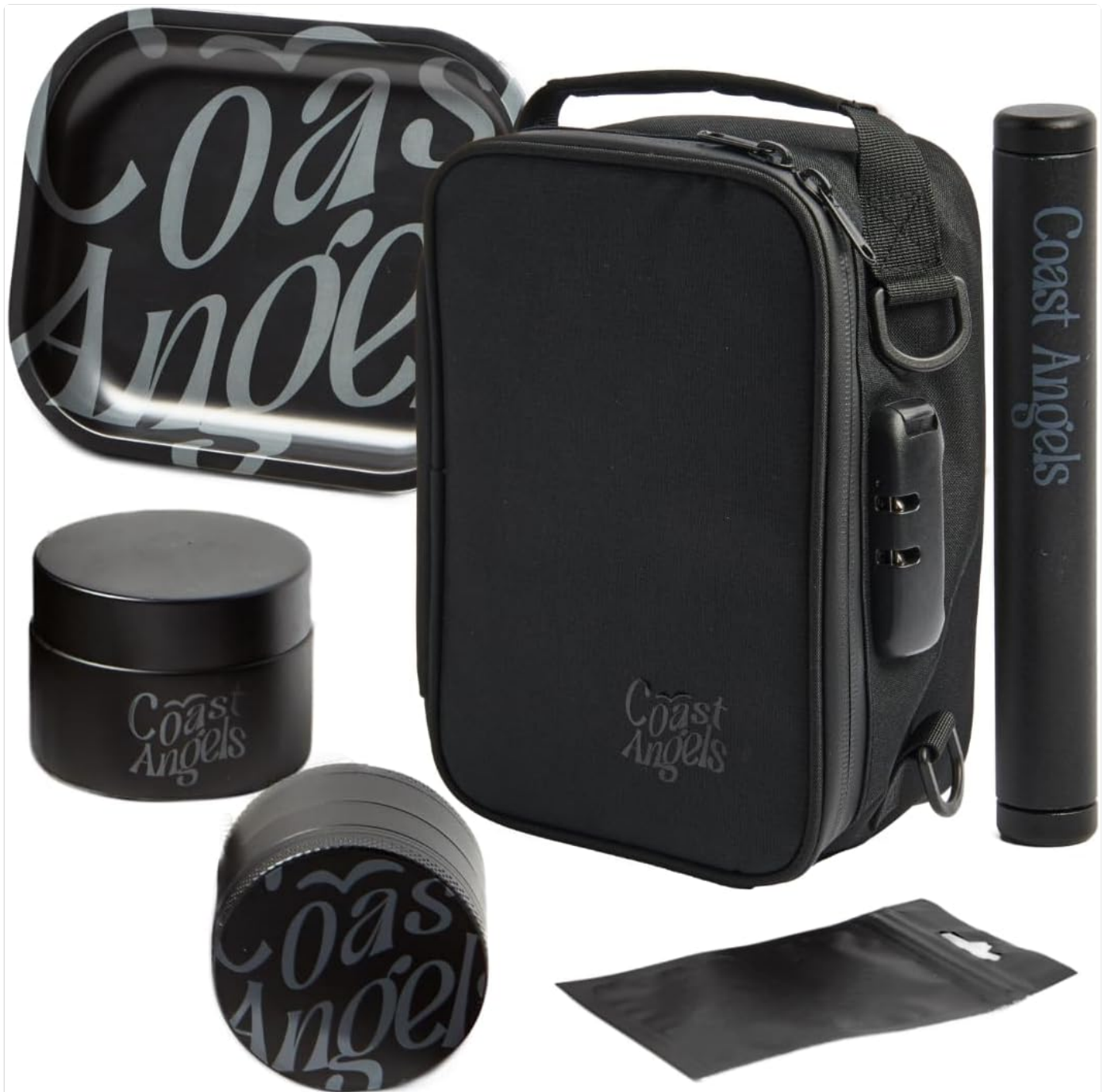
Figure 2: Overview of the COAST ANGELS Smell Proof Bag and its accompanying accessories.