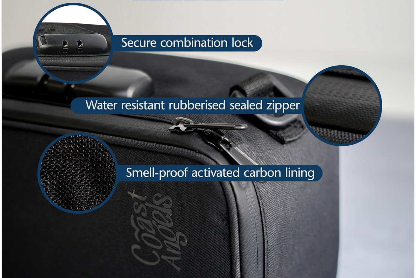
Figure 3: Detail of the secure combination lock and bag features.