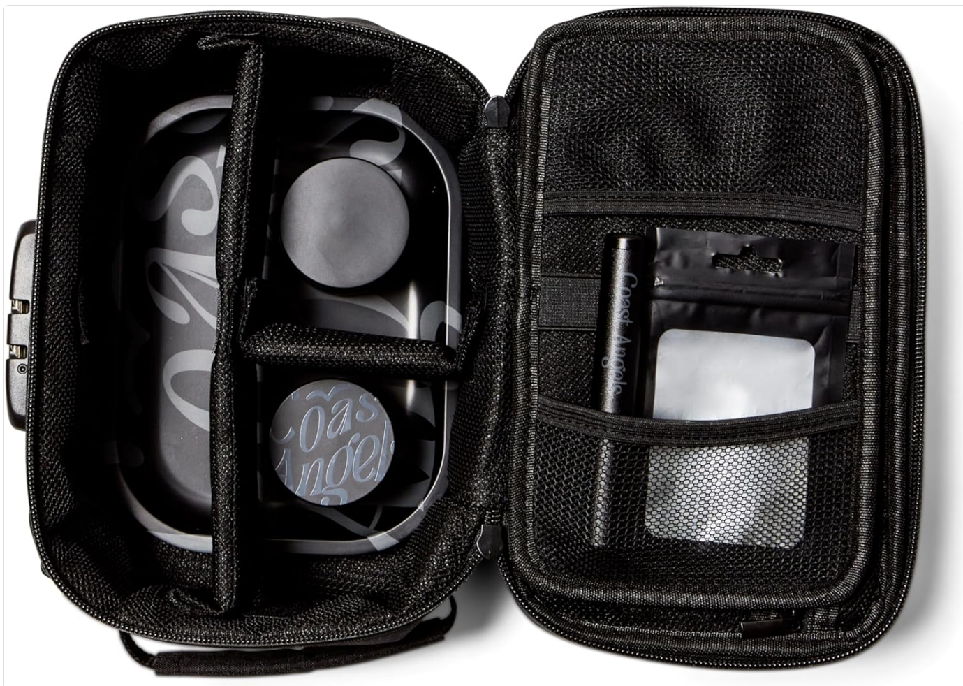
Figure 5: Example of organized components within the bag's compartments.