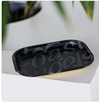
Figure 7: The rolling tray for preparation.