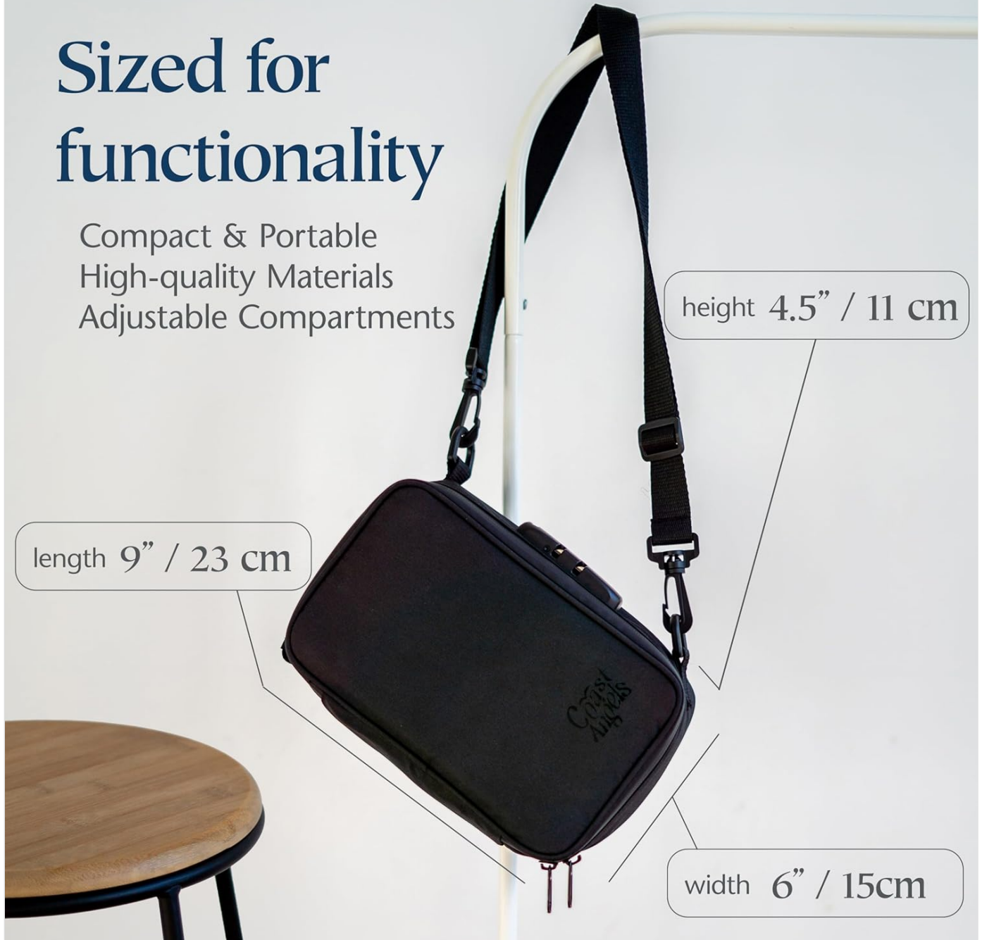
Figure 9: Dimensions of the Smell Proof Bag for functionality and portability.

Compact & Portable High-quality Materials Adjustable Compartments