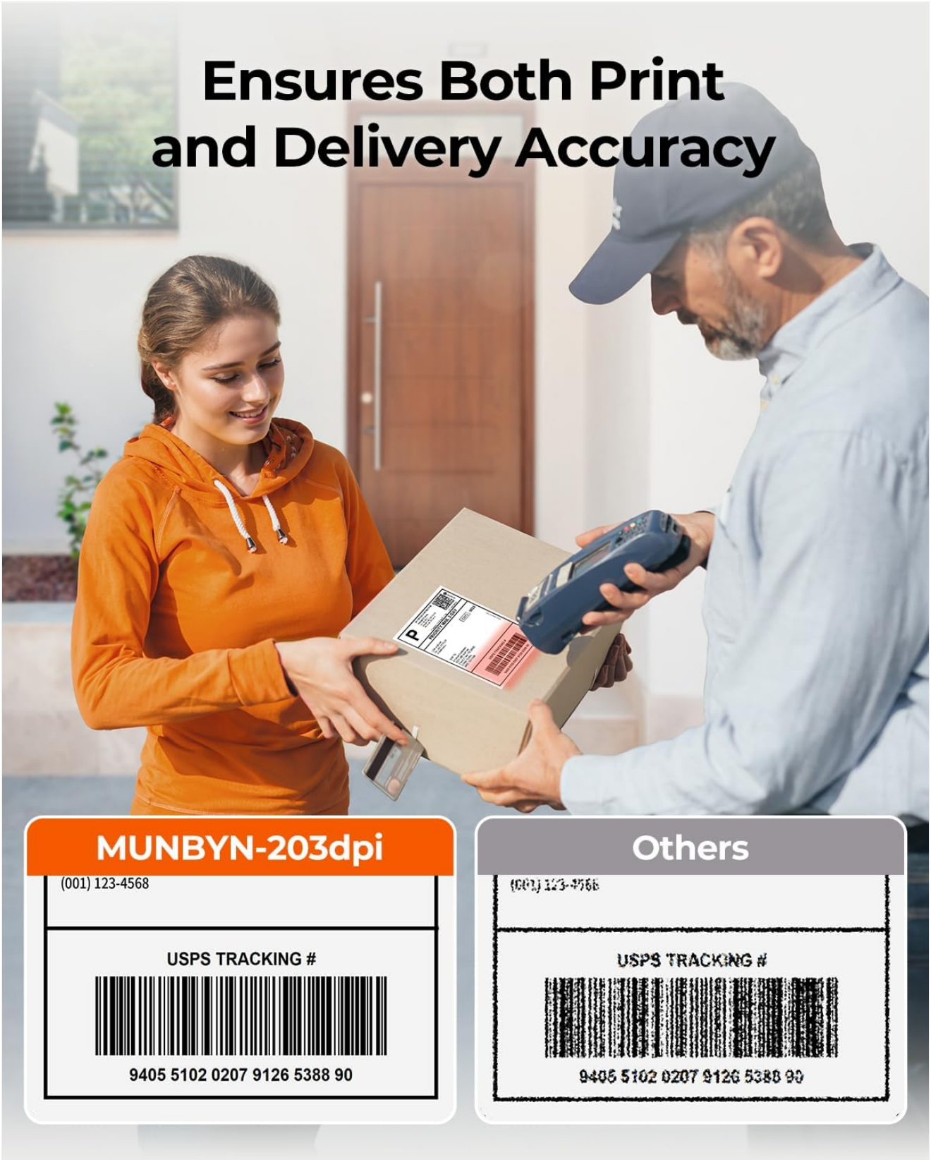
Image: Comparison of print quality, highlighting the clarity of MUNBYN 203dpi output. Tracking number: 9405 5102 0207 9126 5388 90.