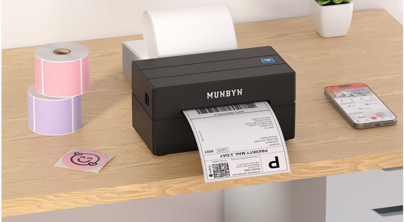
Image: Printer showing compatibility with various shipping platforms.