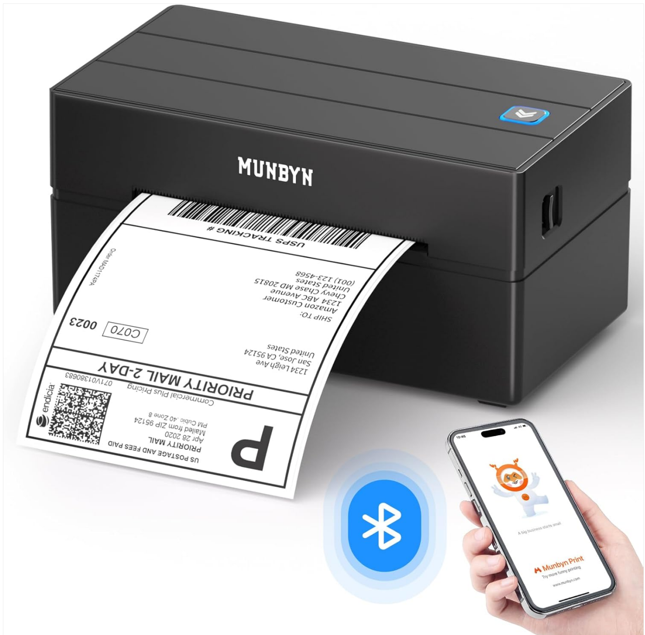
Image: The MUNBYN Bluetooth Thermal Label Printer in black.