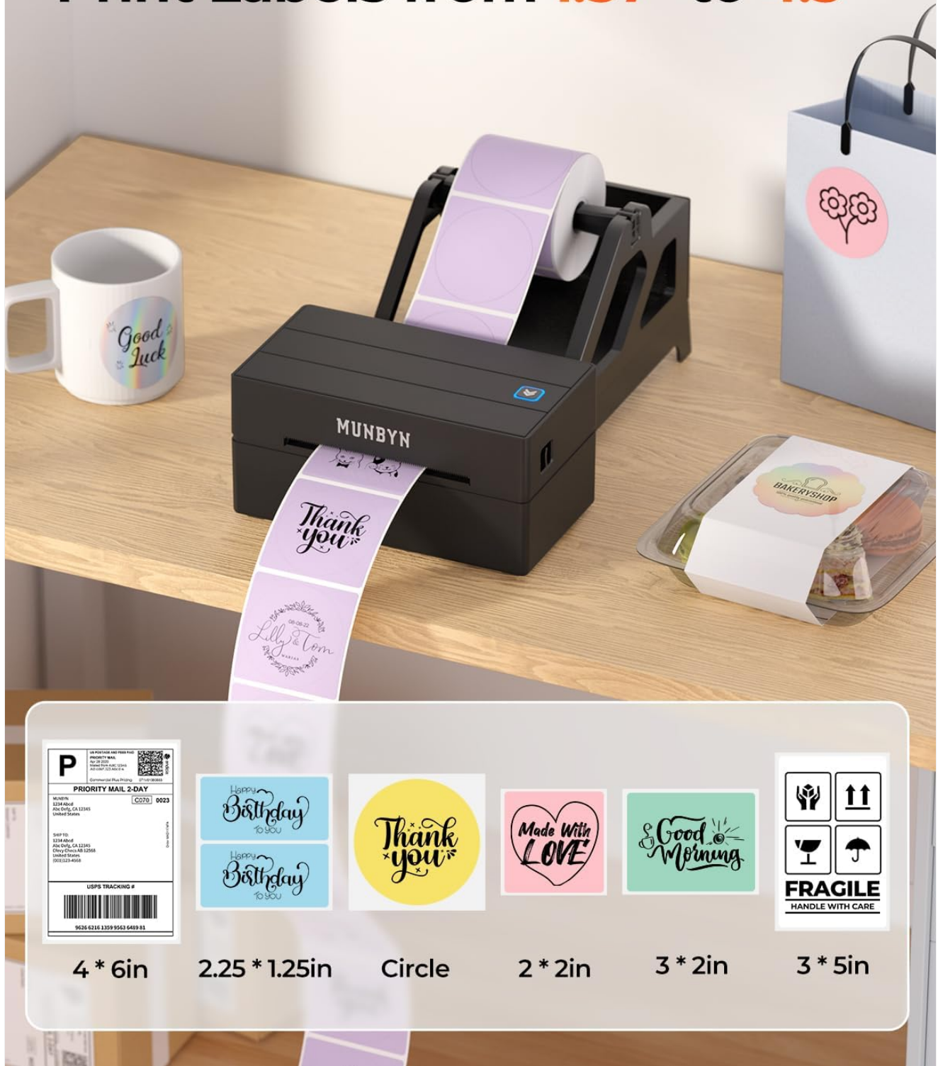
Image: Printer demonstrating various label sizes.