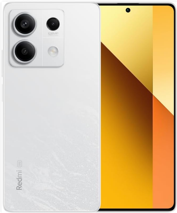
Figure 3.1: Front and back view of the Xiaomi Redmi Note 13 5G, showcasing its sleek design and camera module.