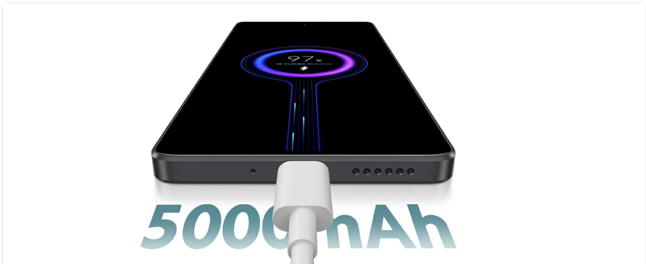
Figure 4.1: The Redmi Note 13 5G connected to a charger, illustrating its 5,000 mAh battery capacity.