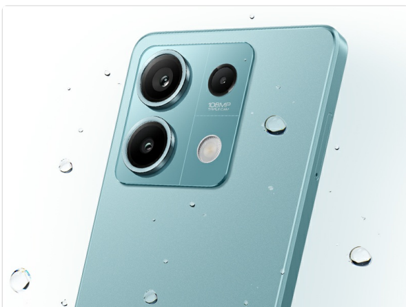
Figure 3.3: The device's camera module with water