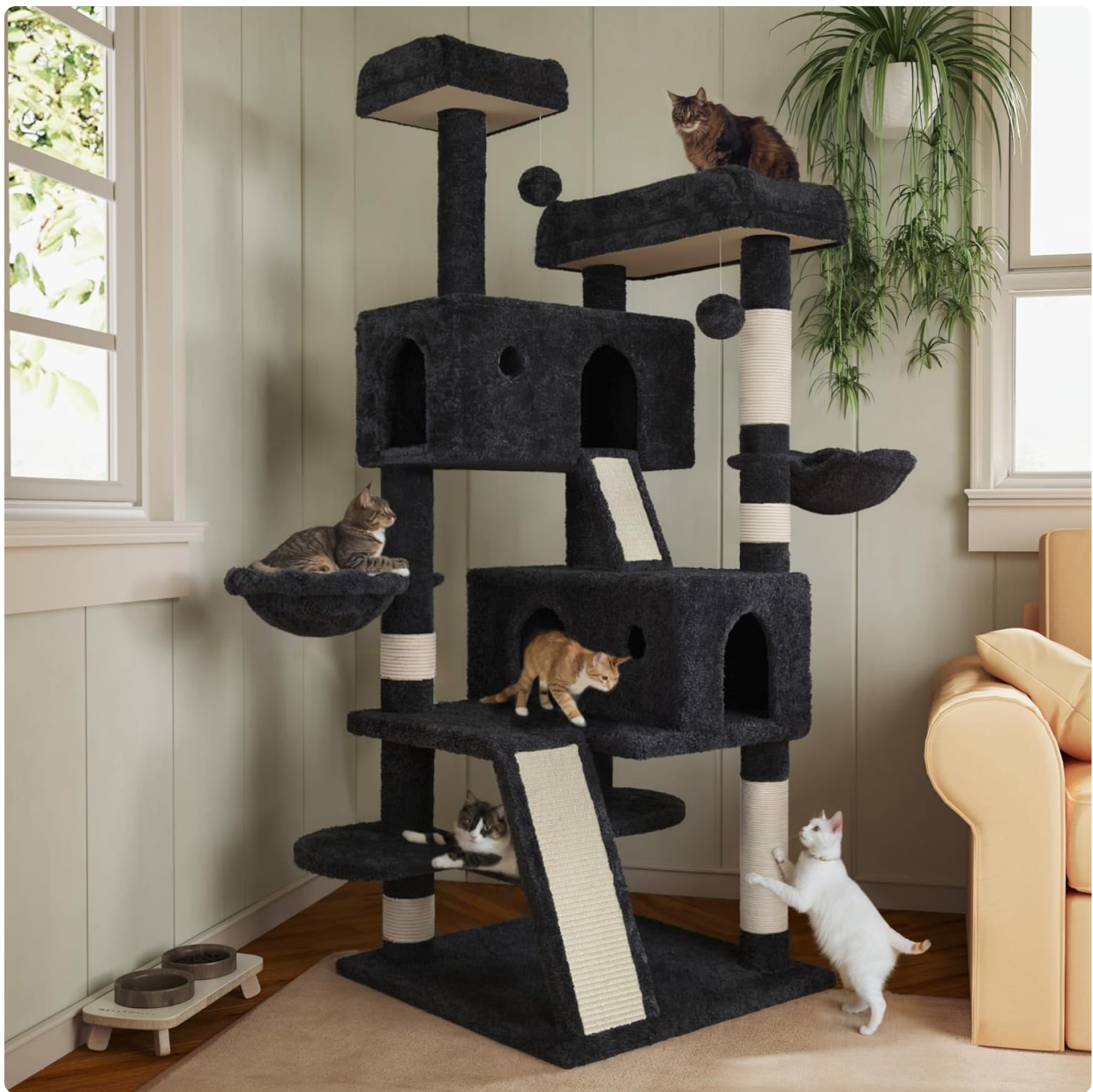
Image 1: The MUTICOR 66-Inch Multi-Level Cat Tree Tower, showcasing its various platforms, condos, and scratching posts.