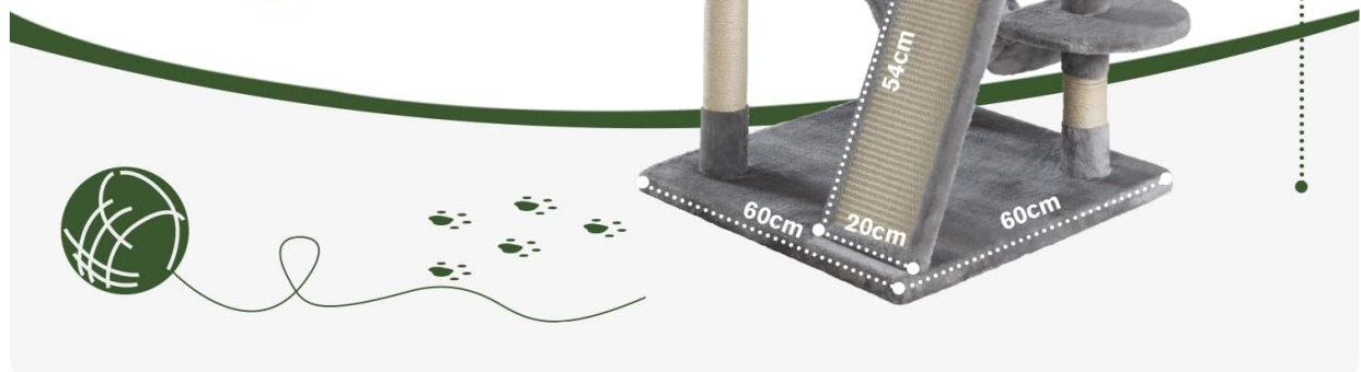
Image 5: Comprehensive dimensions diagram of the cat tree, illustrating various measurements for platforms, condos, and overall structure.