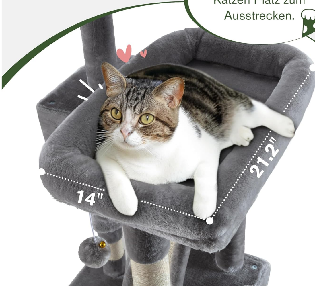
Image 4: A cat enjoying the spacious top perch, designed to accommodate larger felines.