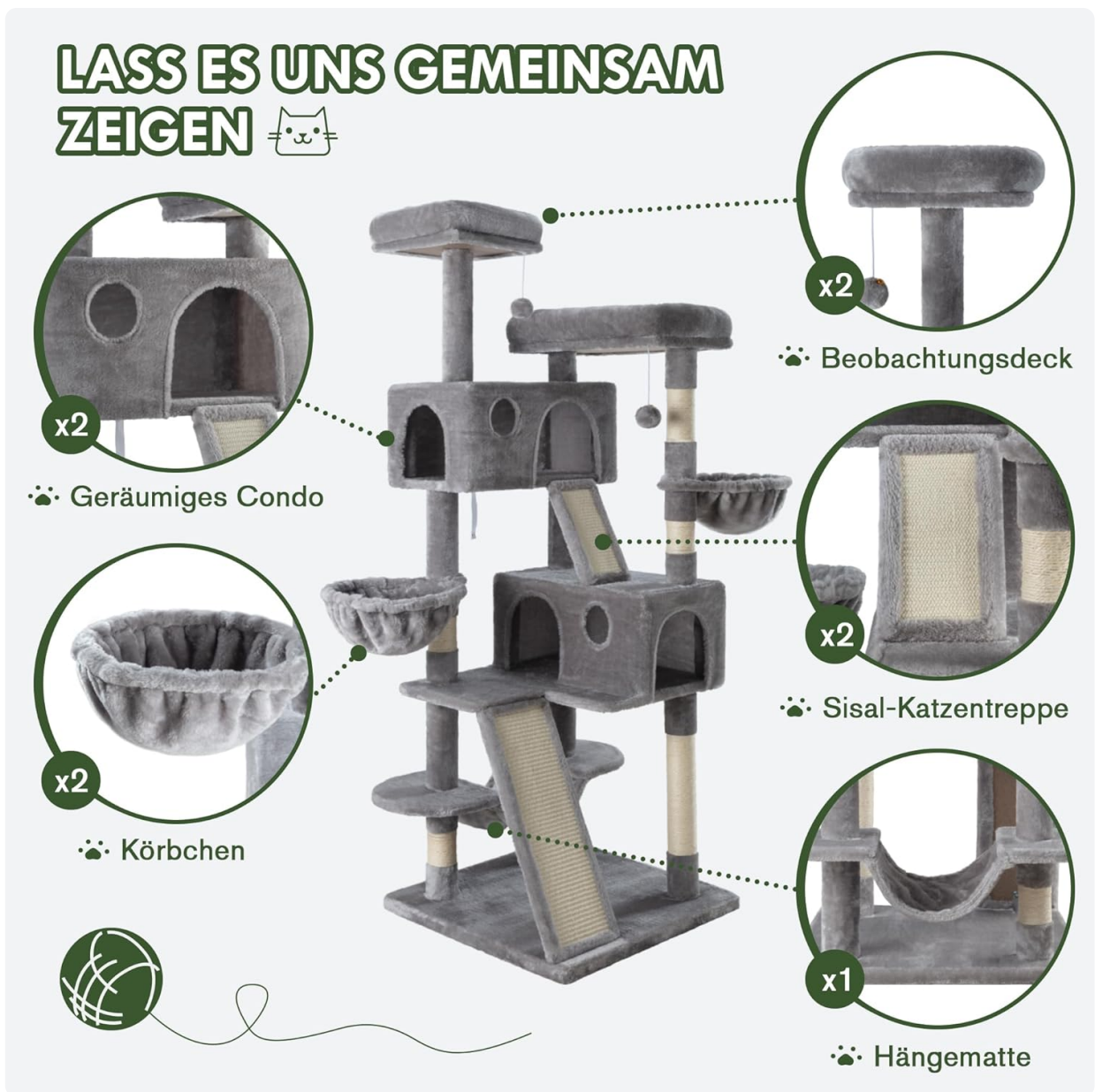
Image 3: Exploded view showing all individual parts of the cat tree, such as observation decks, condos, baskets, sisal scratching ramps, and a hammock.

The package should include various platforms, scratching posts, condos, hammocks, baskets, and all necessary hardware (screws, bolts, Allen wrench). If any parts are missing or damaged, please contact customer support.