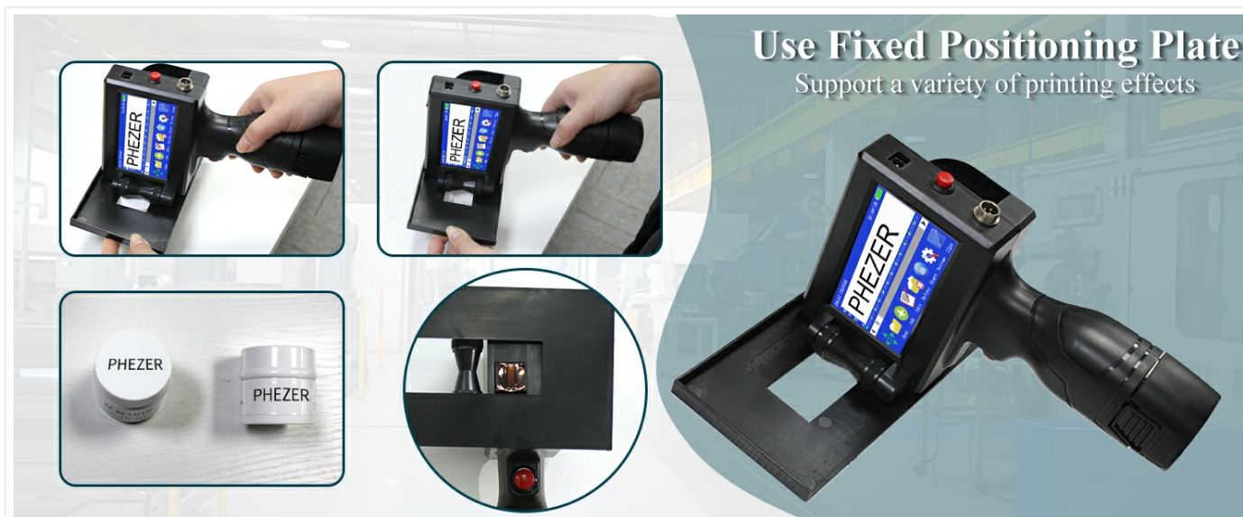
Utilizing the fixed positioning plate for consistent printing results.