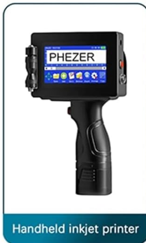
Handheld inkjet printer