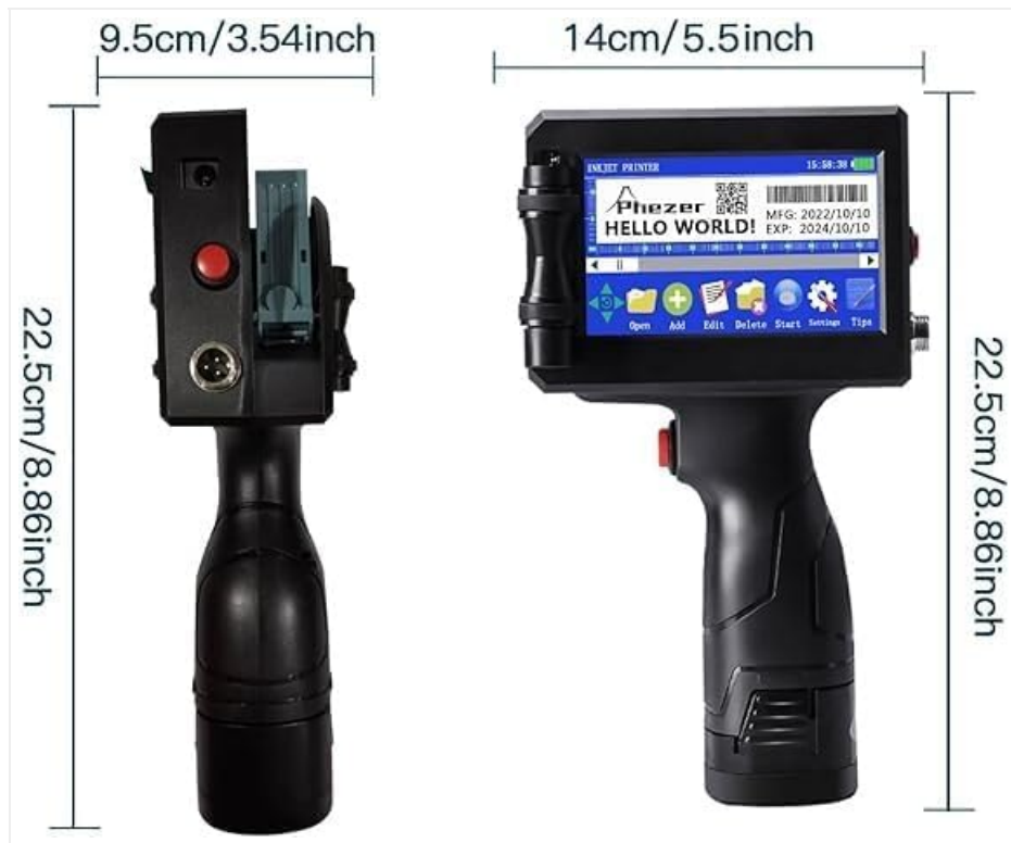
Physical dimensions of the Phezer P15 printer.