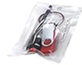
USB Driver Touch Pen