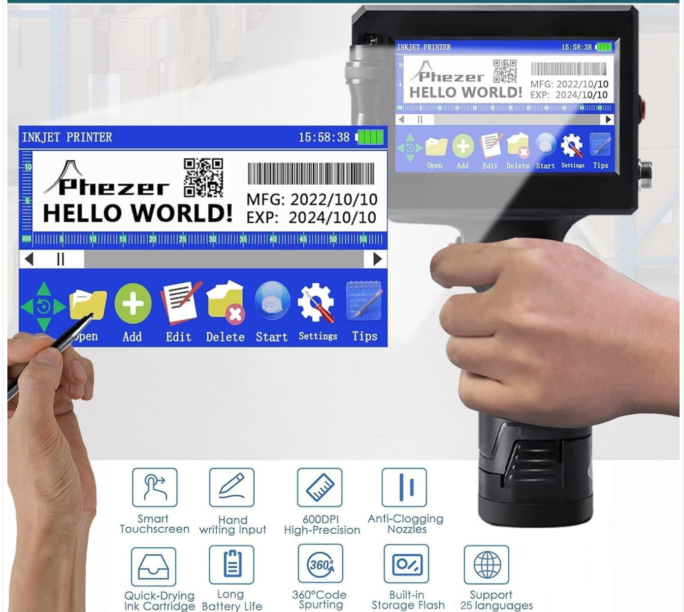
The Phezer P15 Handheld Inkjet Printer with its intuitive 4.3-inch touch screen interface.