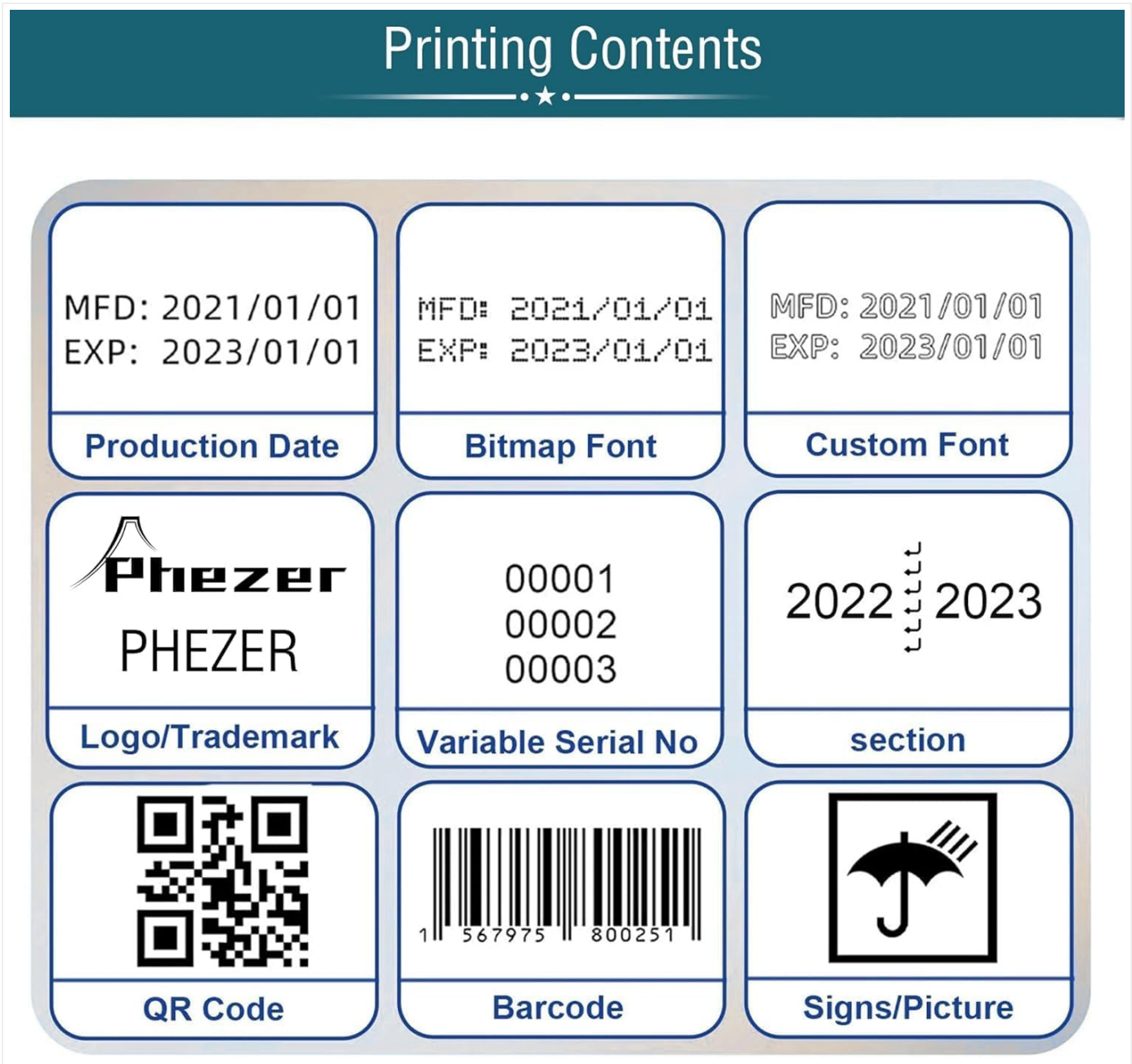
The Phezer P15 supports printing various content types, including dates, fonts, logos, serial numbers, QR codes, and barcodes.