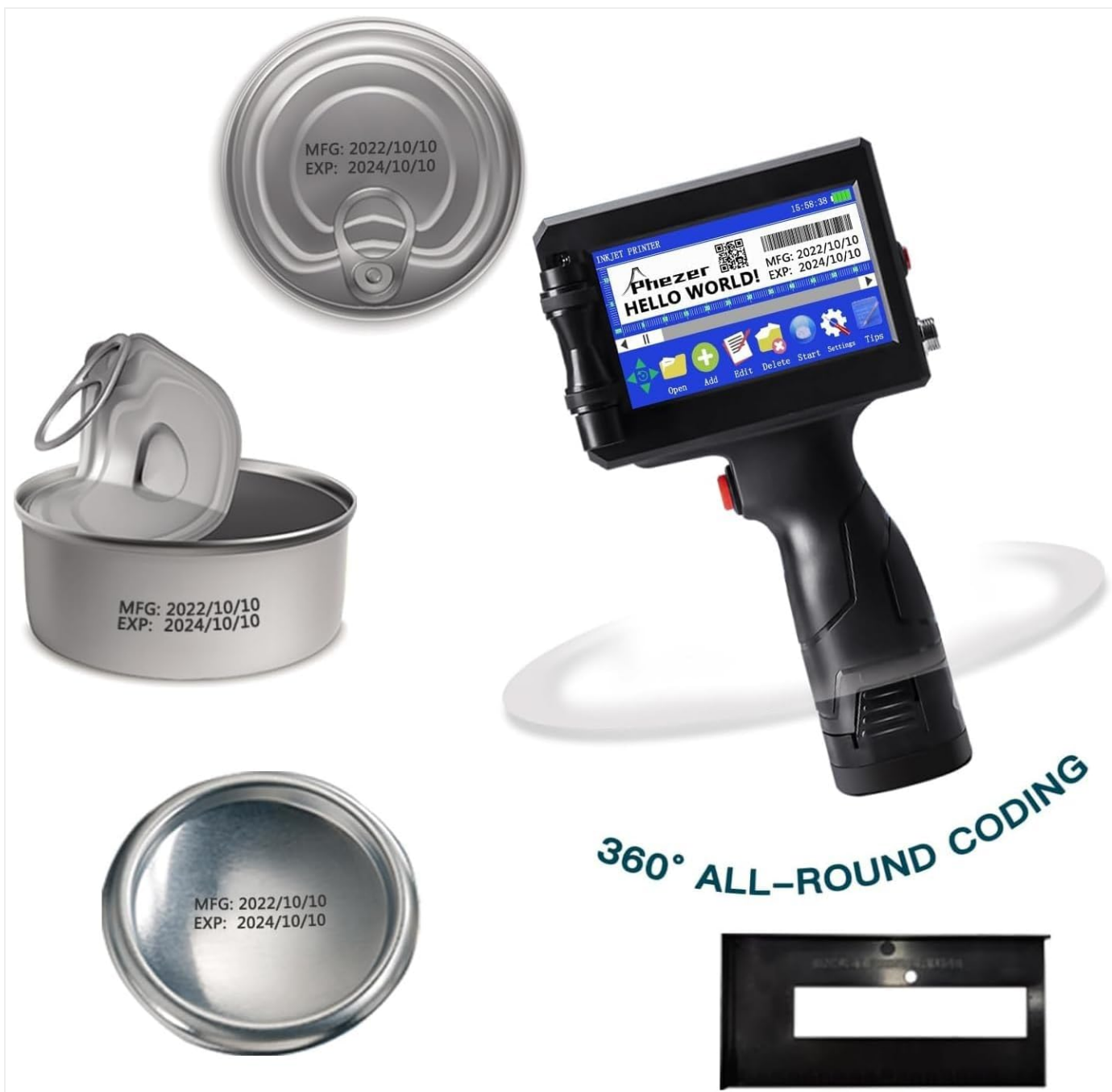
The printer supports 360-degree all-round coding for versatile application.