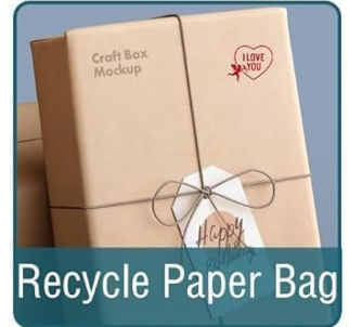
Recycle Paper Bag